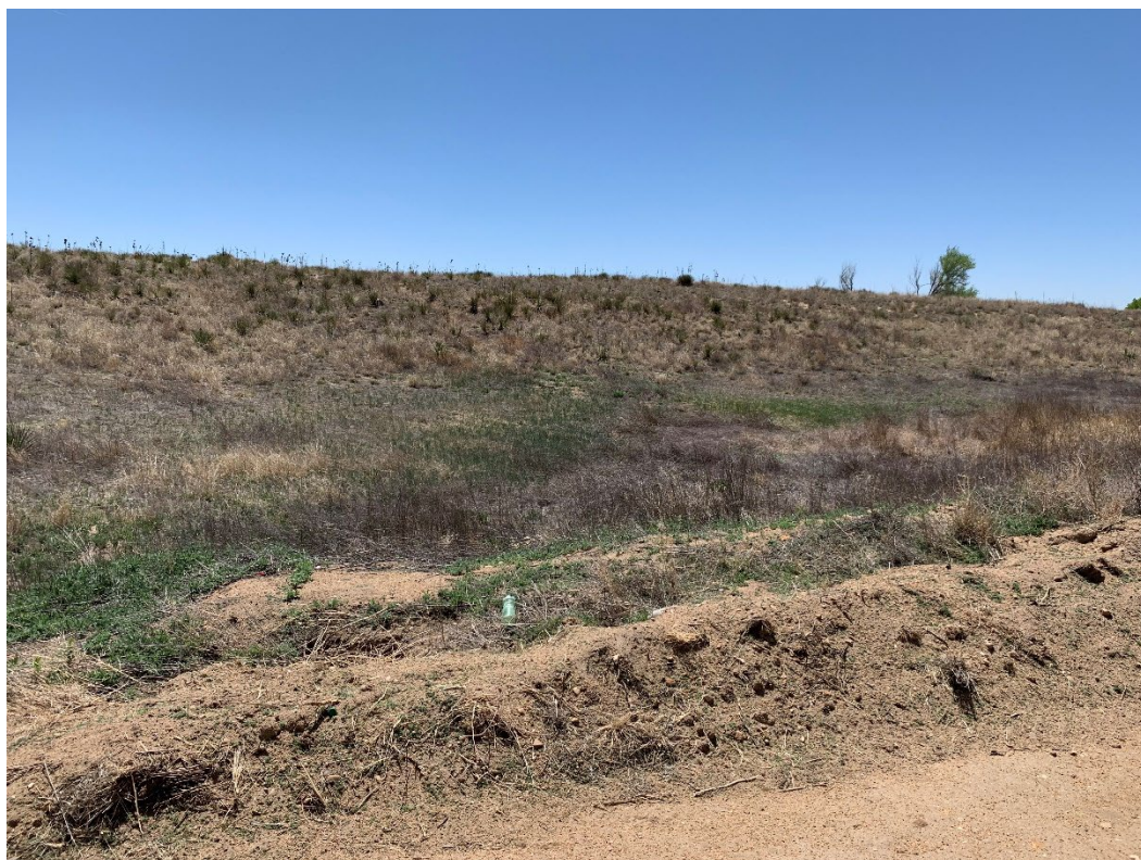
Photo 4 – Topsoil stockpile in south mining area along south boundary