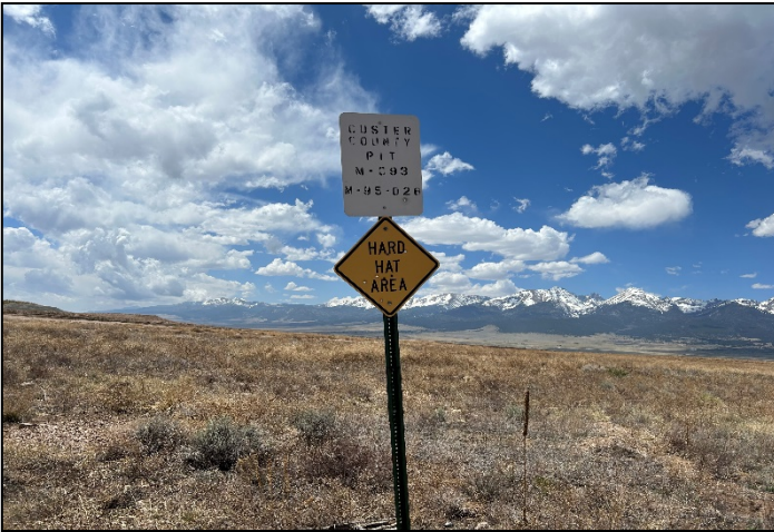
Photo 1 – Site identification sign at site entrance on south side of CR 328.