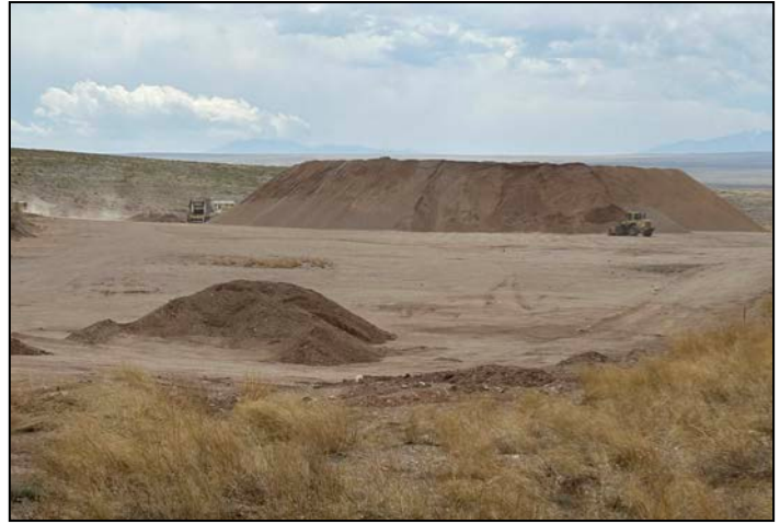
Photo 2 – Mining and stockpile activity in SW and South Center of permit area during inspection.

The following list identifies the environmental and permit parameters inspected and gives a categorical evaluation of each