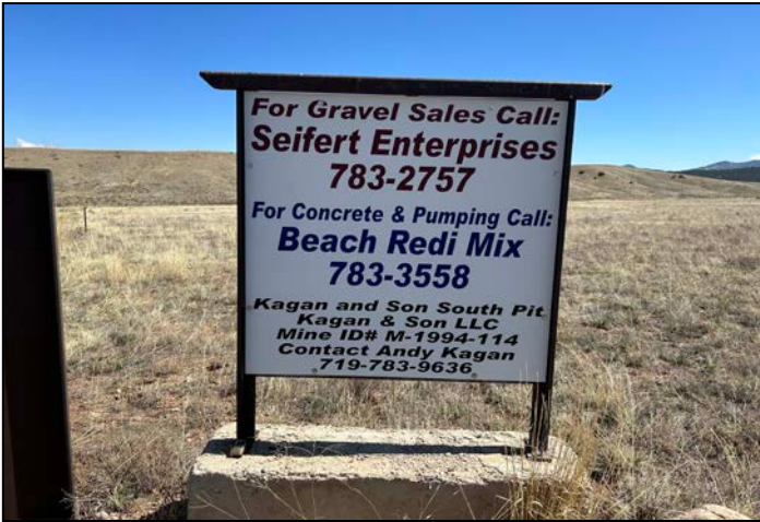
Photo 1 – Site identification sign at site entrance on south side of County Road 305.