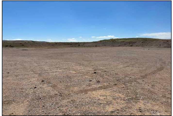
Photo 2 – Pit floor looking from north to southwest. No mining activity was taking place at the time of this inspection, and topsoil stockpiles are located around perimeter.