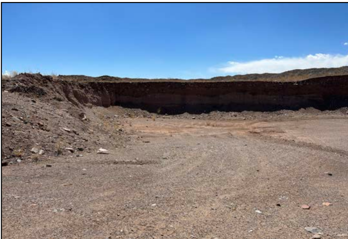
Photo 3 – Most recently active mine face with approximately 20' high-wall located in southeast corner of affected area.