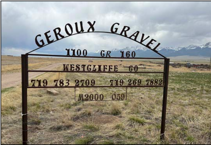
Photo 1 – Site identification sign at entrance from County Road 160