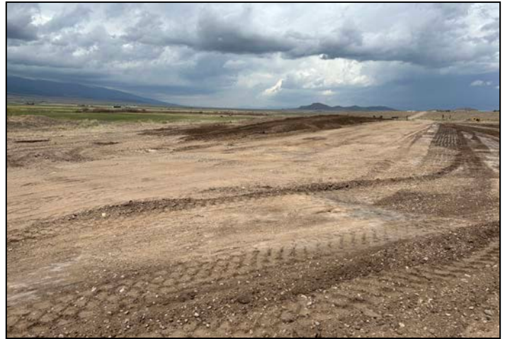
Photo 2 – Stripping and stockpiling of topsoil as required on north end of permit prior to mining.