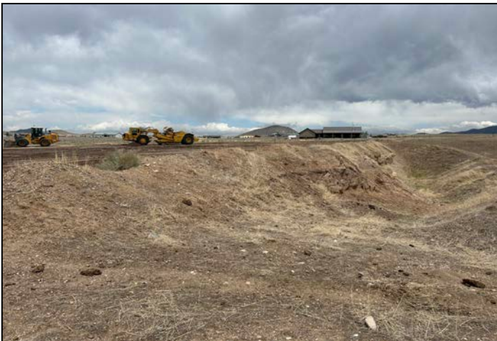
Photo 3 – Approximately 3.5 acres remains to be mined and reclaimed at north end of existing permit.