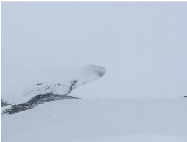
March 31, 2023-Seepage Area