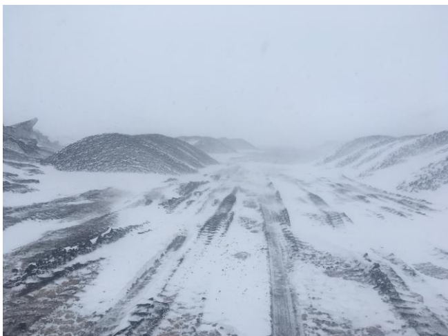
March 31, 2023- Expansion Area