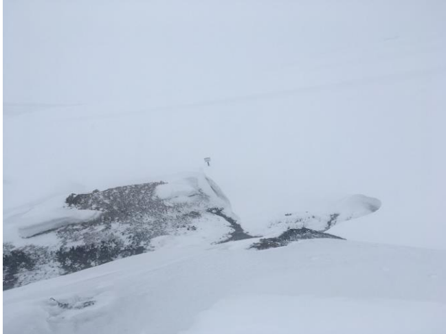
March 31, 2023-Drain Outlet and Seepage Area