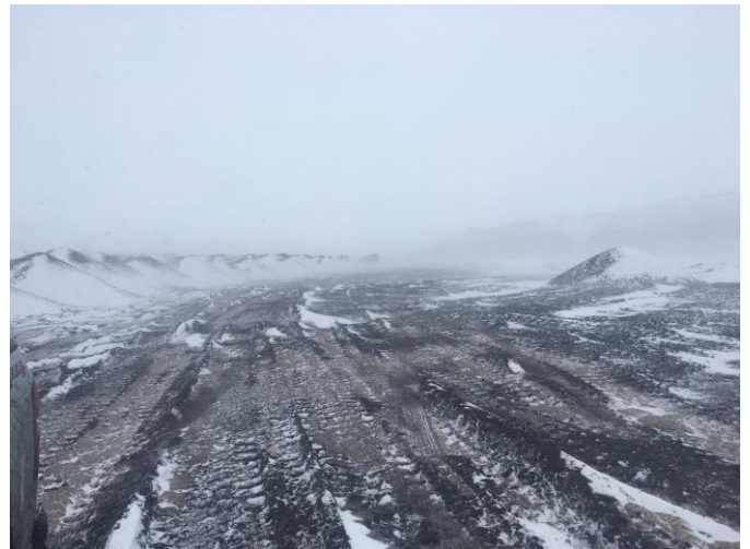
March 31, 2023- Expansion Area