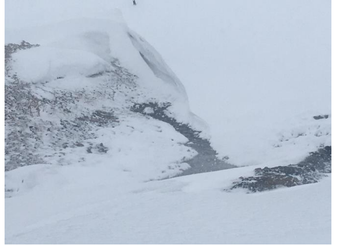
March 31, 2023-Drain Outlet