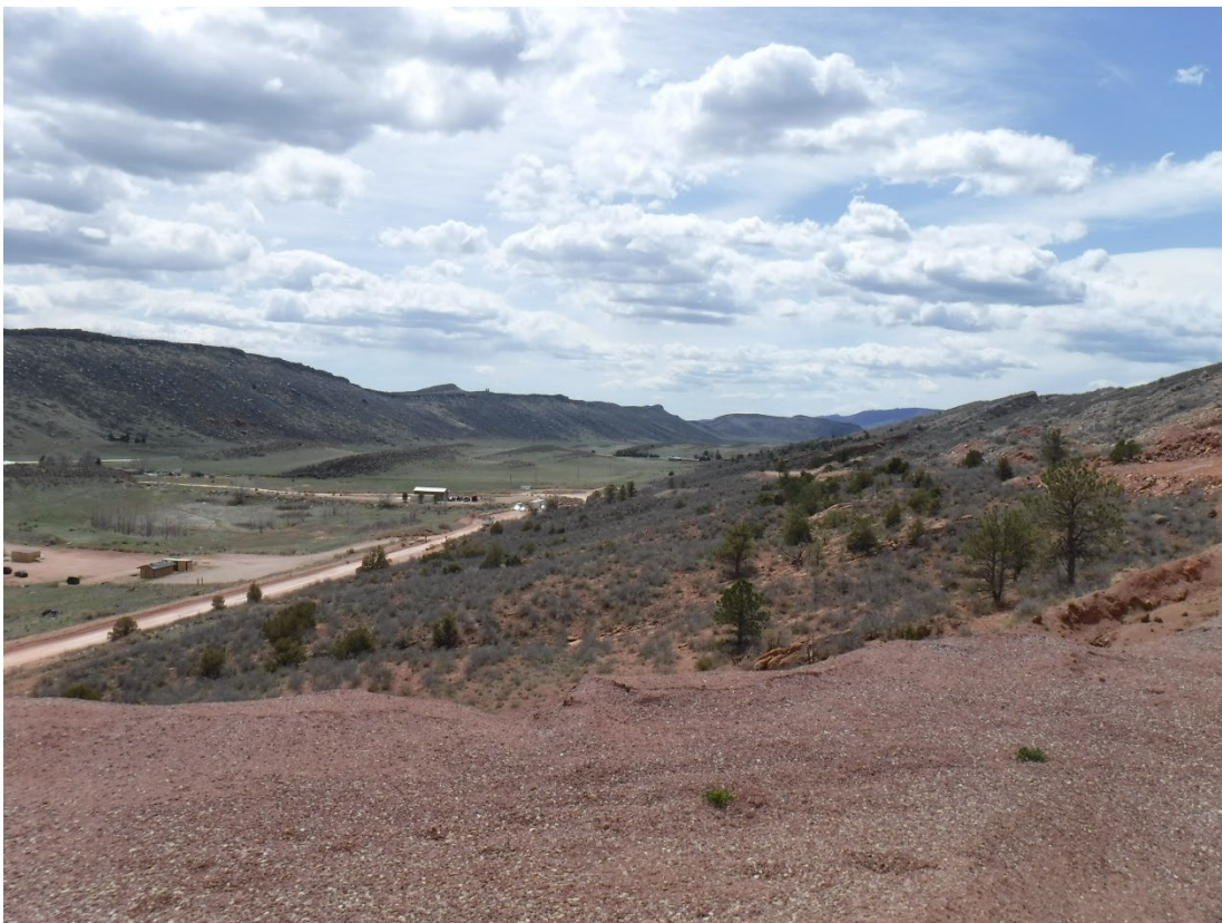
Photo 10: Looking south towards the mine entrance, gun range to the left of photo