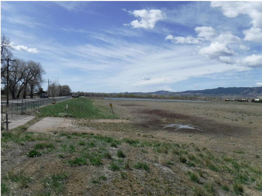
Photo 6: Looking south eastern permit boundary, ponded water from rain that fell overnight