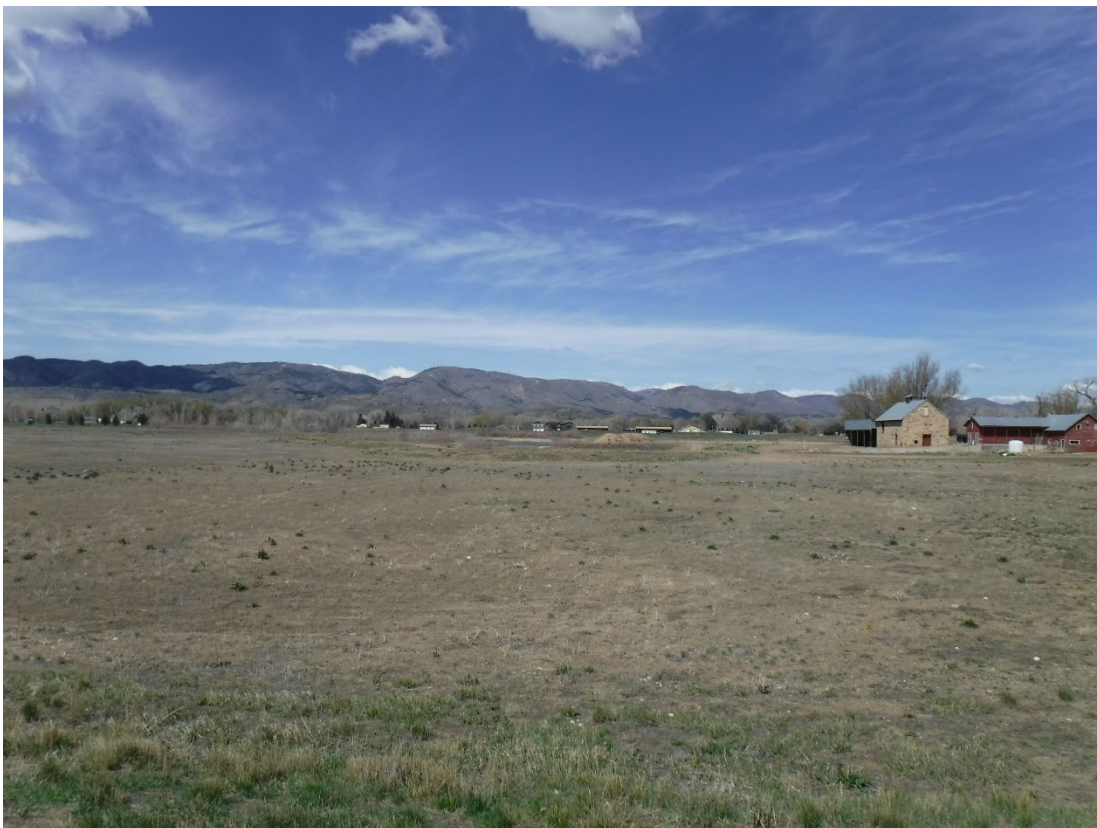
Photo 4: Looking west across the eastern permit area towards the reservoir