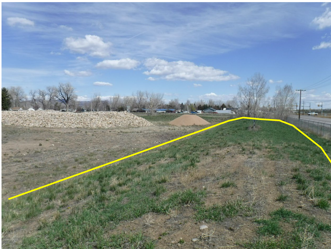
Photo 2: Looking north from near the mine entrance along the topsoil berm, yellow outline