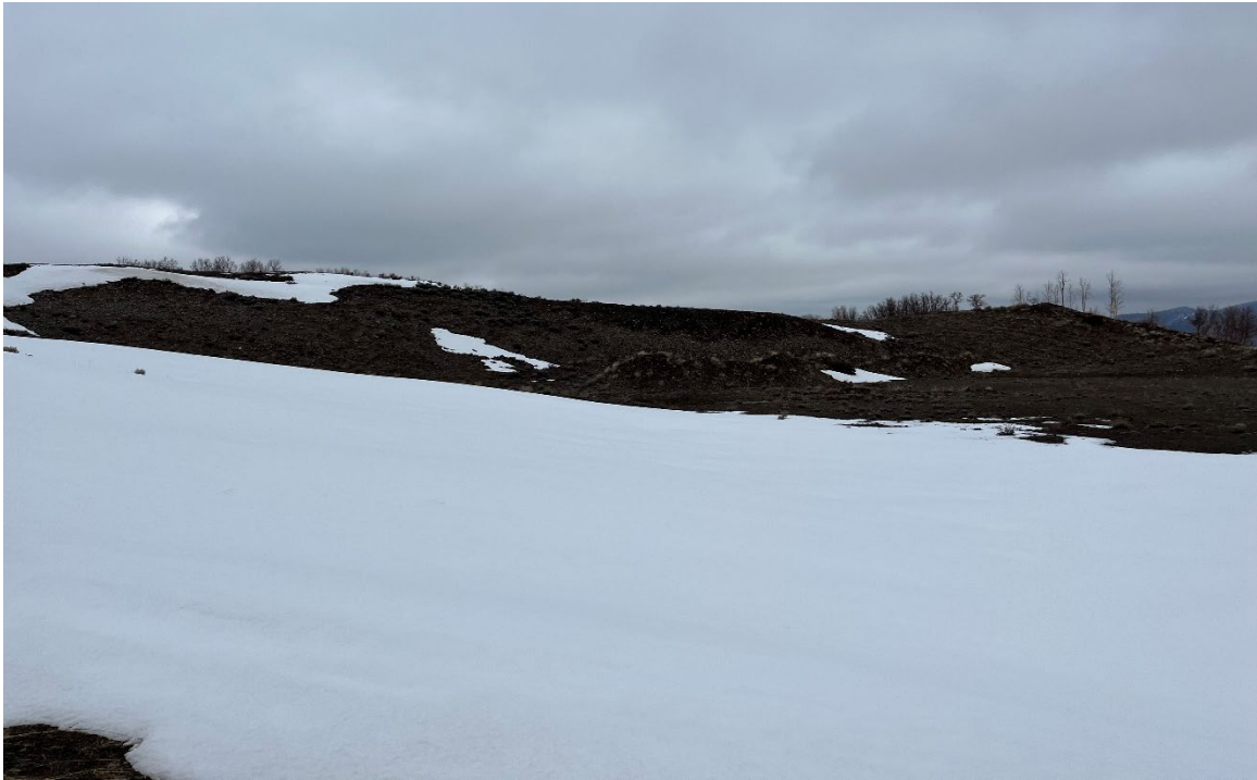
Photo 6: View north of the upper pit's 'highwalls'. Slopes were approximately 2:1.