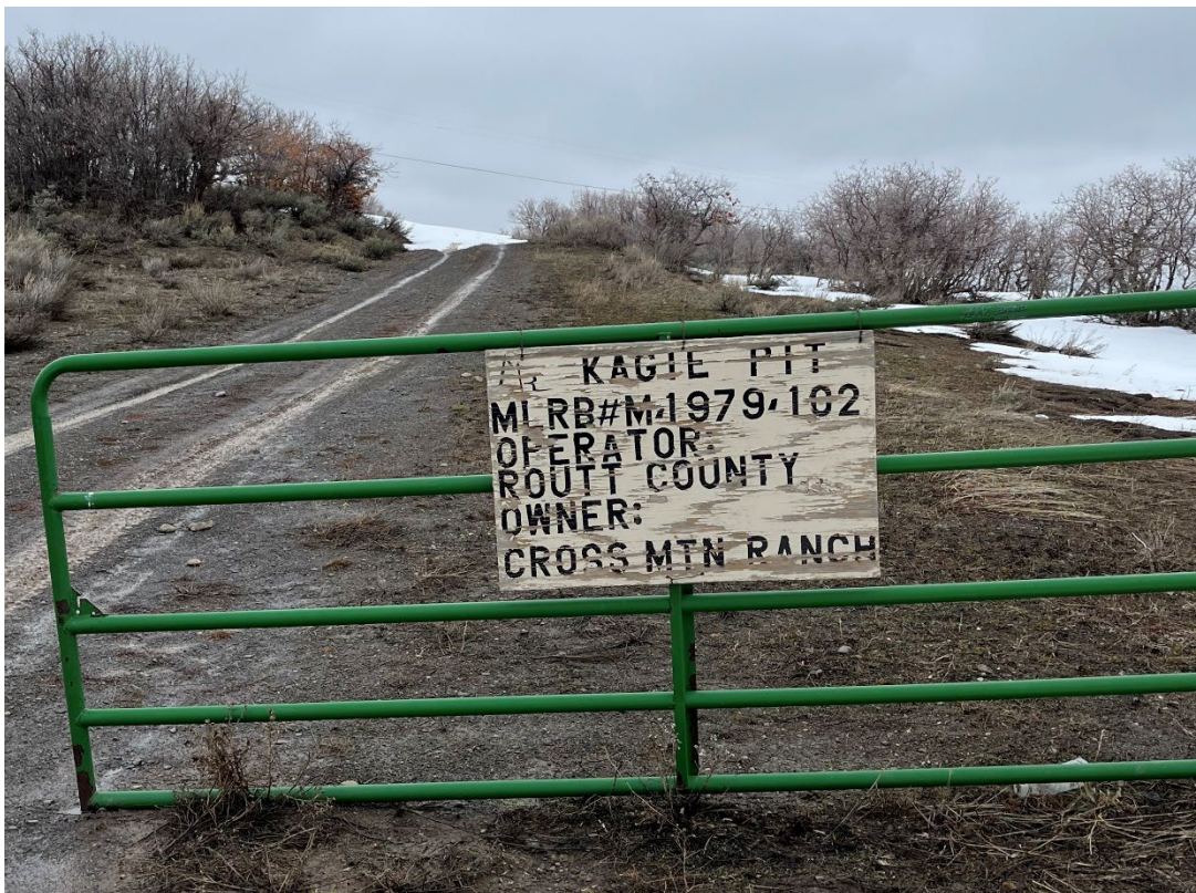
Photo 1: Mine sign posted at the entrance. Needs to be updated to reflect operator changes made under revision SO1.