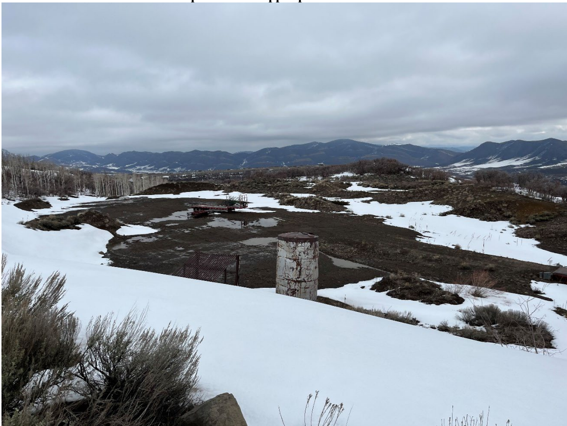
Photo 3: View north of the empty tank, grizzly bars, and assorted equipment being stored in the lower pit area.