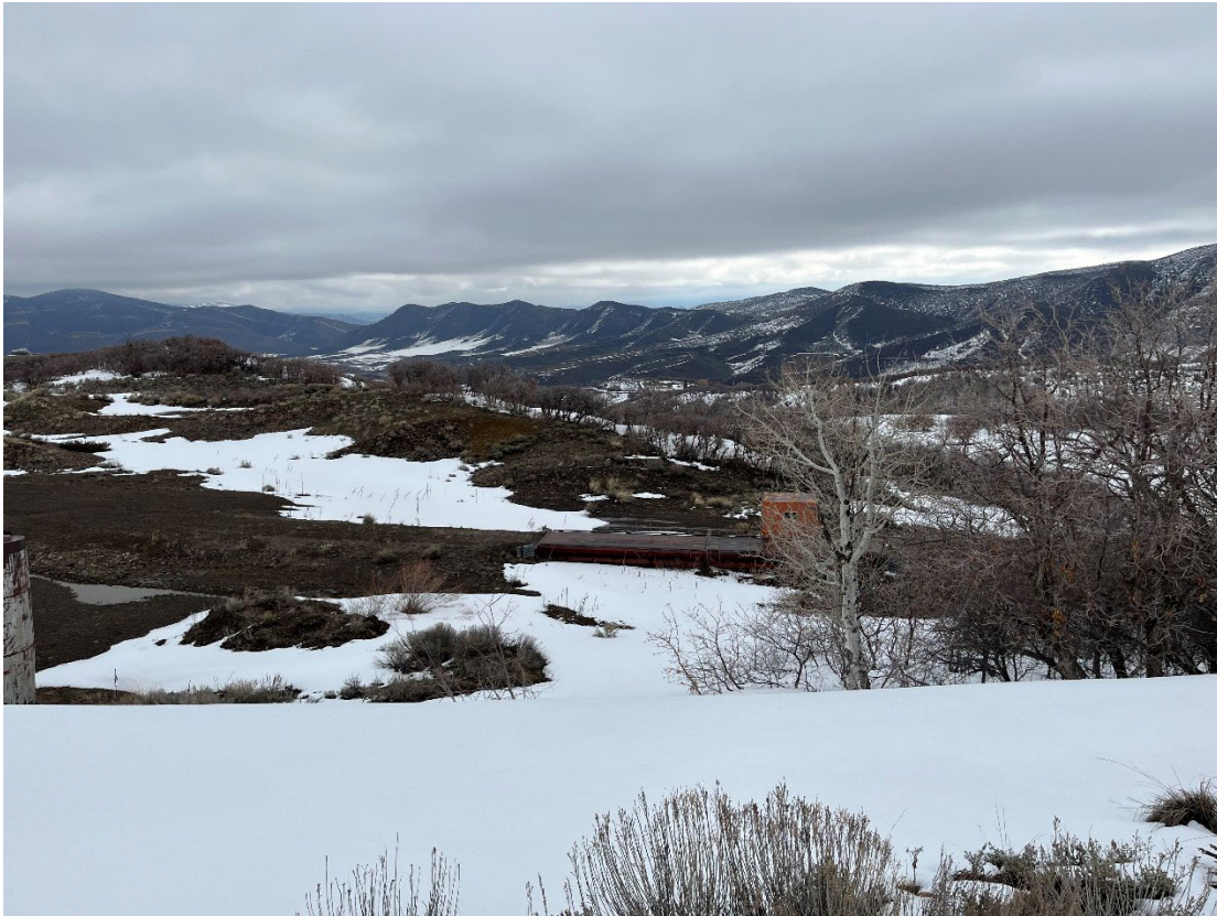
Photo 2: View of the lower pit from the upper pit area. Scale and scale house are visible.