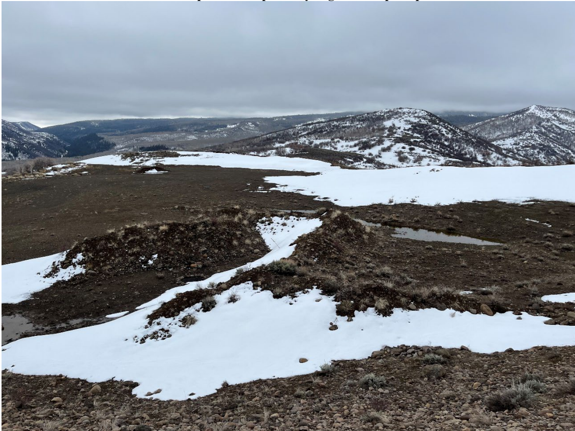
Photo 5: View southwest of the upper pit taken atop the 'highwall'. A partially vegetated stockpile is visible in the foreground and a small stockpile of pea gravel is visible in the background to the east.