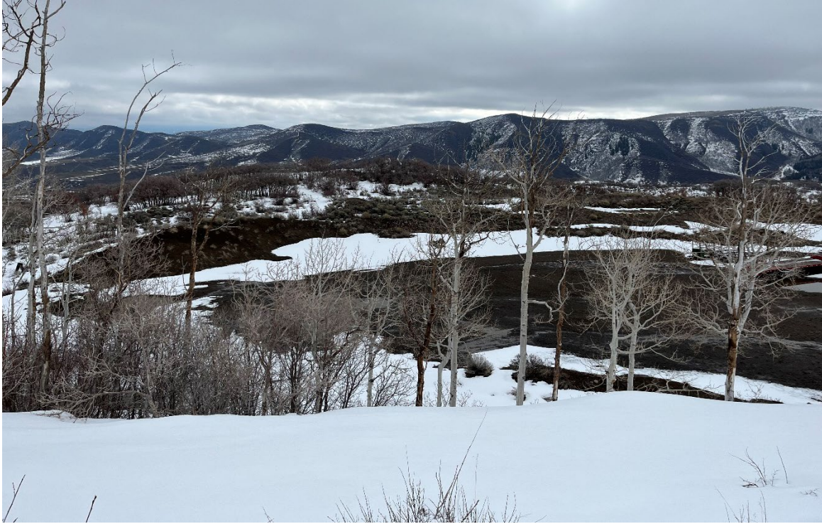
Photo 4: View east of the lower pit area. A partially vegetated topsoil pile is visible to the north.