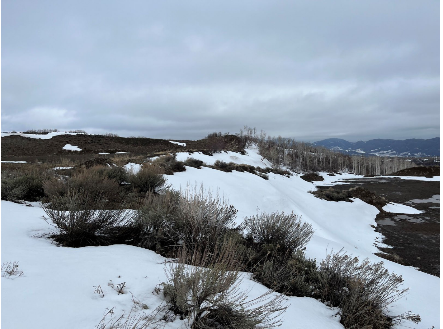
Photo 8: View north atop the ridge between the upper and lower pit sections. The ridge is undisturbed.