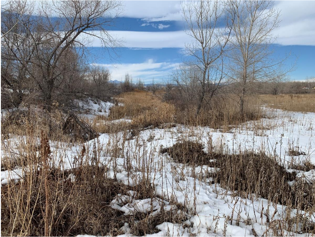
Photo 2 – From the center of the pit area, looking west towards pond 1