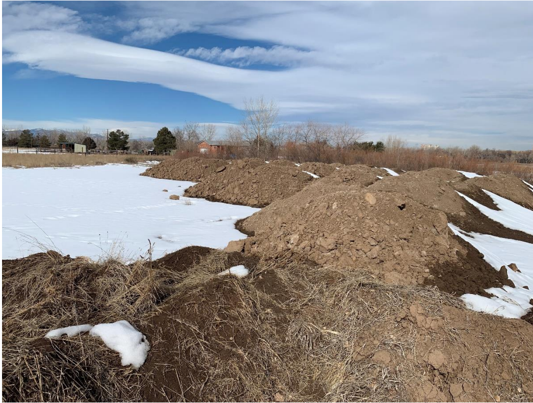
Photo 4 – Soil piles on the southwest corner of the southeast pond