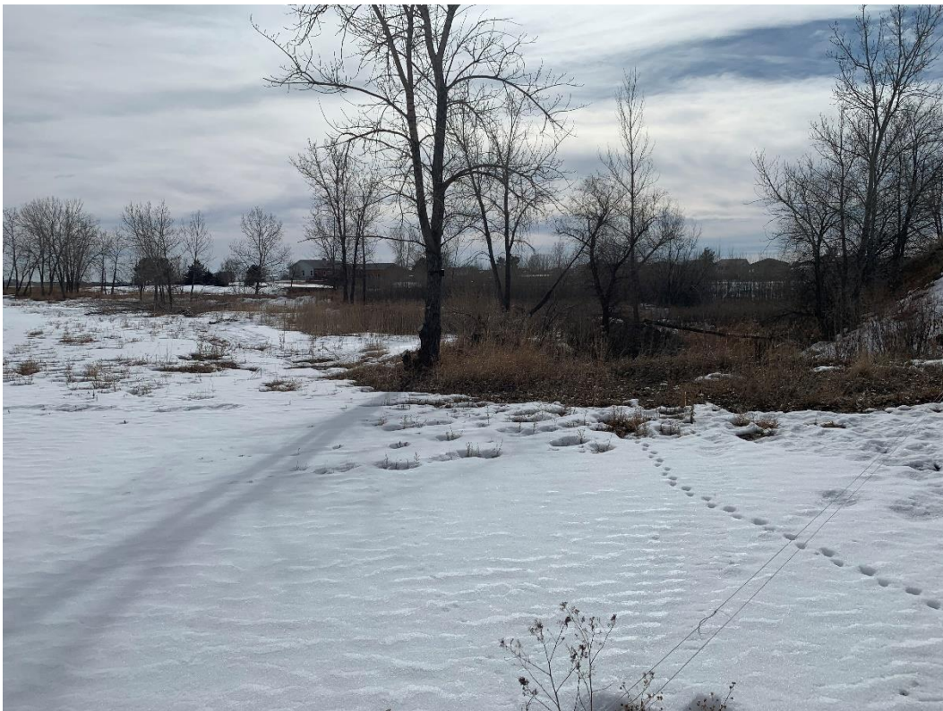
Photo 3 – From the center of the pit area, looking east towards ponds 2 and 3