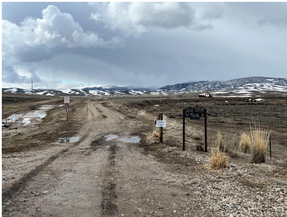
Photo 4: View south of the southern entrance to the Tracks-to-Trails area previously released from this site. Rail Loop Pond 002 is accessed by walking this loop.