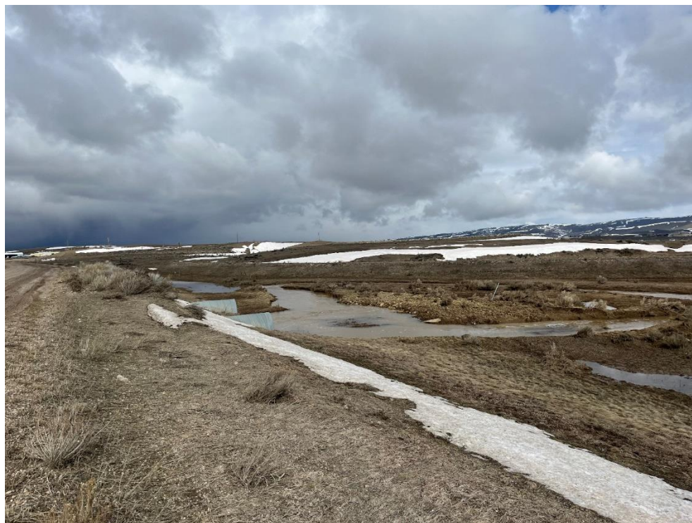
Photo 7: Culverts were functioning properly in the Tracks-to-Trails area. Rail Loop Pond 002 is located behind the berm located in the foreground.

Number of Partial Inspection this Fiscal Year: 7