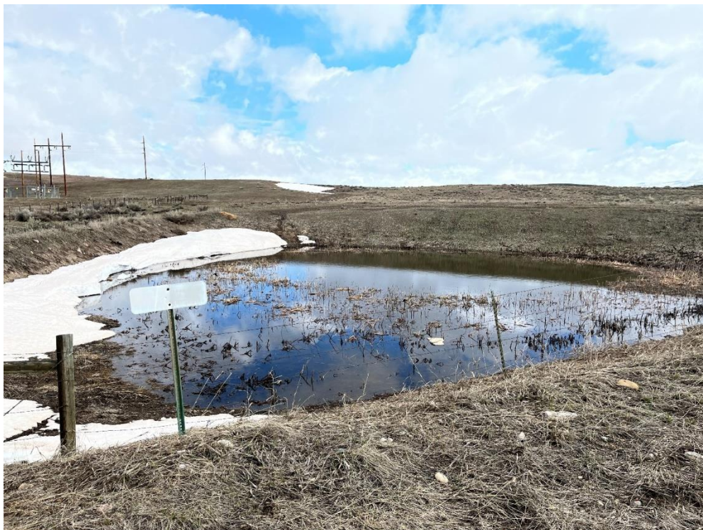
Photo 6: Truck Loop Pond 001. A faded mine identification sign is present in front of the pond.