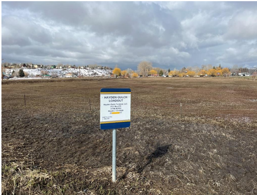
Photo 2: Mine sign located at the northern entrance to the site, directly off Hwy 40.