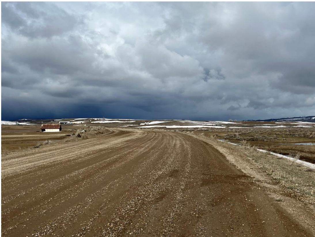
Photo 3: View west, the haul road is well maintained and free of erosional features.