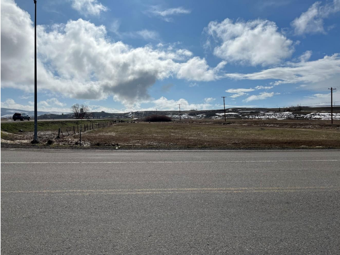
Photo 8: View east of currently unreleased agricultural use area. Unreleased area begins at the northern entrance to the Sage Creek Trail off Hawthorne St. / CR 37 and extends across Hwy 40, curving to the northeast.

Number of Partial Inspection this Fiscal Year: 7