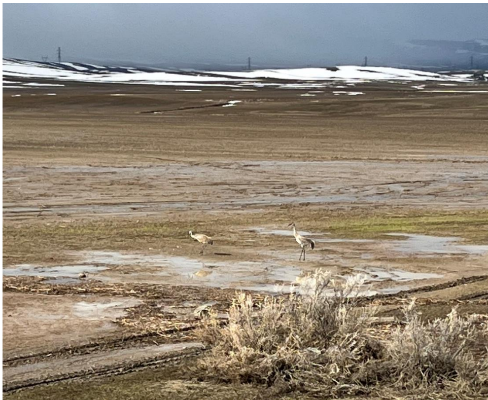
Photo 5: Two migrating Sandhill Cranes were seen in and around the southern boundary of the site.

Number of Partial Inspection this Fiscal Year: 7