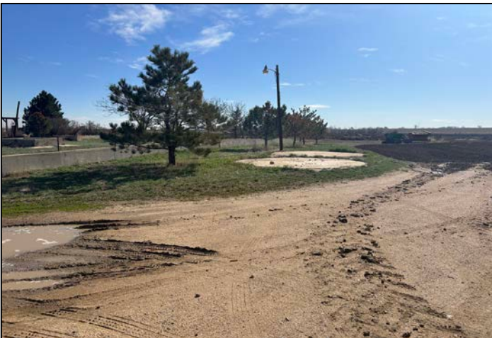
Photo 3 – South end of AR1 release area looking east. New permit boundary is immediately south of concrete silo pad. Disturbed area on right side of photo is reclamation from recently removed oil/gas facility.