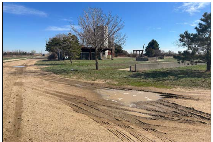
Photo 4 – SW corner of AR1 release area looking north. Permit boundary is on west side of access road.