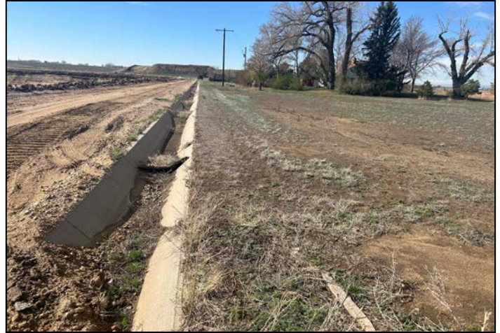
Photo 2 – East side of AR1 release area looking south. N-S permit boundary is between concrete ditch and utility poles.