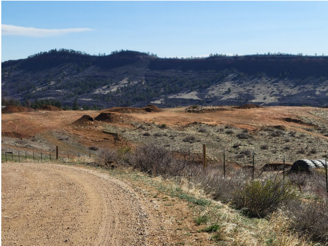
Photo 6. View of OHV recreation area from northwestern boundary of property. Soil has been pushed around to build the OHV trail and jumps.