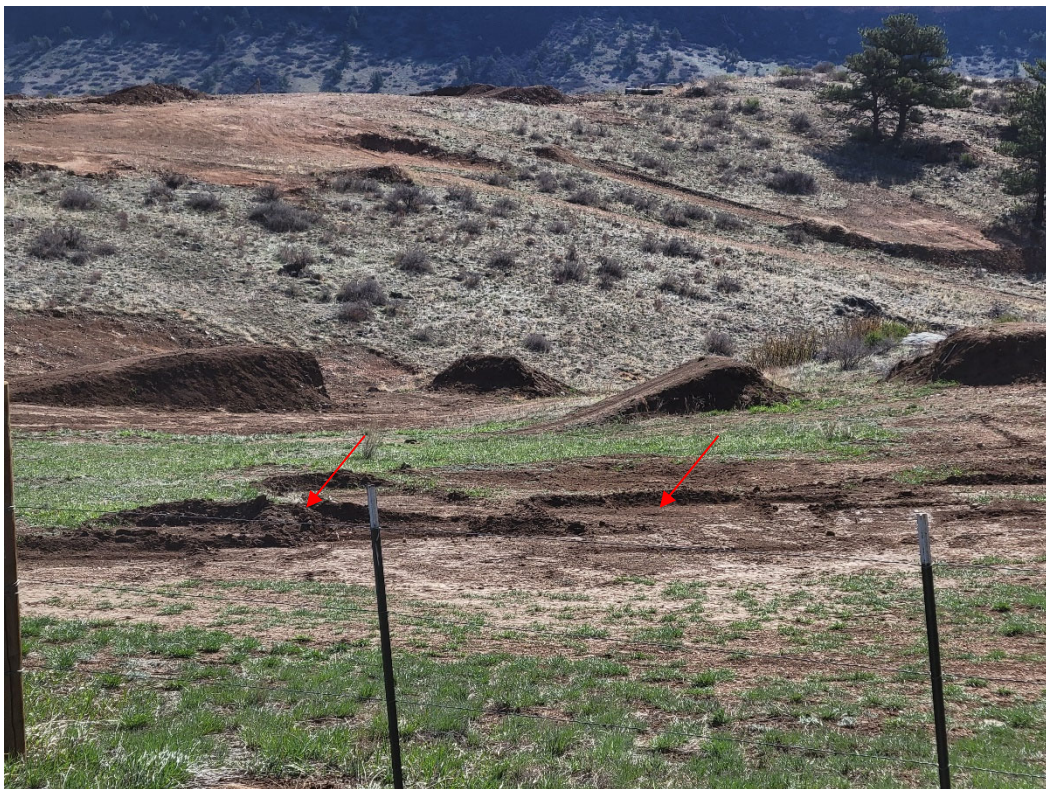
Photo 7. Closer view of the jump area. Red arrows point to one area where the property owner indicated material was excavated to build the jumps in background.