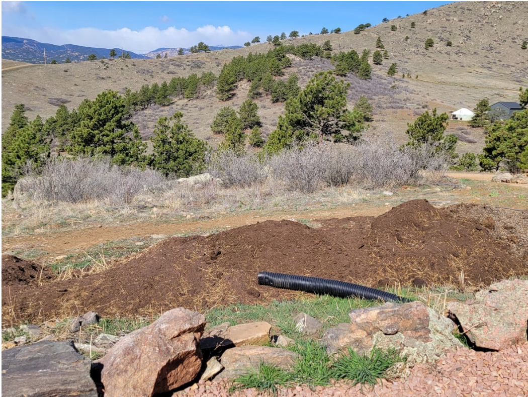
Photo 8. Manure pile next to the driveway near the residence.