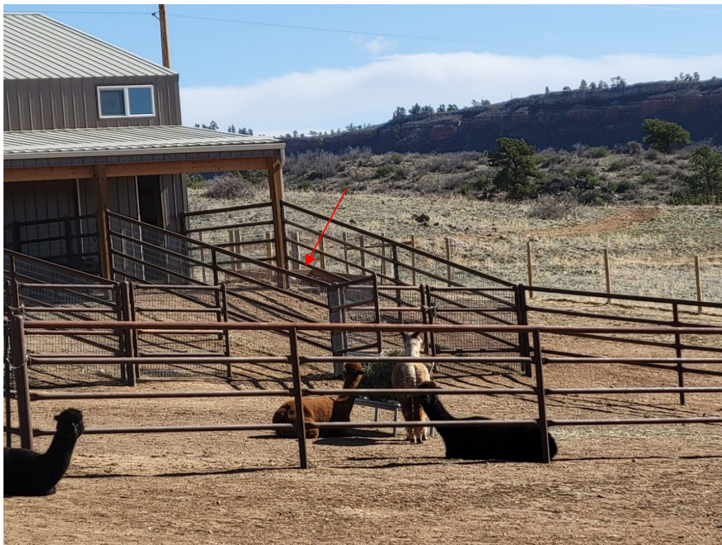
Photo 9. Alpaca corral at 2300 Dry Creek Drive. Arrow points to manure storage area.