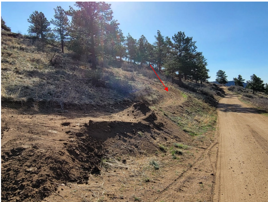
Photo 5. Looking south from the excavated embankment on Mr. Johnson's property next to the road. OHV trail comes through here (red arrow).