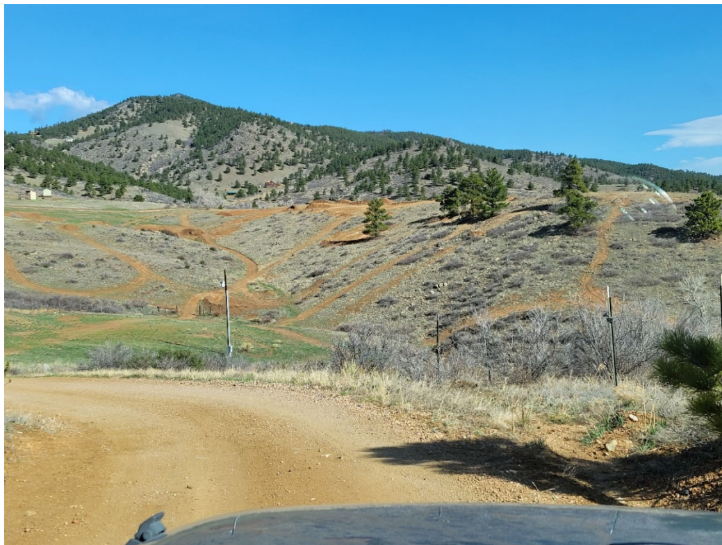
Photo 3. Looking northwest at the OHV recreation area from the driveway at 264 Simple Ranch Road.