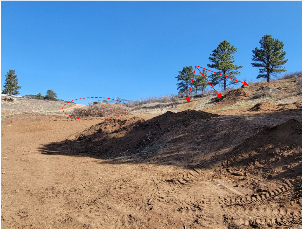
Photo 4. Graded embankment area next to the road on the west side of the property. Brush cleared from this area circled. Arrows point to area where soil was pushed up to form jumps.