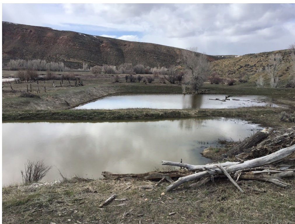
Photo 4: Ponds HR-P1a and HR-P1b located just east of bridge over the Williams Fork River.

Number of Partial Inspection this Fiscal Year: 8