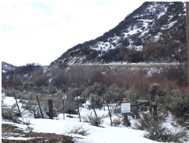
Photo 1: Mine identification sign at the secondary site entrance off the County Road.

Number of Partial Inspection this Fiscal Year: 7