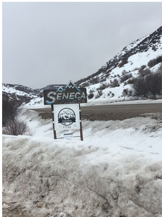
Photo 1: Mine identification sign at the main site entrance off the County Road.