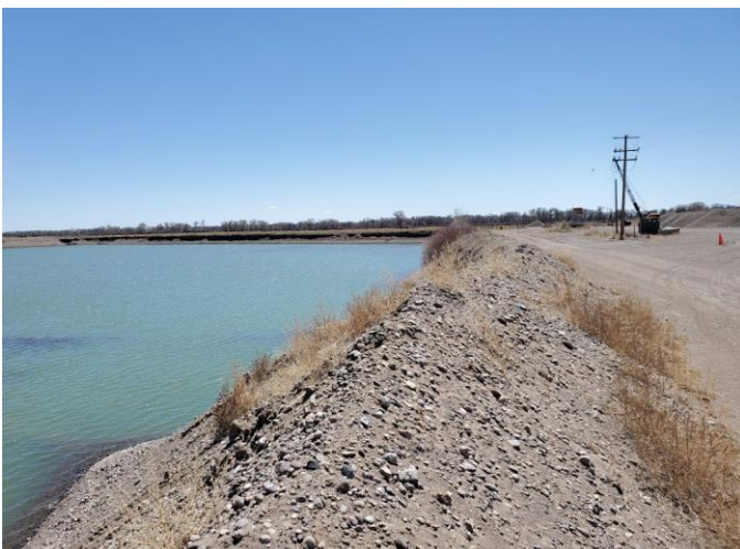
View to the south showing berm along the edge of the pit