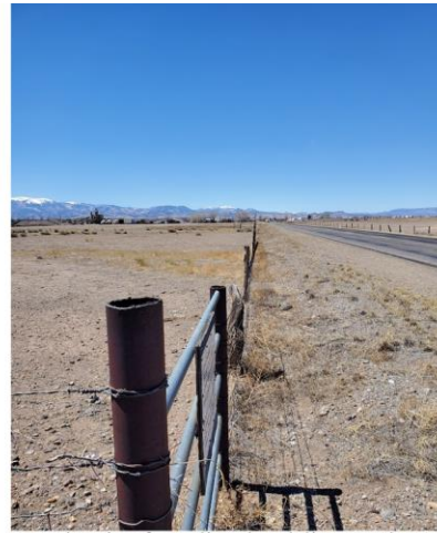
View to the west showing fence line that delineates the northern permit boundary