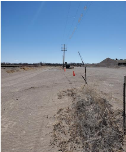
View to the south showing fence line that delineates the western permit boundary with access to neighboring permit