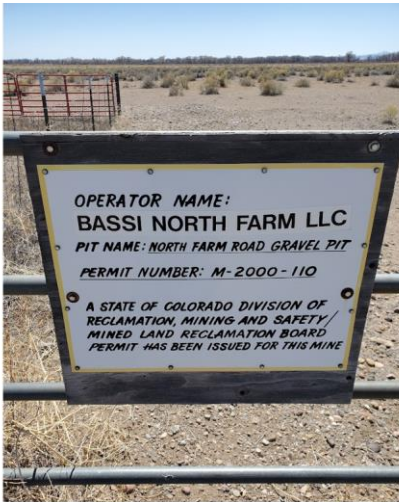
View to the south showing proper Mine ID signage at the entrance to the site