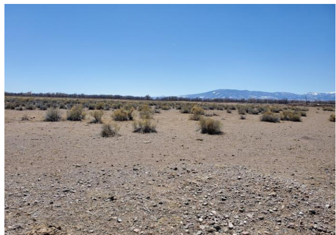
View to the southeast showing Cell #3, an undisturbed cell in the permit boundary