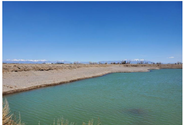
View to the northeast showing the platform in the pit where equipment extracts material.