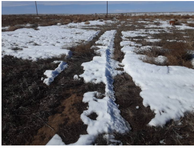
Signs of vehicle(s) accessing property through western gate. Gate not locked (photo 5).