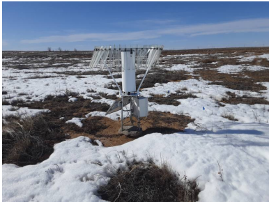
Weather station appears in operational condition (photo 7).