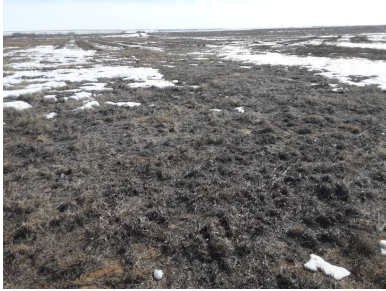
Area mowed in summer 2022. Continue to monitor and mow summer 2023 (photo 6).