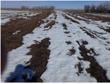
No disturbance noted on old haul road from main entrance gate (photo 10).