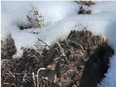
Perennial shrubs establishing in revegetated areas. Continue to monitor and avoid disturbing areas if possible (photo 8).