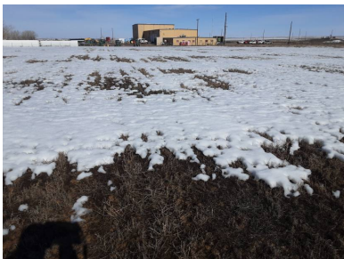
Minimal desirable vegetation establishment in area. Continue to monitor and mow and overseed if necessary (photo 9).