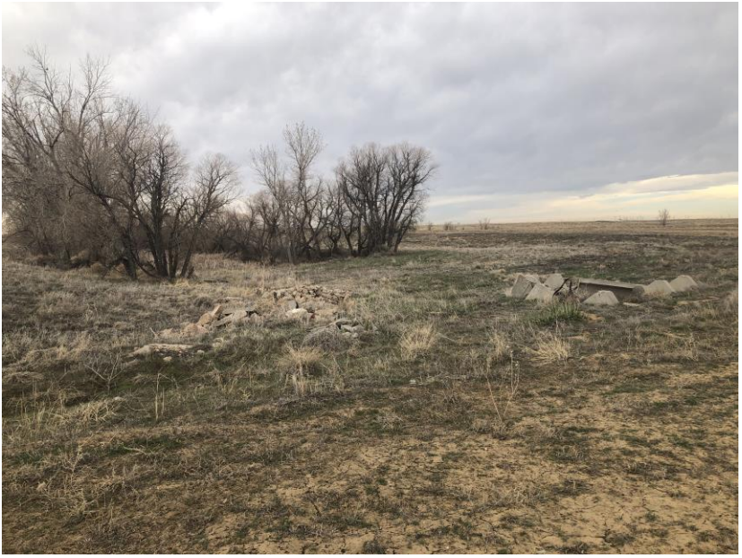
Spillway of Dugout Pond