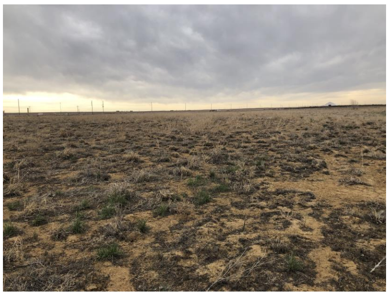
Area 34 (southeast corner of site)