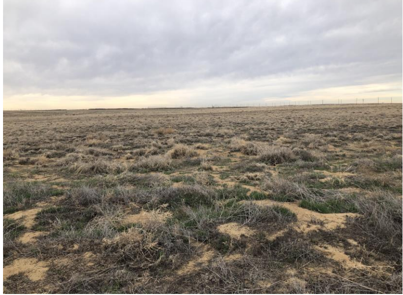
Area 32, looking south towards southwest corner of site