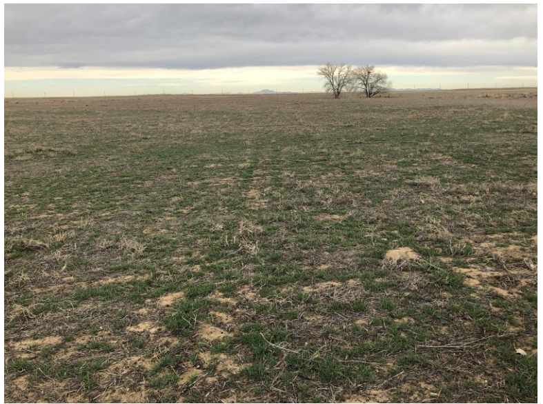
Emerging grass in Area 42