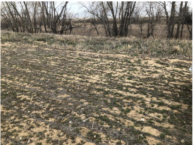
Emerging grass on reclaimed road by Sediment Pond 2 (part of Area 42)

Number of <u>Partial</u> Inspection this Fiscal Year: 6 Number of <u>Complete</u> Inspections this Fiscal Year: 3