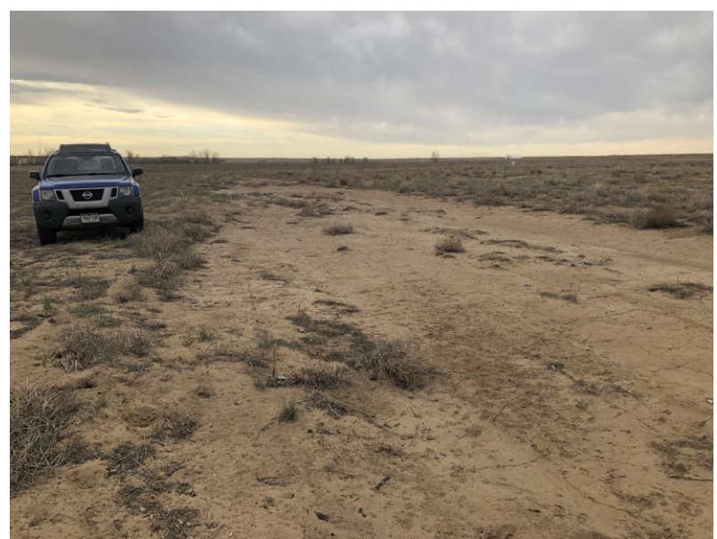
Large bare spot in Area 37