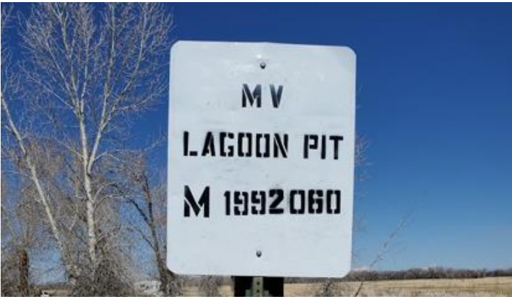
Photo One: View northeast, showing proper Mine ID signage posted at the entrance to the site.