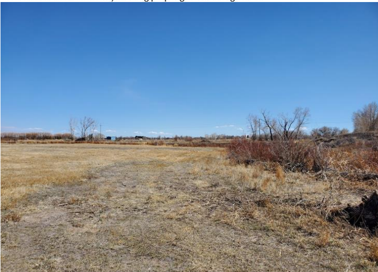
Photo Three: View to the south, showing proper grade and vegetation