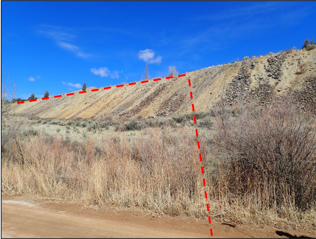
Photo 6. New permit boundary between Chapman and CC&V properties (Left: 4.3 acre area; Right: Carlton Tunnel permit area) determined from surveyed lath markers and fence lines; looking north.