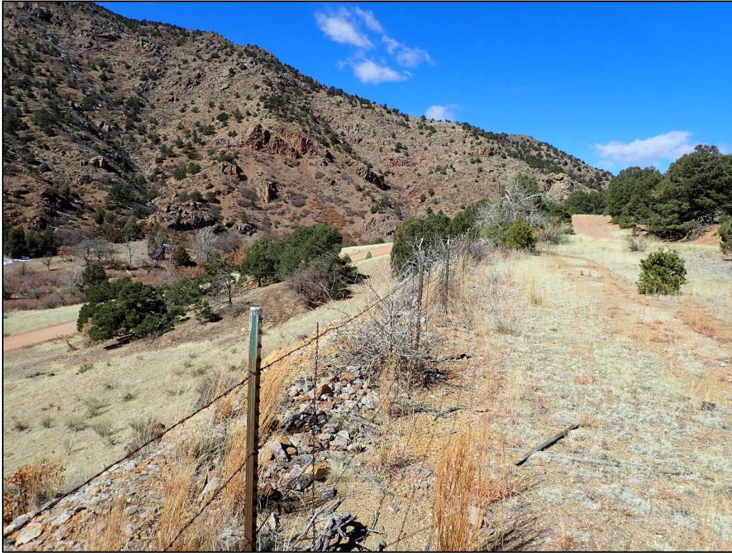
Photo 4. Crest of the historic development rock pile, fence will now be the permit boundary; looking northwest.