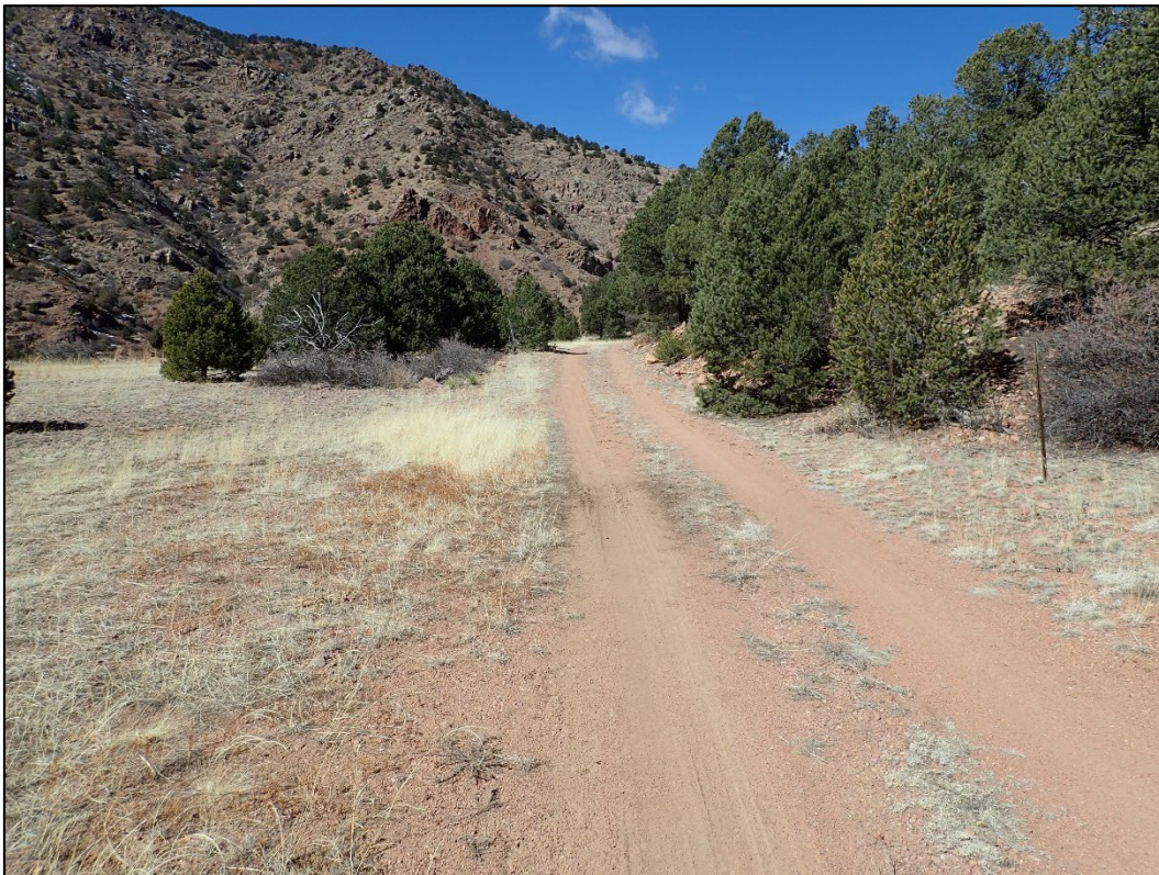
Photo 1. Access road from CR88 into the Carlton Tunnel permit area; looking northwest.