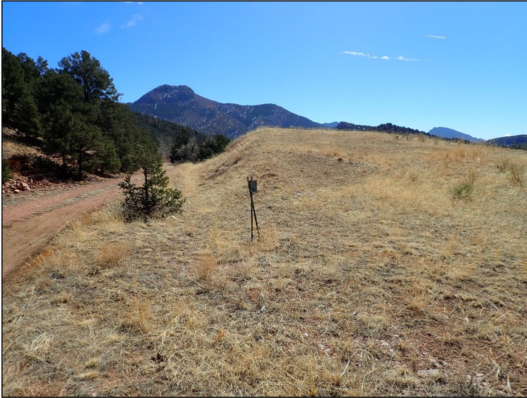
Photo 2. Access road from CR88 into the Carlton Tunnel permit area and the growth medium stockpile; looking southeast.