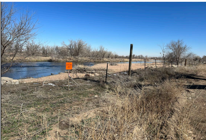
Photo 5 – Affected area sign placed on existing fencing near northwest area of site.