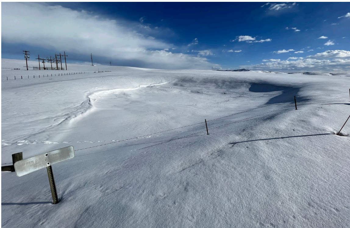
Photo 8: Truck Loop Pond 001 located in the previously released Tracks-to-Trails area. A faded mine identification sign is present.

Number of Partial Inspection this Fiscal Year: 6