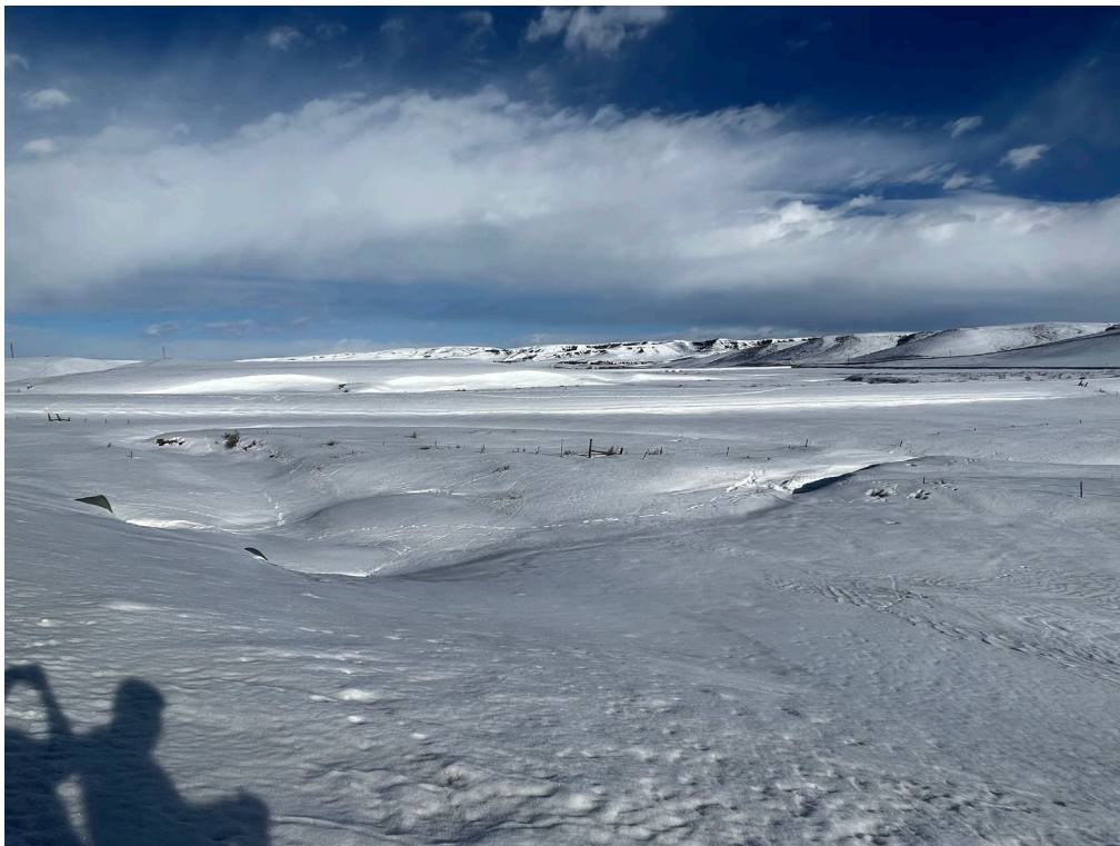
Photo 6: View looking Northwest across Tracks-to-Trails area. Large culverts are located to the west which drain the Rail Loop Pond 002 and Dry Creek which runs through the site.