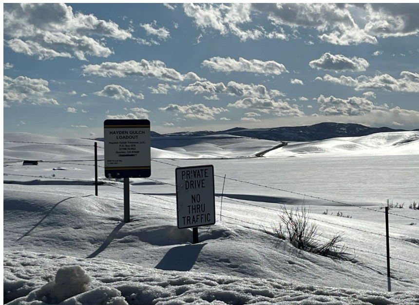
Photo 2: Mine sign located at the end of the unreleased haul road.