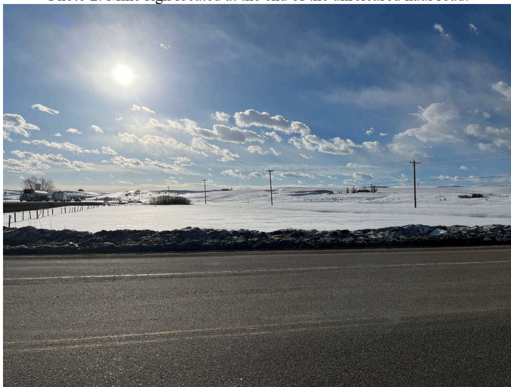
Photo 3: Snow-covered hay fields North of Highway 40, yet to be released.

Number of Partial Inspection this Fiscal Year: 6