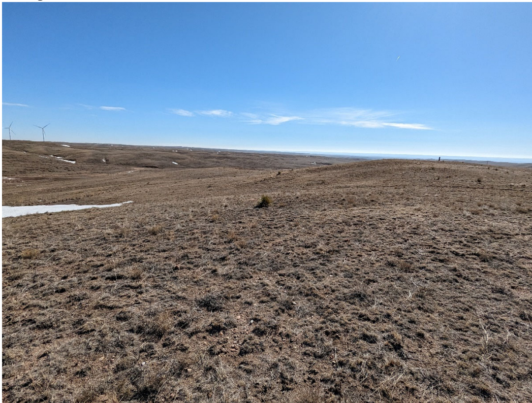
Photo 4. Looking south across the slopes in the permit area. Grasses established throughout the reseeded area.