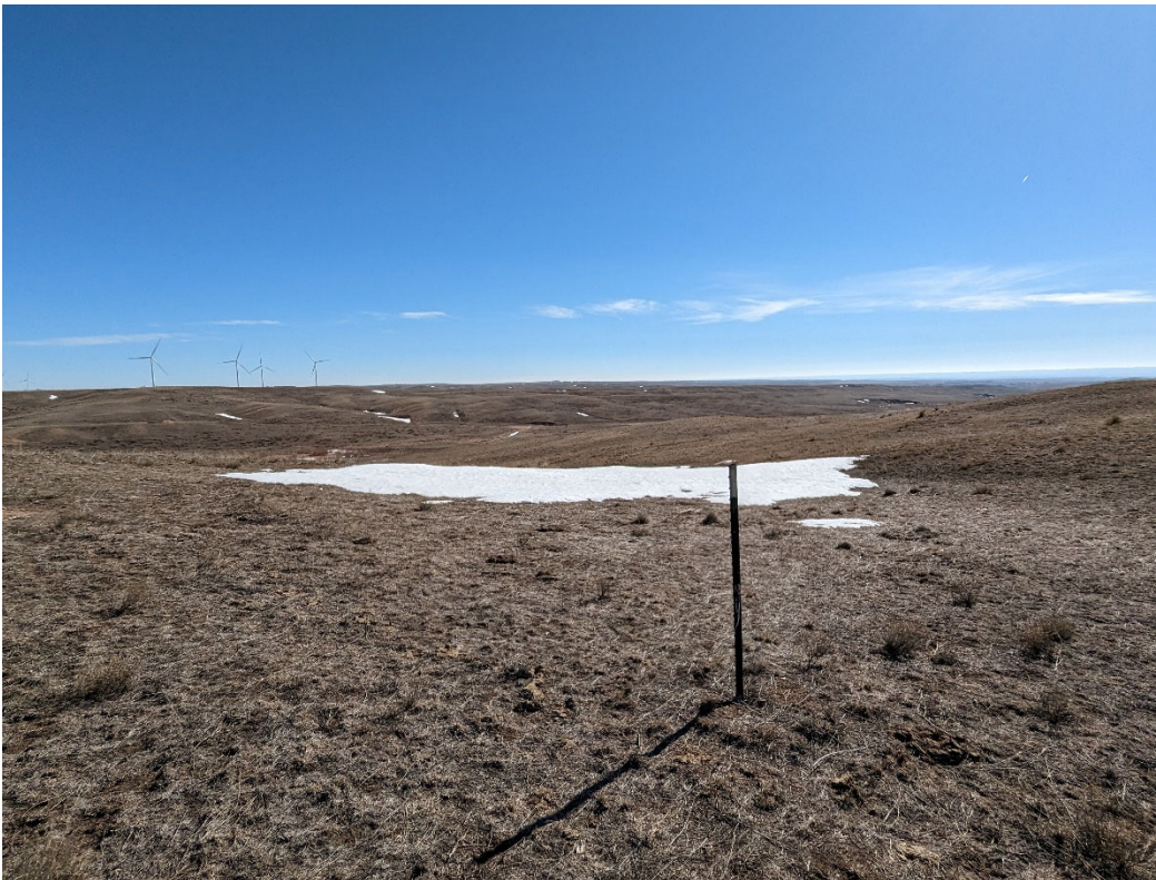
Photo 6. Looking north from the southwest corner of the permit area. This area remains undisturbed.