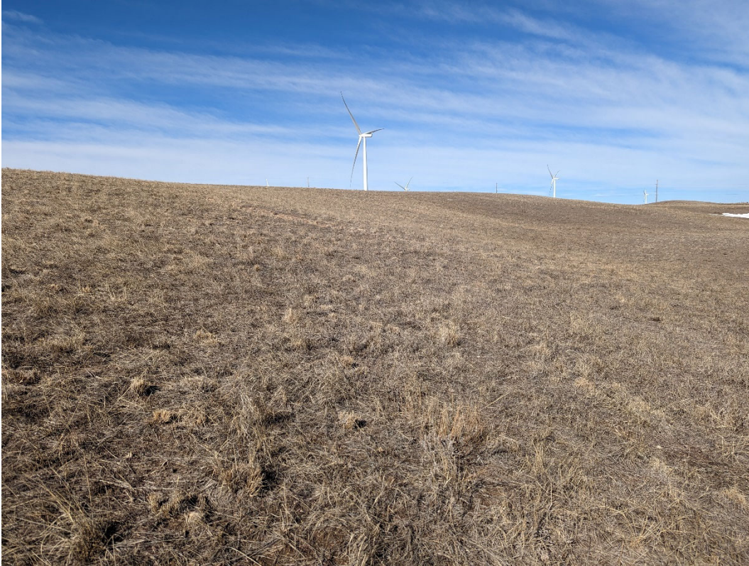
Photo 3. Looking north across the slopes in the permit area. Grasses established throughout the reseeded area.