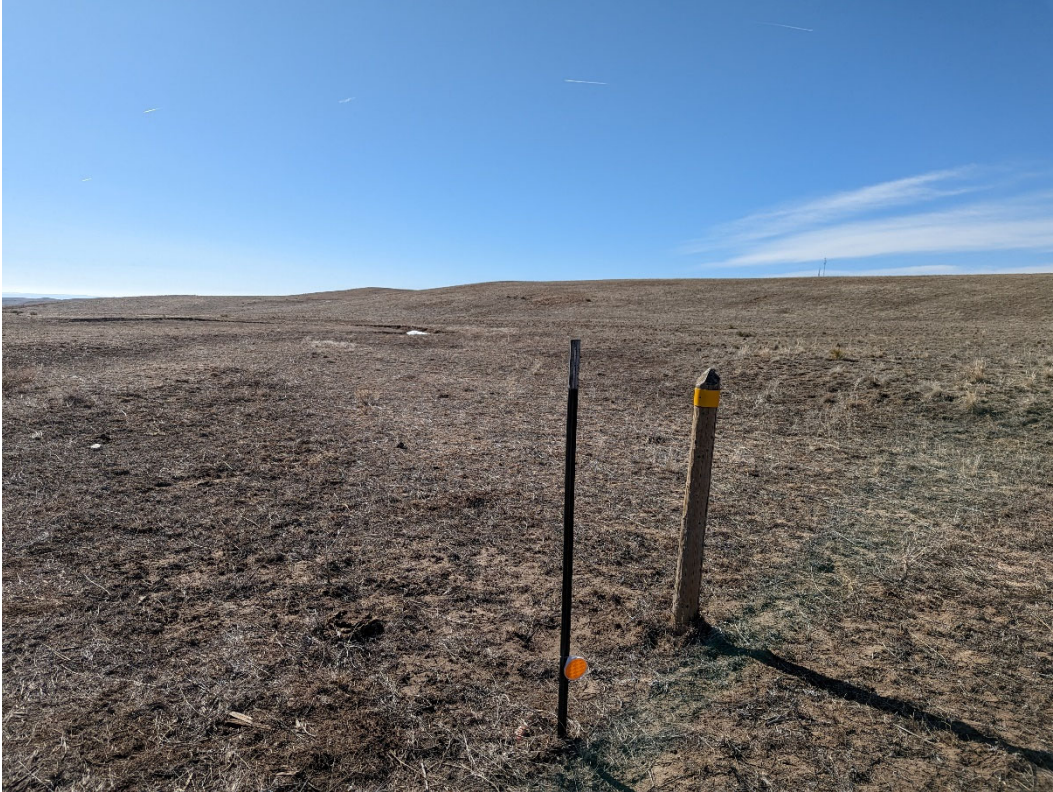
Photo 1. Looking south from boundary marker in the northeast corner of the permit area.