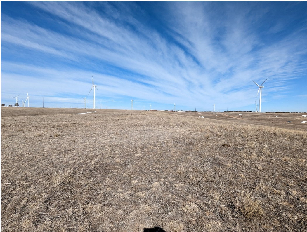
Photo 5. Looking north across the top of the slopes. Grasses are patchy in spots here but continue to fill in across the area of disturbance.