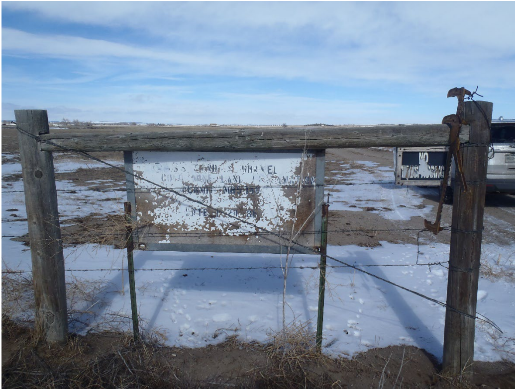
Photo 2. Partially legible Permit sign.