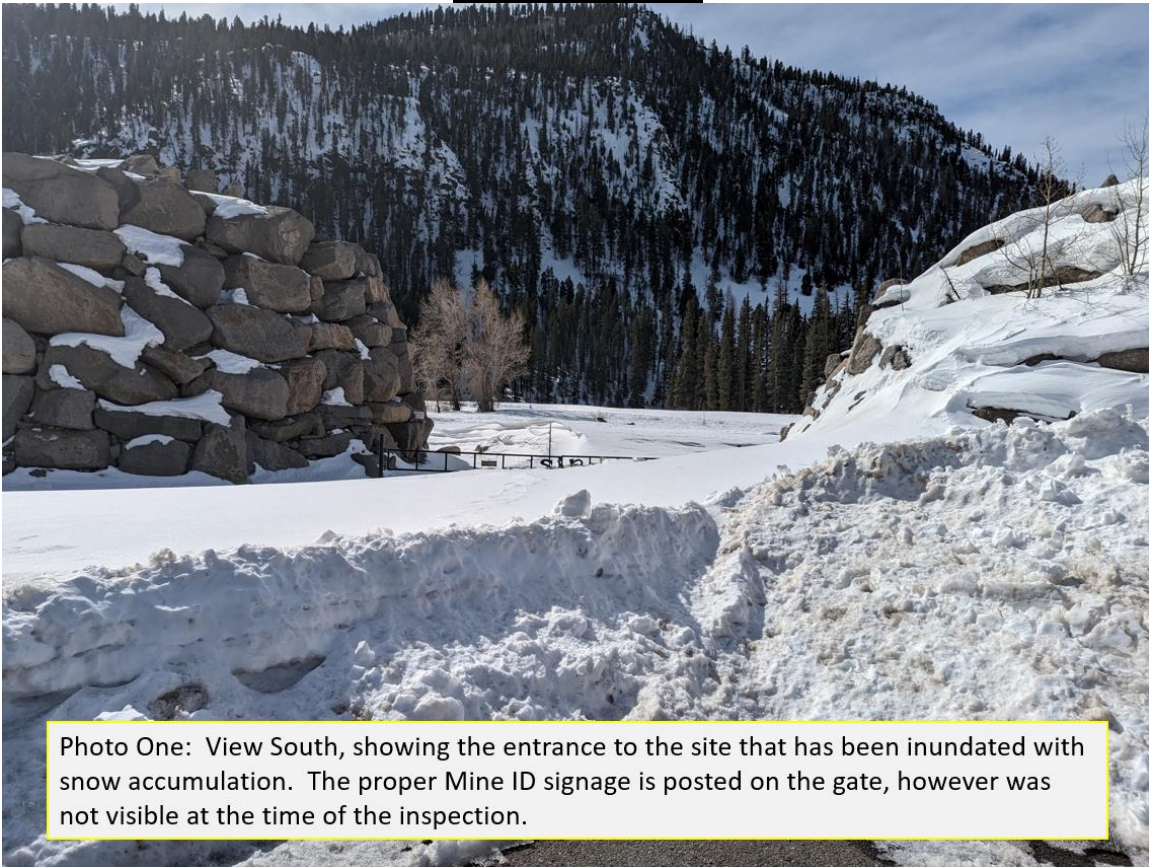
Photo One: View South, showing the entrance to the site that has been inundated with snow accumulation. The proper Mine ID signage is posted on the gate, however was not visible at the time of the inspection.