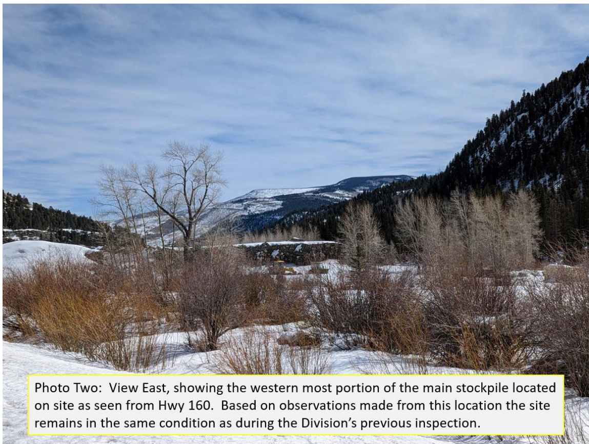
Photo Two: View East, showing the western most portion of the main stockpile located on site as seen from Hwy 160. Based on observations made from this location the site remains in the same condition as during the Division's previous inspection.