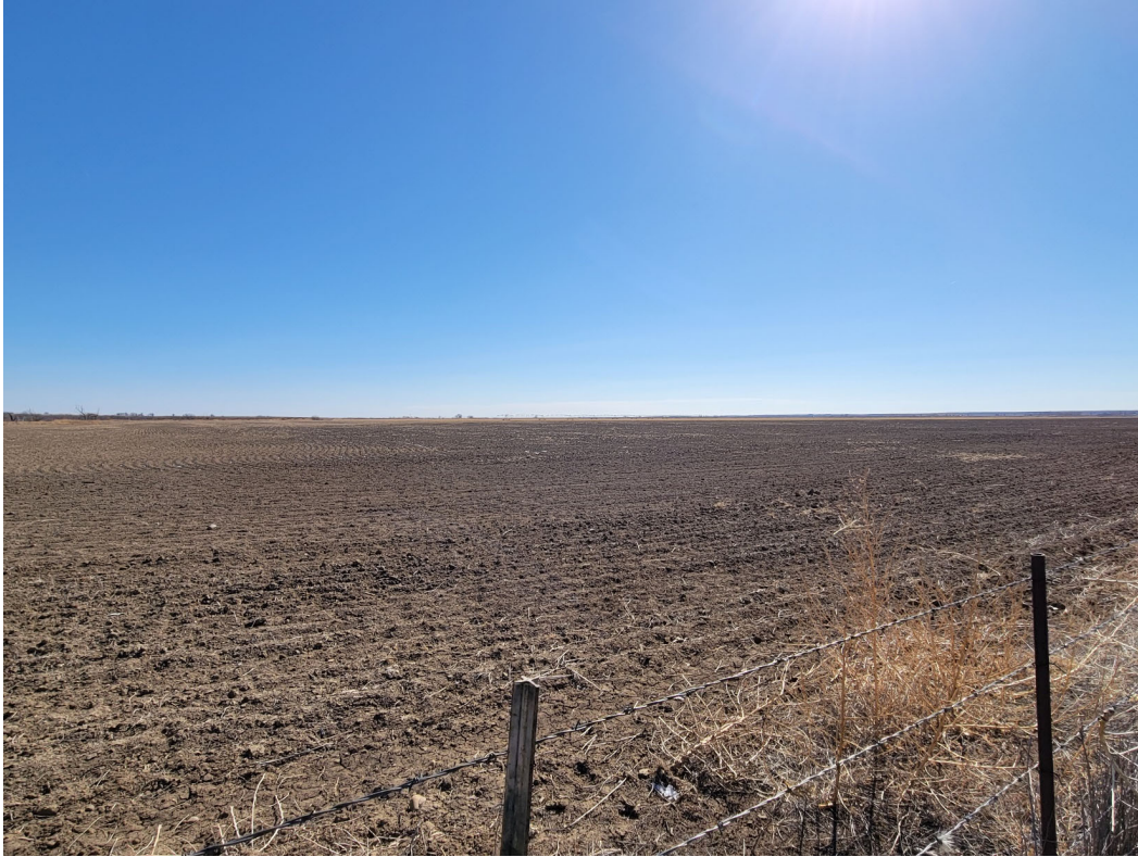
Photo 5. Looking southeast across the proposed mining area.