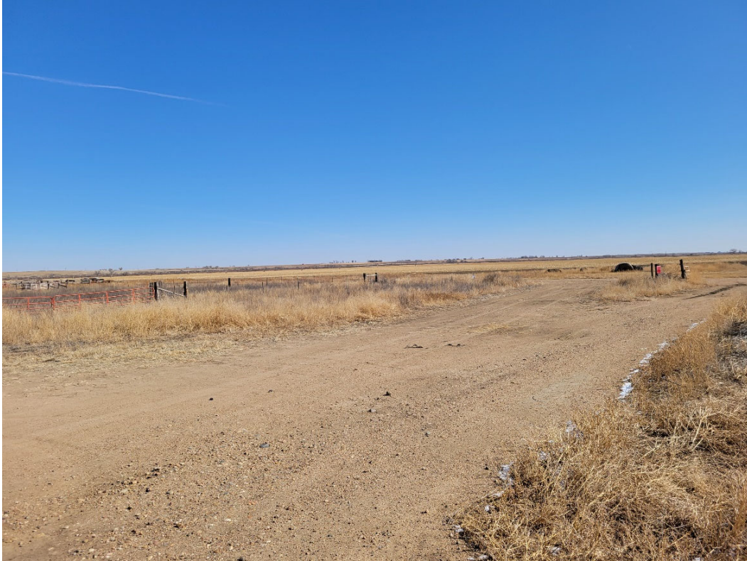
Photo 1. Looking east from gravel entrance to proposed permit area.