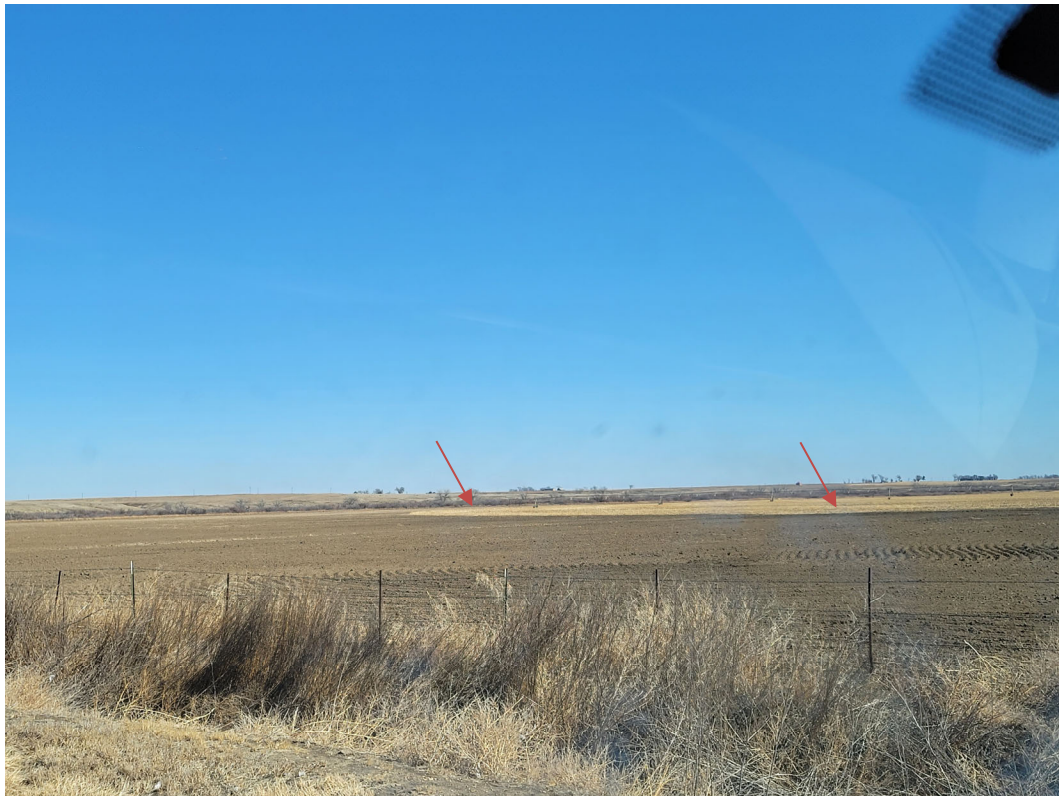
Photo 4. Looking east from the county road. Red arrows point to proposed eastern permit boundary along the edge of the crop circle.