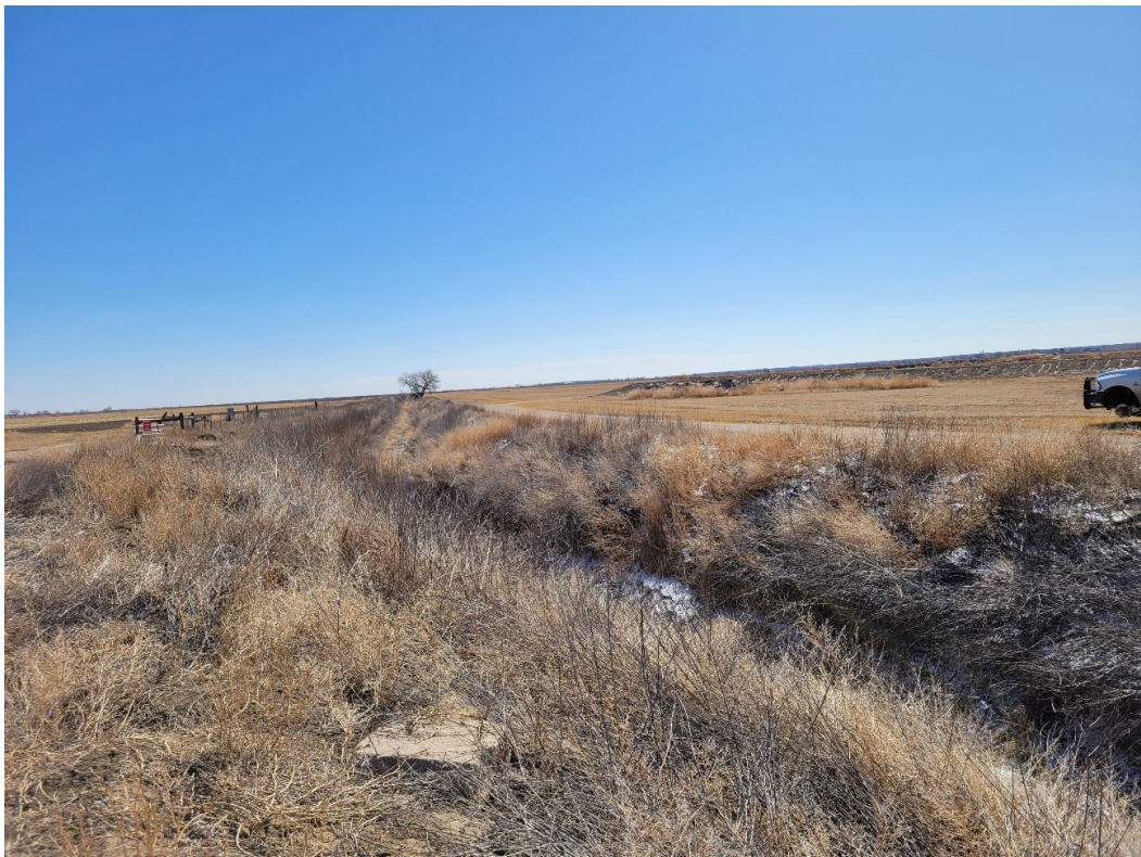
Photo 2. Looking southeast along North Granada Ditch, The ditch is outside the proposed southern permit boundary.