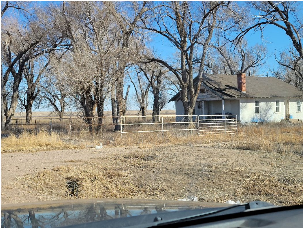
Photo 8. Front of the residence from Highway 385.