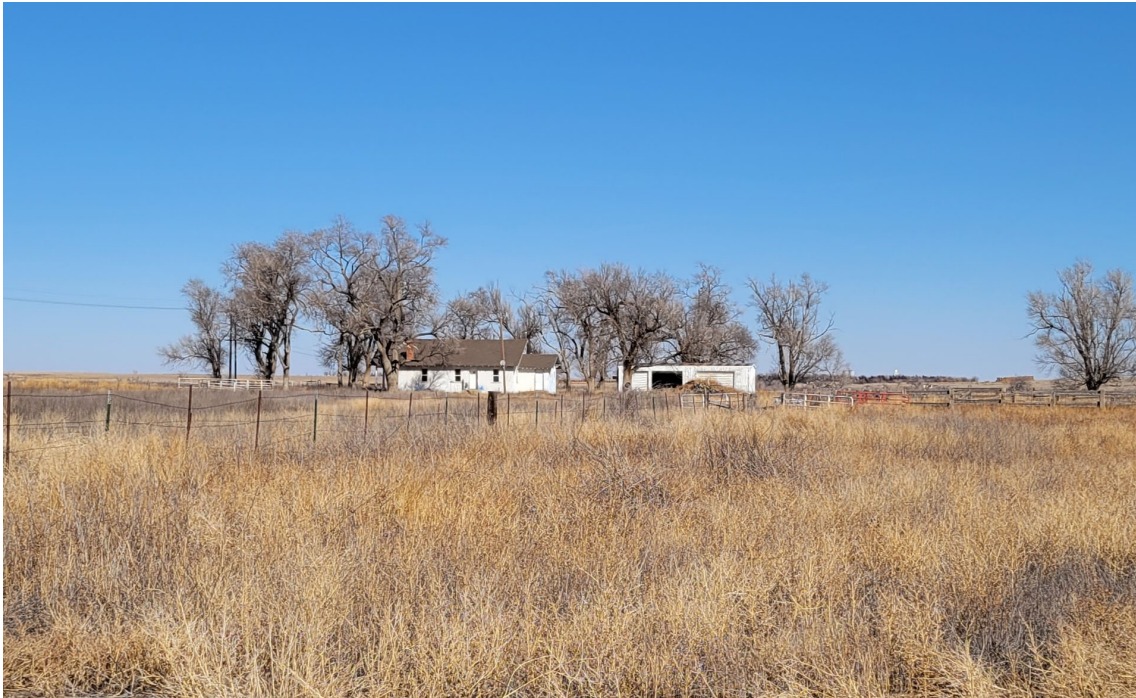
Photo 9. Looking north from the entrance to the site, uninhabited residence, barn and corral.