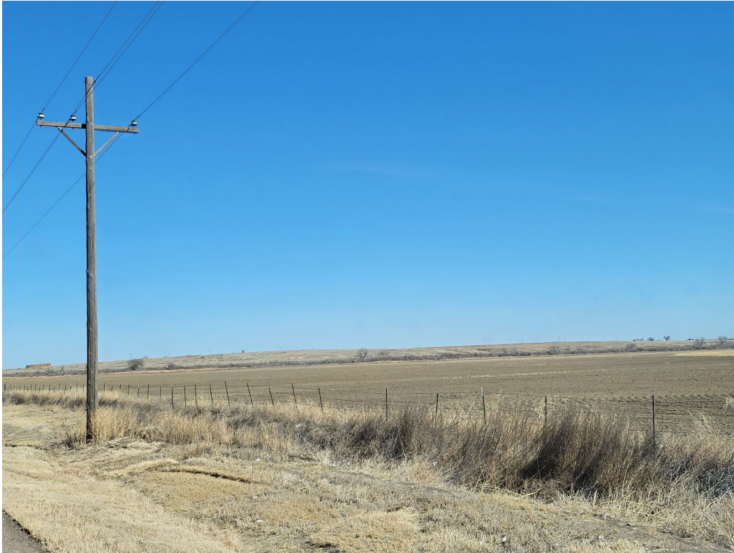
Photo 7. Looking northeast from Highway 385 across the proposed mining area. A barbed wire fence runs along the western boundary. Overhead telephone lines run the length of the parcel along the road.