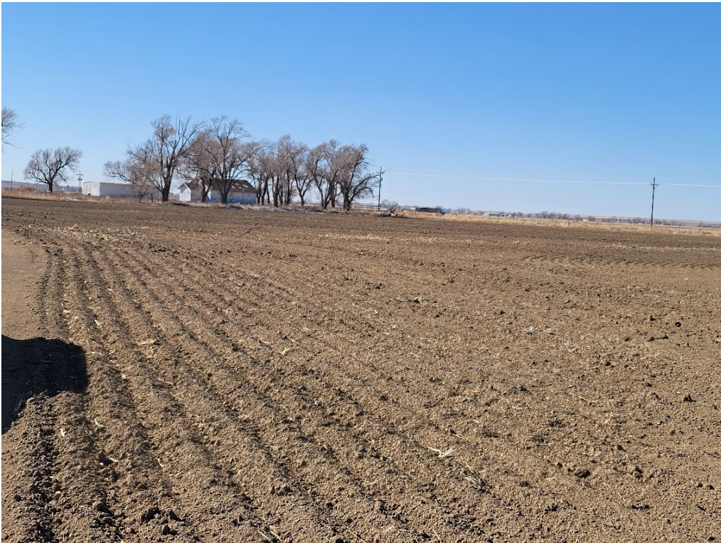
Photo 6. Looking south across proposed disturbance area. Processing area is proposed in the field north of the residence.