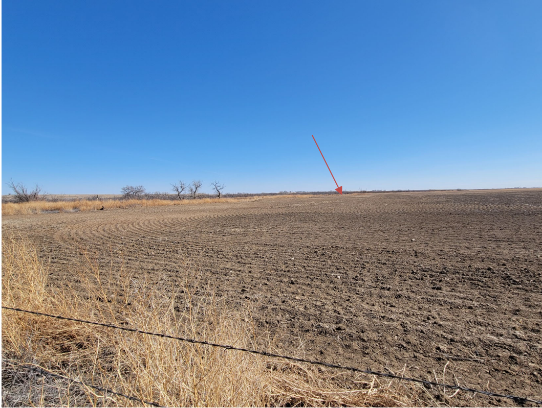
Photo 3. Looking southeast. Arrow points to approximate location of proposed 10 acre pond.