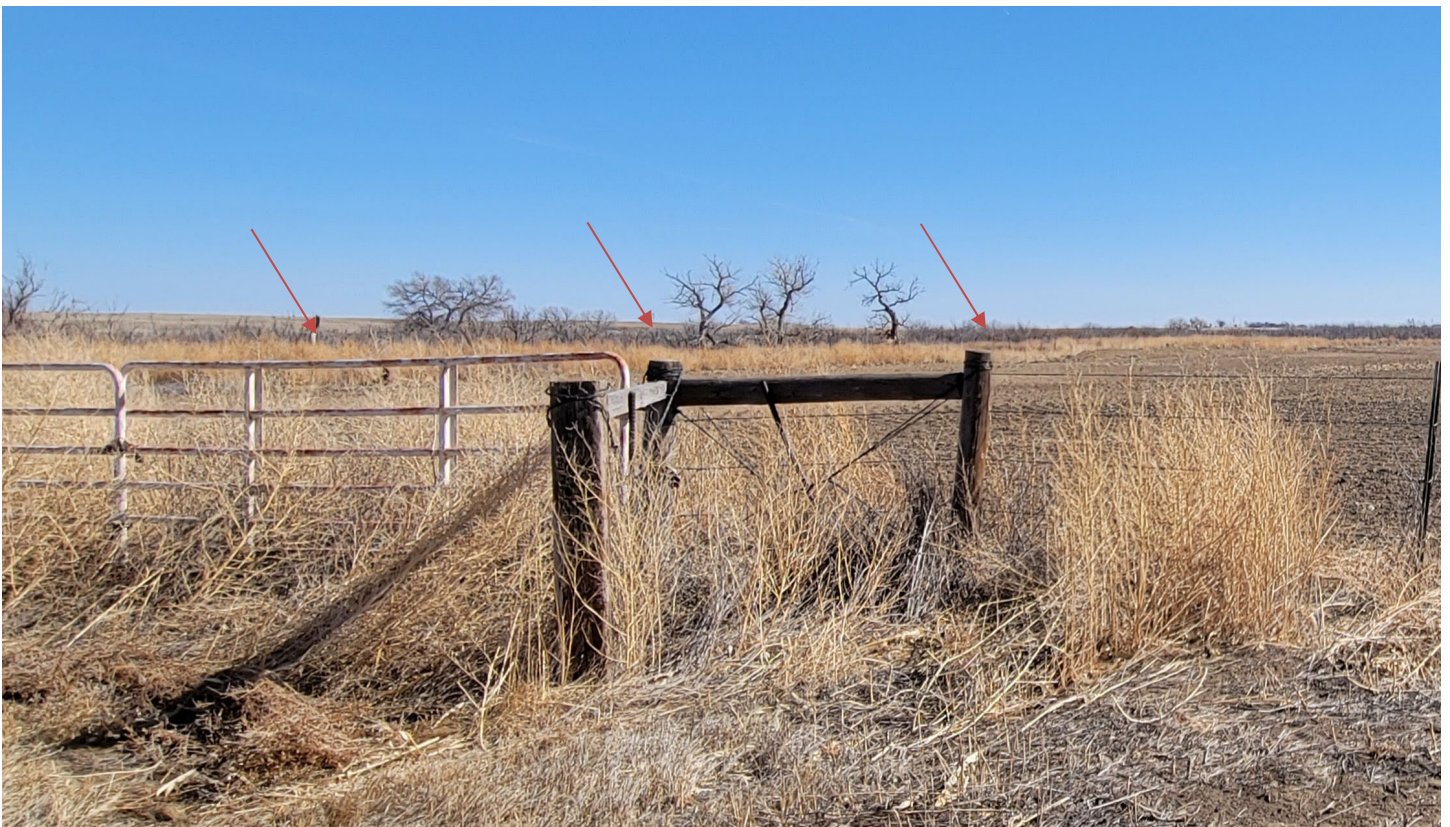
Photo 10. Northwest corner of proposed permit area. Arrows point to untilled riparian area in the floodplain of the Arkansas River, outside the proposed permit boundary.