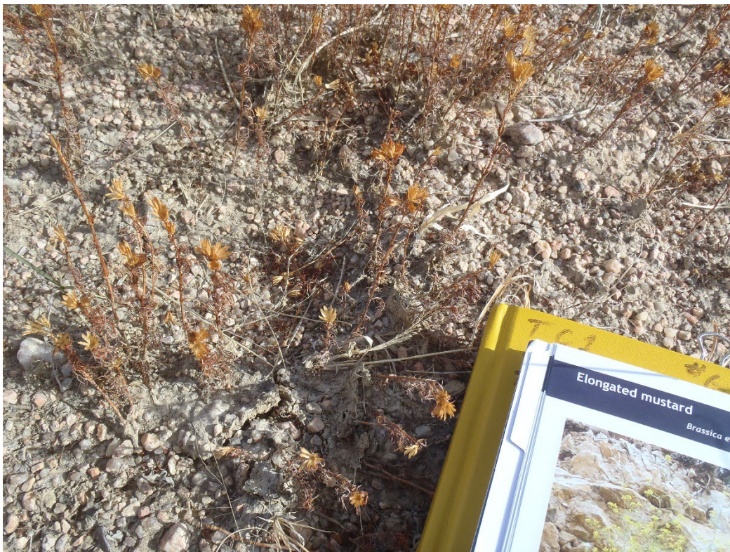
Photo 3. Treated plant – NOT elongated mustard ( Brassica elongata ) – March Inspection photo.