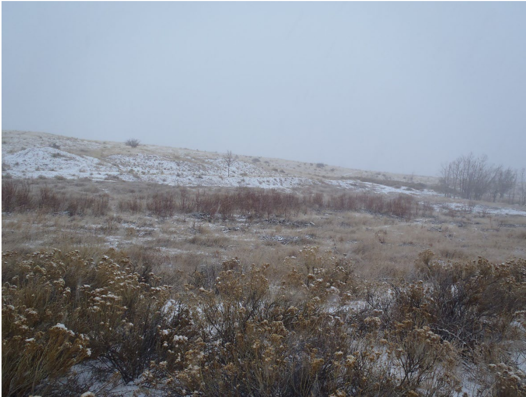
Photo 2. Treated salt cedar (tamarisk) near third sediment pond (looking east).