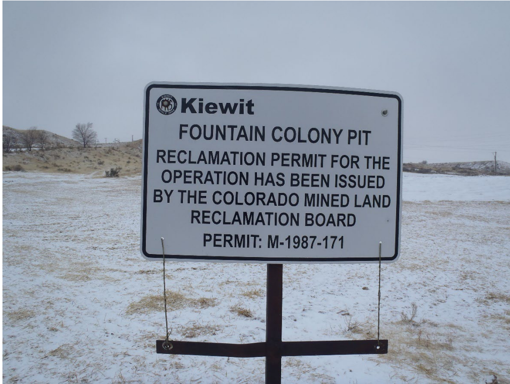
Photo 4. Permit sign at entrance off Charter Oak Ranch Rd.