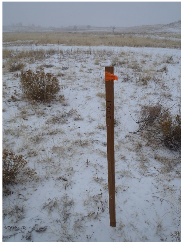
Photo 5. Typical survey stake delineating the boundary between the release area and Phase V.