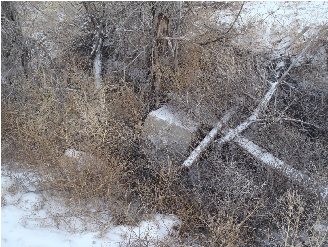
Photo 1. Concrete/mafia blocks needing to be removed (east side of drainage on west access road).