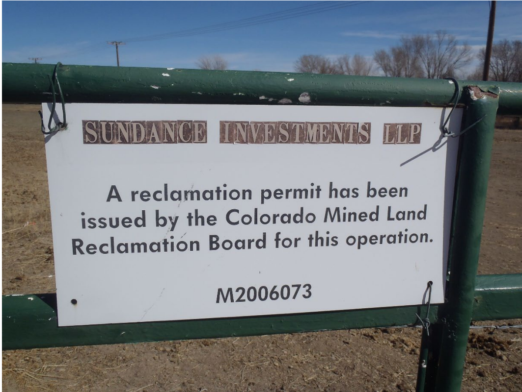
Photo 1. Permit sign posted on gate off Old Pueblo Rd.