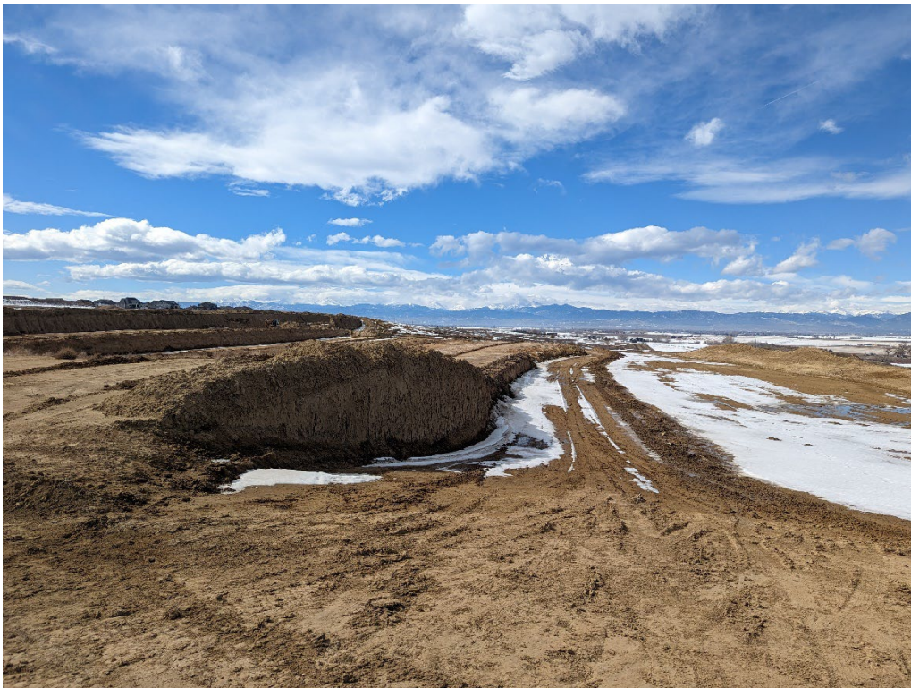
View of the north highwall from the east end looking west