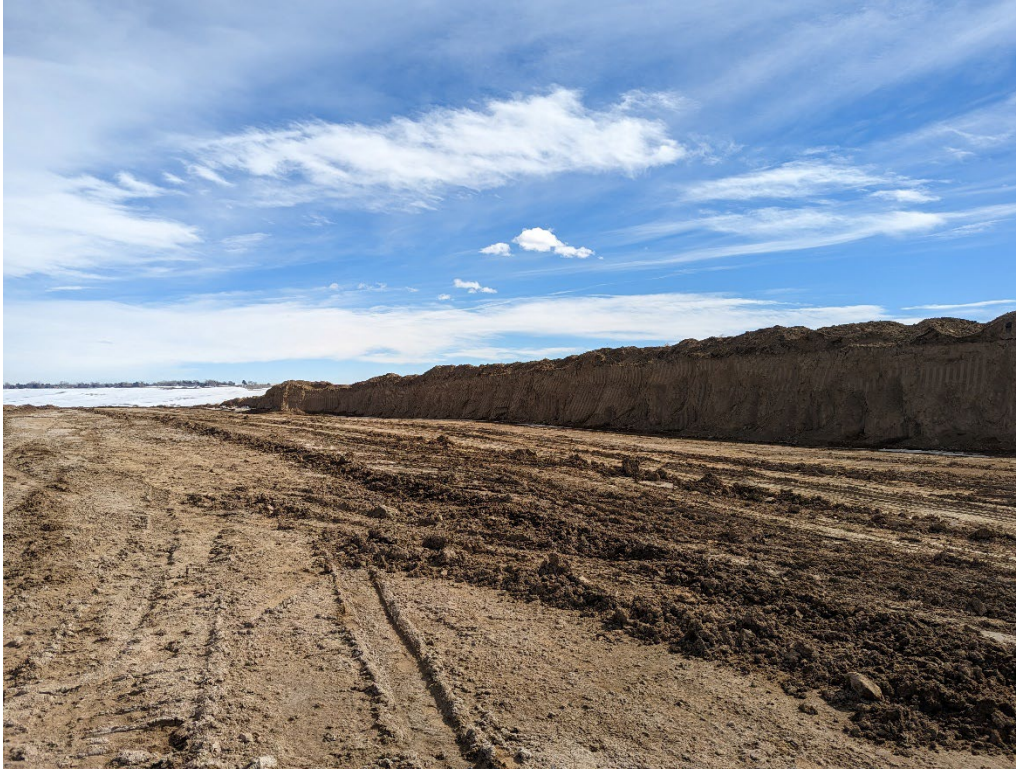
View of the south highwall from the excavation area looking southeast