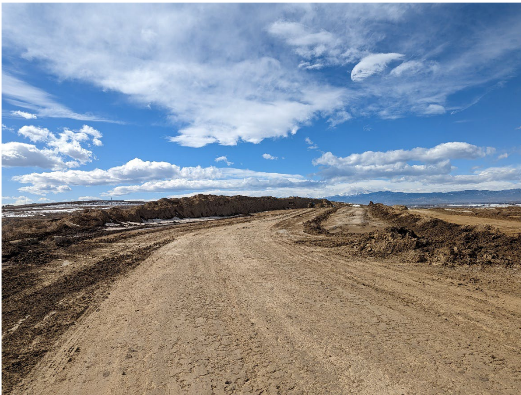
View of the south highwall from the east end looking west