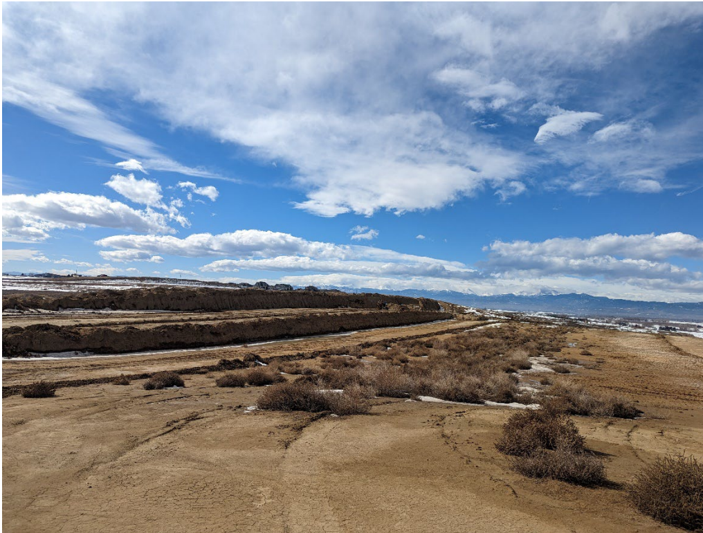
View of the south and middle highwalls from the east end looking southwest