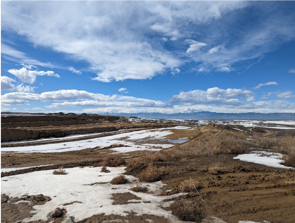
View of the site from the northeast corner looking southwest