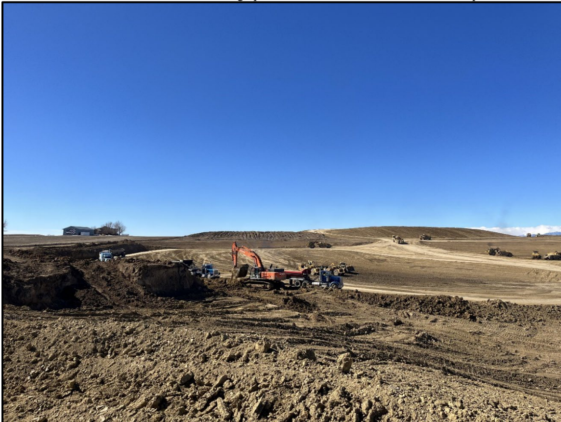
Photo 4: View Southeast of mining operation. Site was active at the time of inspection.