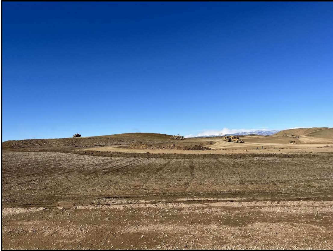
Photo 3: View to the West of mining operation. Site was active at the time of inspection.