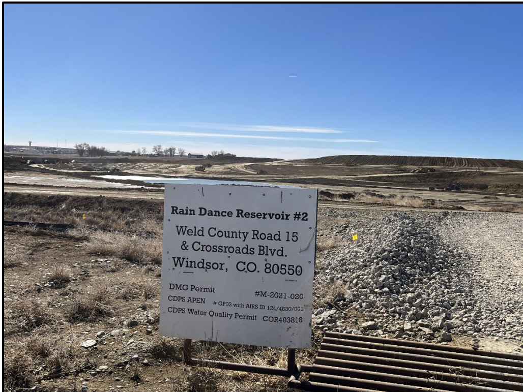
Photo 2: Appropriate signage located at the mine entrance to the North on E. Crossroads Boulevard.