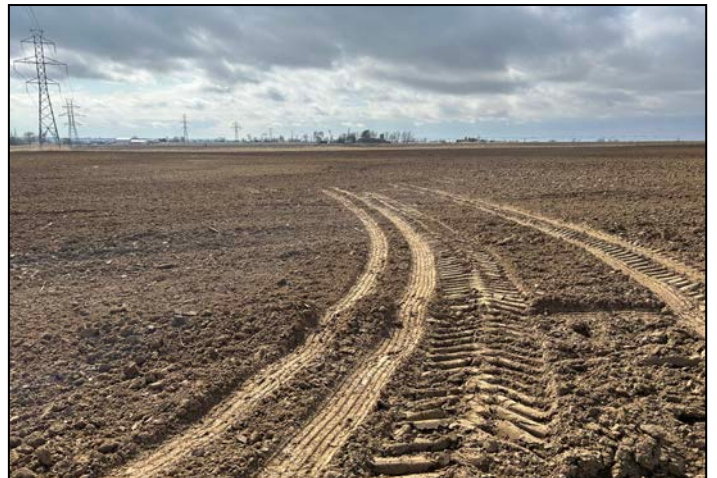
Photo 4 – Looking SE from north side of disturbed area. Area ready for spring planting.