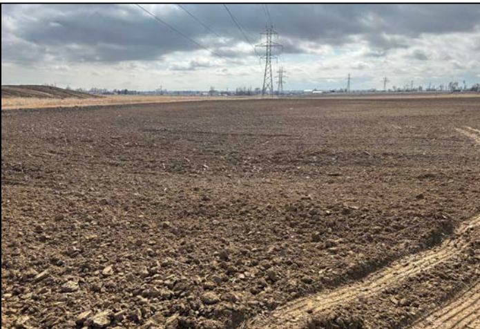
Photo 5 – Looking ESE from north side of disturbed area. Area ready for spring planting. Soil stockpile visible in top left of photo.