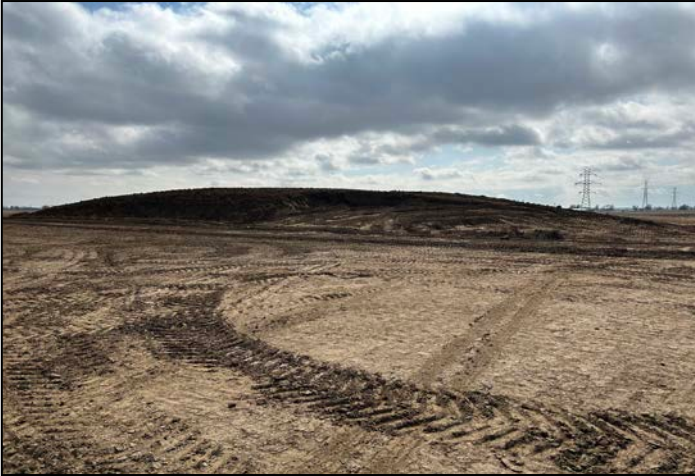
Photo 1 – Looking SE from site entrance at remaining stockpile of soil - approximately 5000 cy