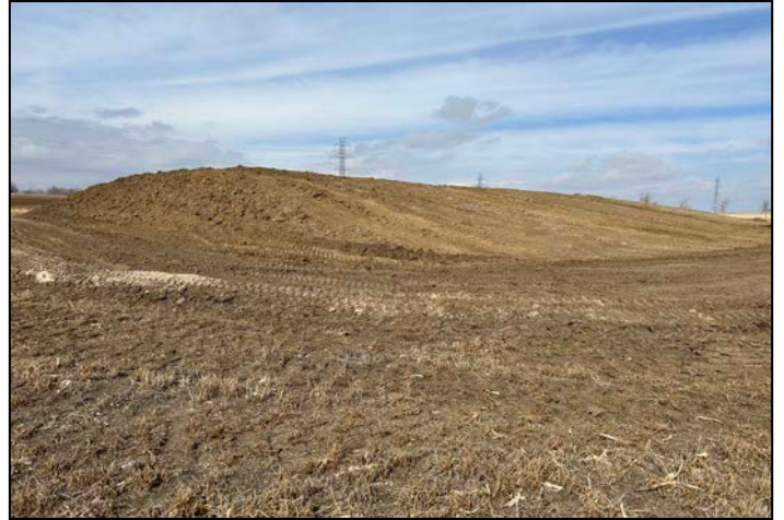
Photo 2 – Looking NW from site entrance at remaining stockpile of soil - approximately 5000 cy