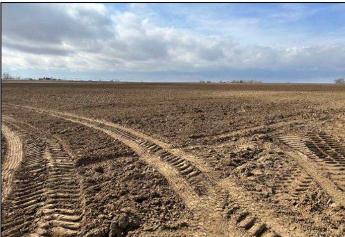
Photo 3 – Looking SW from north side of disturbed area. Area ready for spring planting.