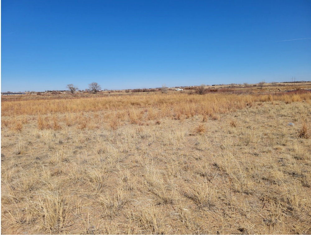
Photo 1. View looking east from parking lot. Grasses established in this area.