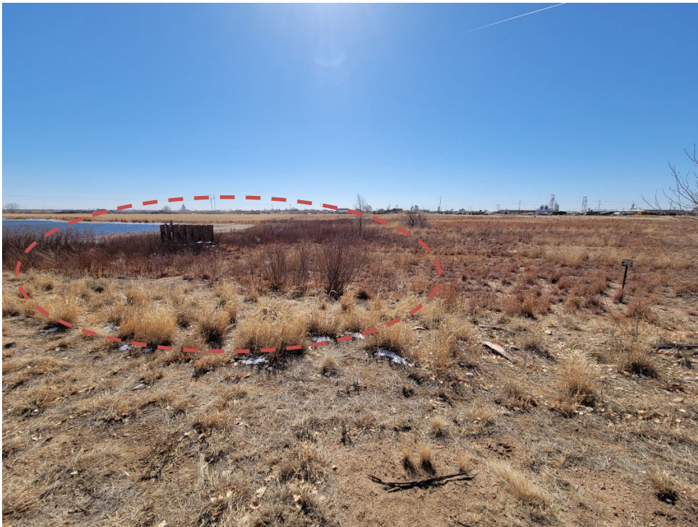
Photo 2. View looking southeast across area of Tamarisk abatement (indicated) on the west end of the middle pond.