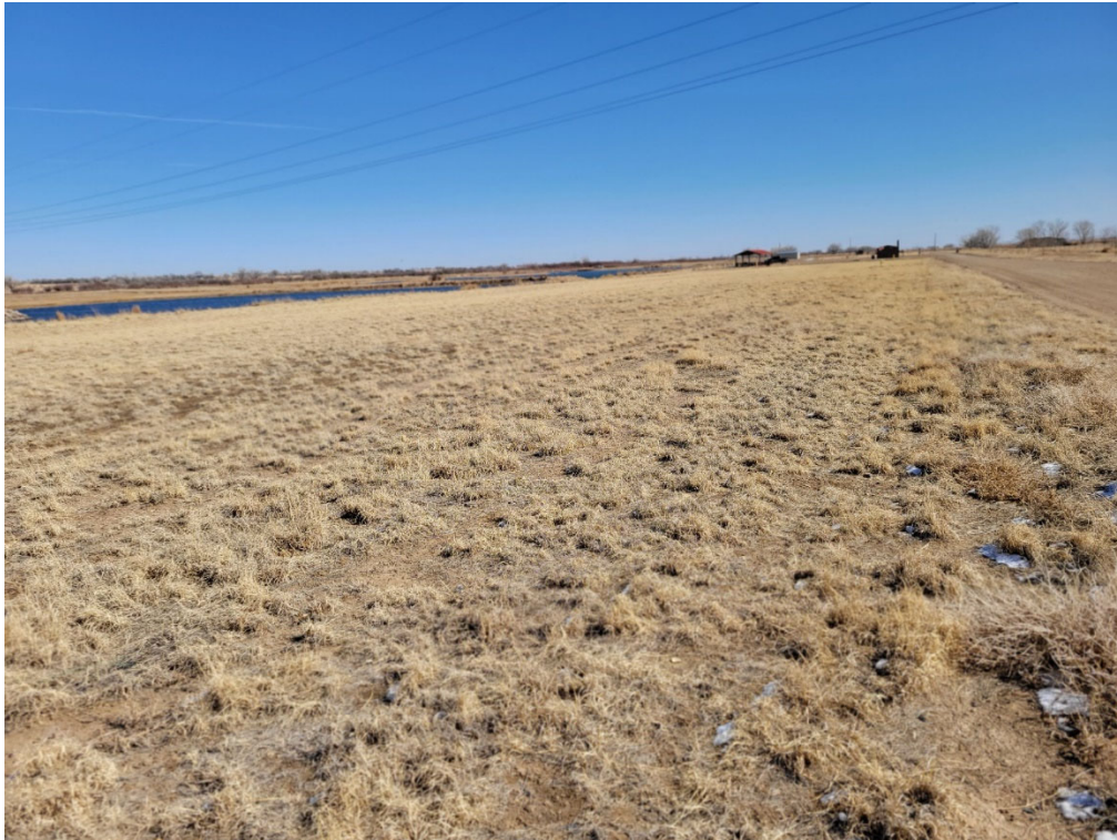
Photo 7. View looking east across area located south of middle and eastern pond, showing good vegetative cover in this area.