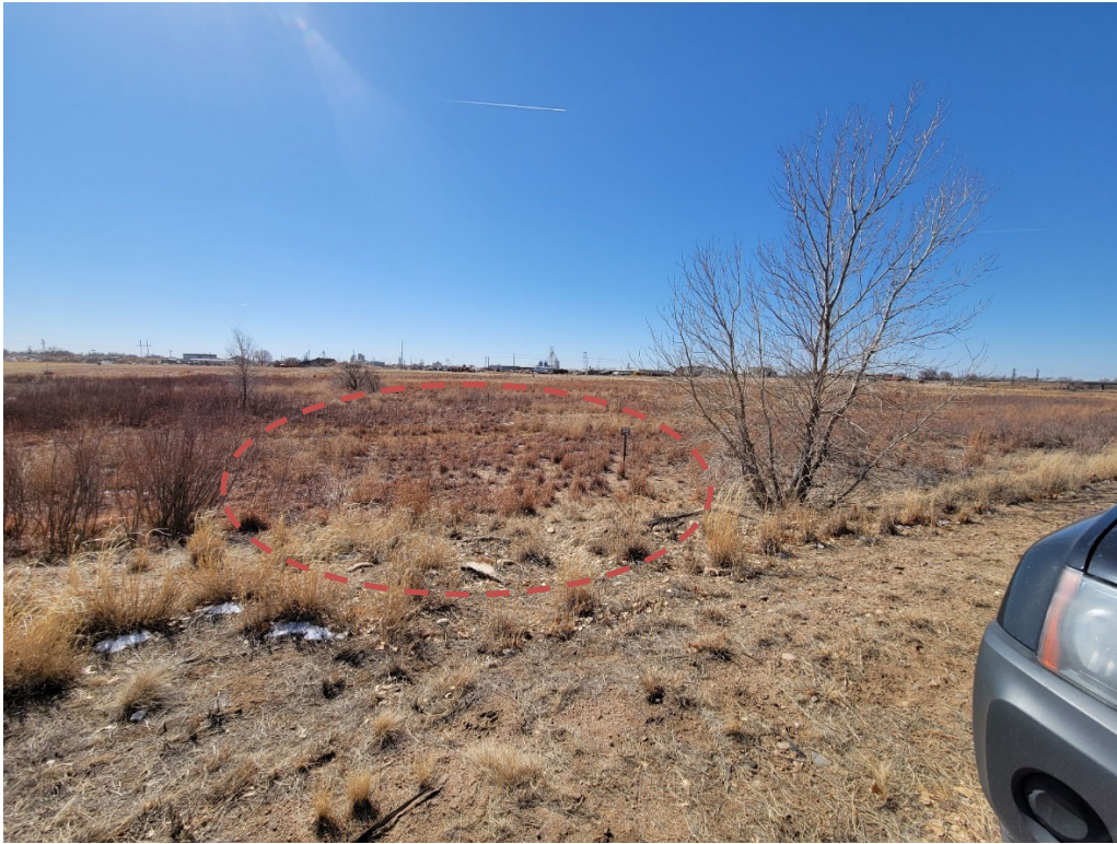
Photo 3. View looking southwest across area of Tamarisk abatement along the road.