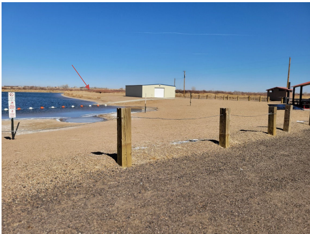
Photo 8. View looking east across area located southeast of easternmost pond, picnic/shade structure, restroom facility, and storage building installed in this area for park use. Area used for kayak and paddleboard storage noted by arrow.