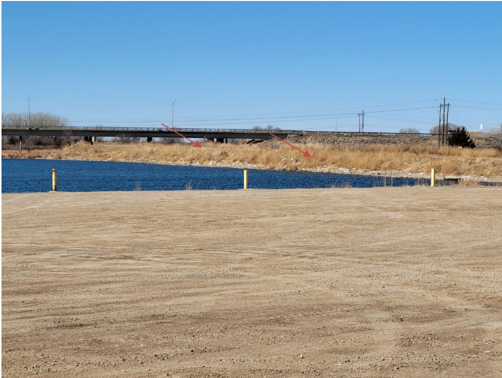
Photo 9. View looking northwest across parking area located in between western and middle ponds. Good vegetative cover established along the banks.