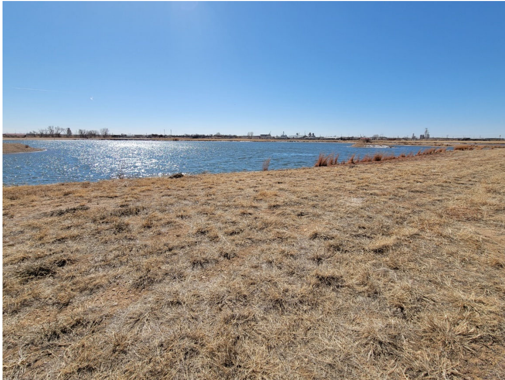
Photo 5. View looking southwest across area located north of middle pond, showing good vegetative cover.