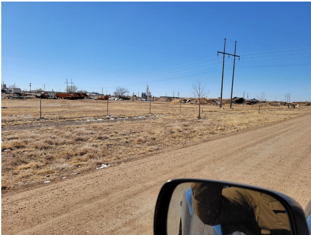
Photo 10. Looking down the southern boundary of permit area. Trees planted along the road and grass is well established.