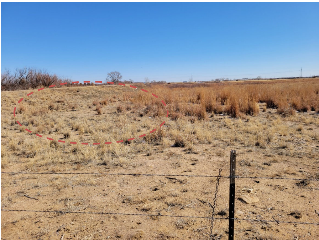
Photo 4. View from the edge of the parking area, looking south across western portion of the backfilled pond. Area of Tamarisk abatement last fall (indicated).