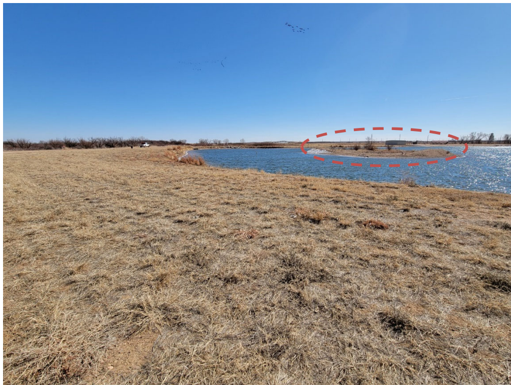
Photo 6. View looking south across area located north of easternmost pond, showing good grass cover in this area. One of two islands present in easternmost pond (indicated).