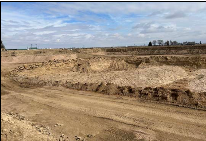
Photo 3 – Recently excavated area in Phase 6 above GW level looking NE from west side of excavation.