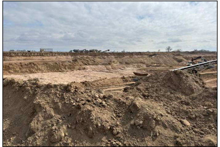
Photo 2 – Recently excavated area in Phase 6 above GW level looking SE from west side of excavation.