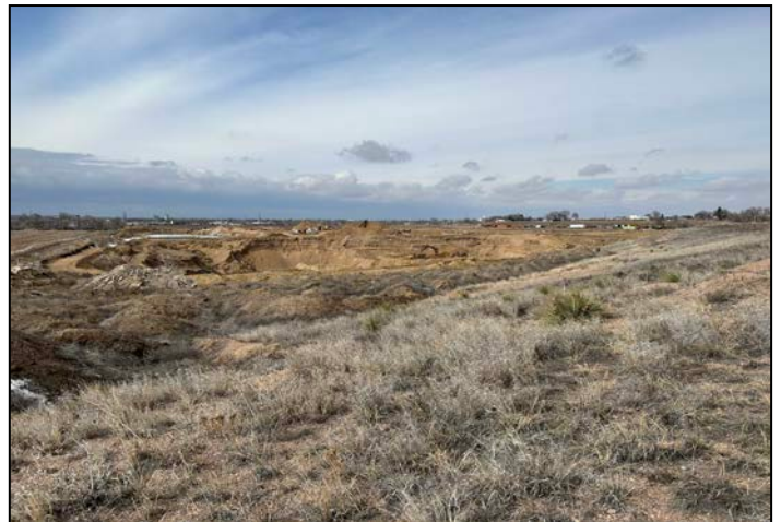
Photo 4 – Looking west into Phases 1 and 2 in slurry wall lined area from east permit boundary.