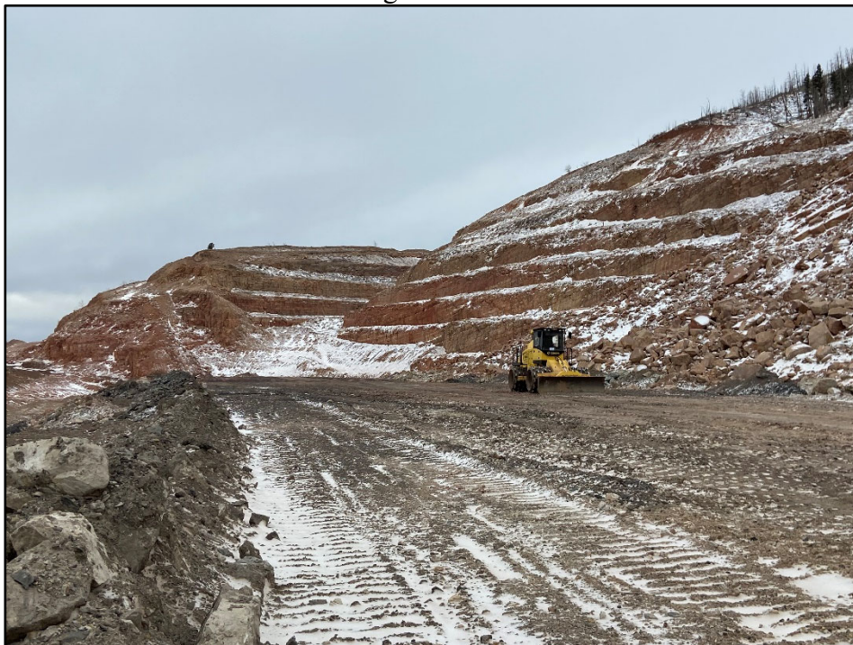
Photo 2 – Fill material is being actively placed in main backfill area.