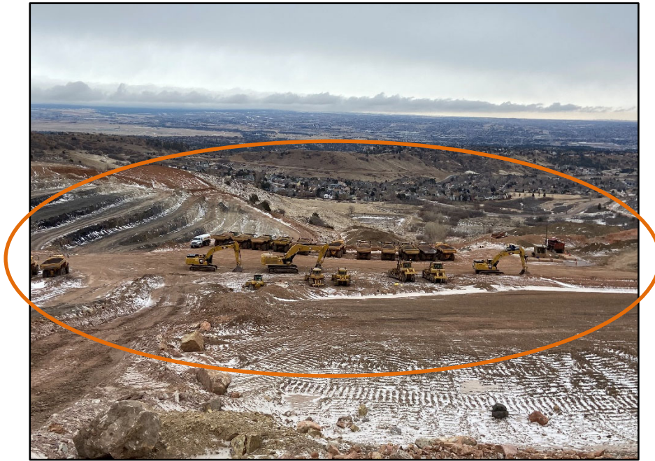
Photo 3 – Staging area for contractor’s equipment. They were not working today due to a safety stand-down.