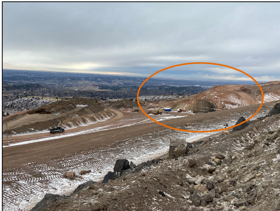
Photo 4 – Fill material being actively removed from USFS South Borrow Area.