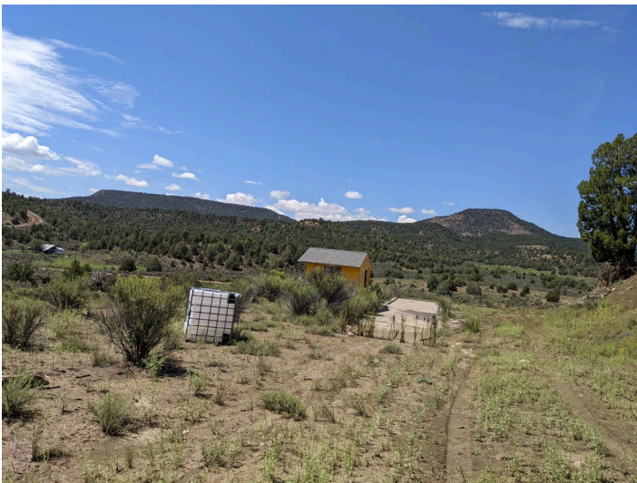
Scale and scalehouse