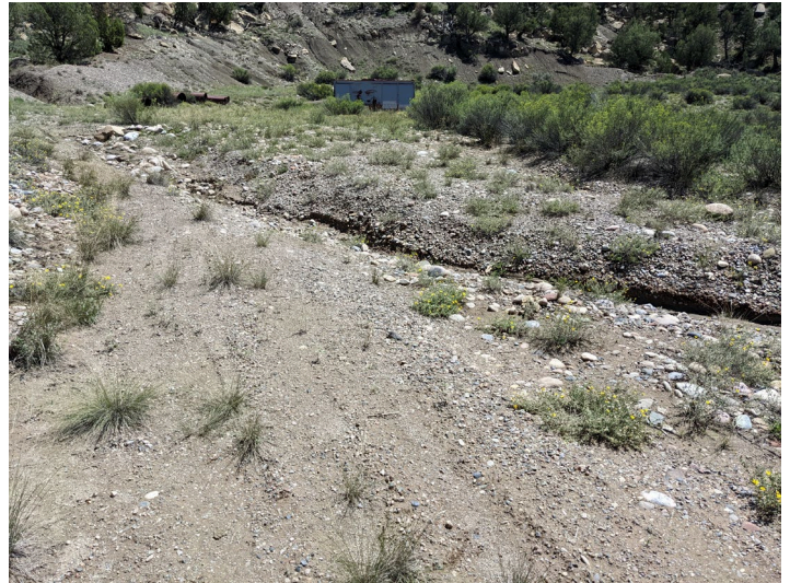
Access road erosion near scalehouse