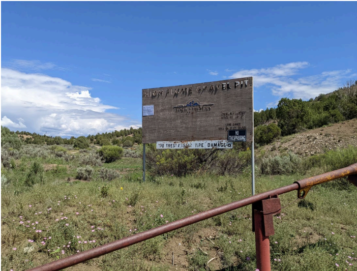
Mine identification sign at entrance