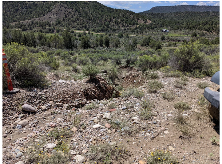
Access road erosion near scalehouse