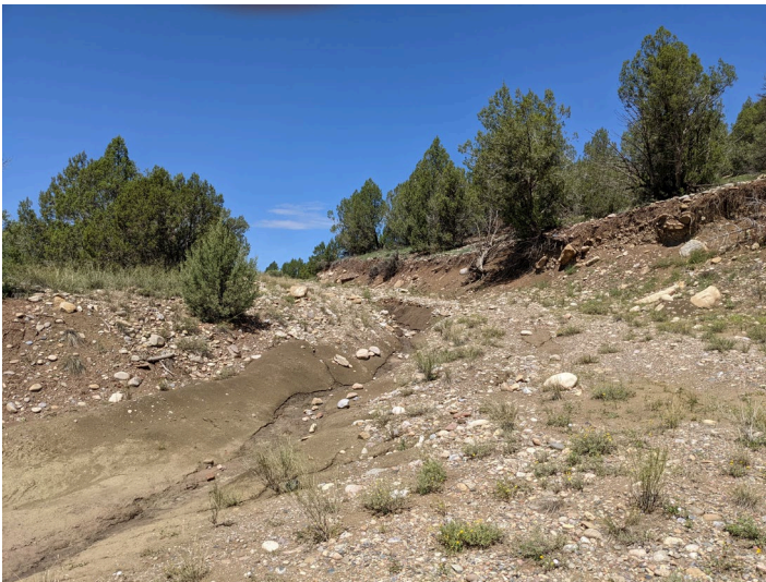
Access road erosion near scalehouse