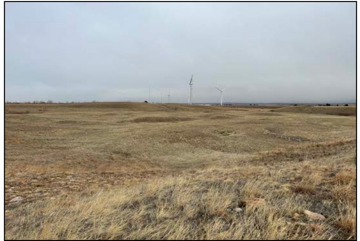
Photo 2 – Overview of representative reclamation of mined area of site. Looking east from site access road.