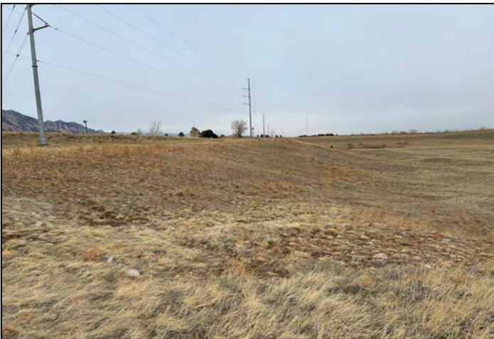
Photo 3 – Overview of representative reclamation of mined area of site. Looking north from site access road.