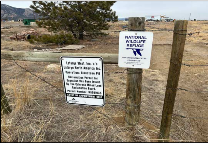
Photo 1 - Site identification sign located at fenced entrance to site. Sign will need to be updated when SO is approved.