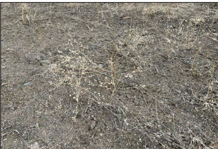
Photo 5 - Knapweed observed on-site at base of active face area. Holcim will need to conduct weed control activity at this site.