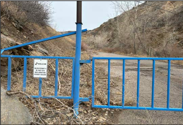
Photo 1 – Locked access gate and site ID sign at entrance from Deer Creek Road.