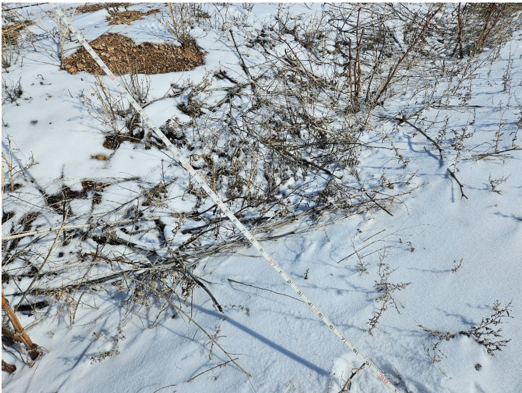
View of the 37' measured offset from WCR 23 ¾ and the southern shoreline of Phase 2 / Pond 1