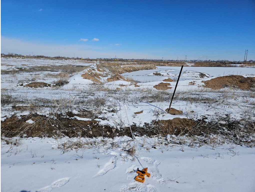
View of the 43' measured offset from WCR 23 ¾ and the southern shoreline of Phase 2 / Pond 1