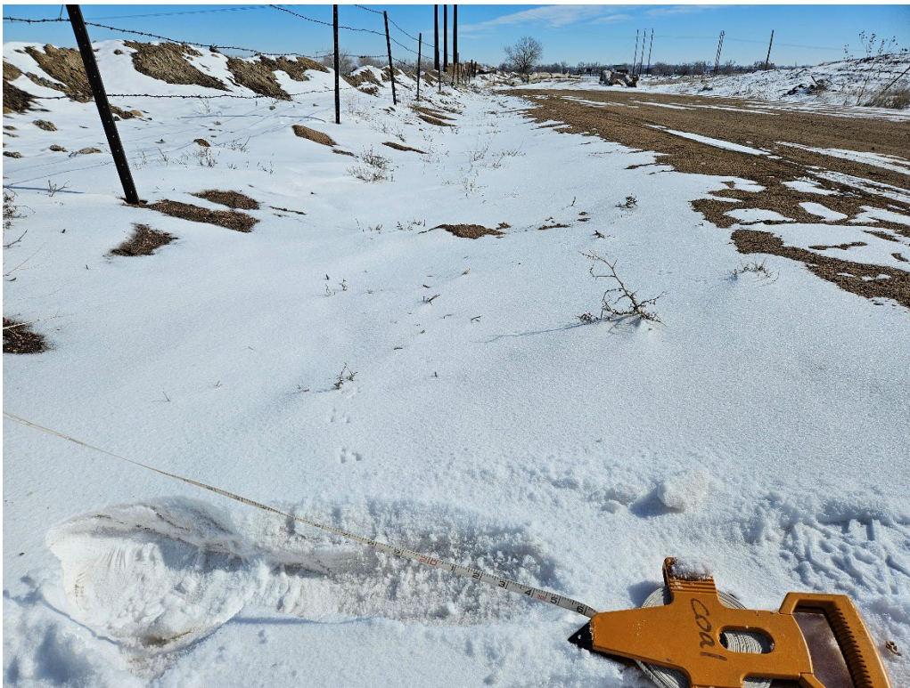
View of the 20' measured offset from WCR 23 \frac{3}{4} and the southern shoreline of Phase 2 / Pond 1