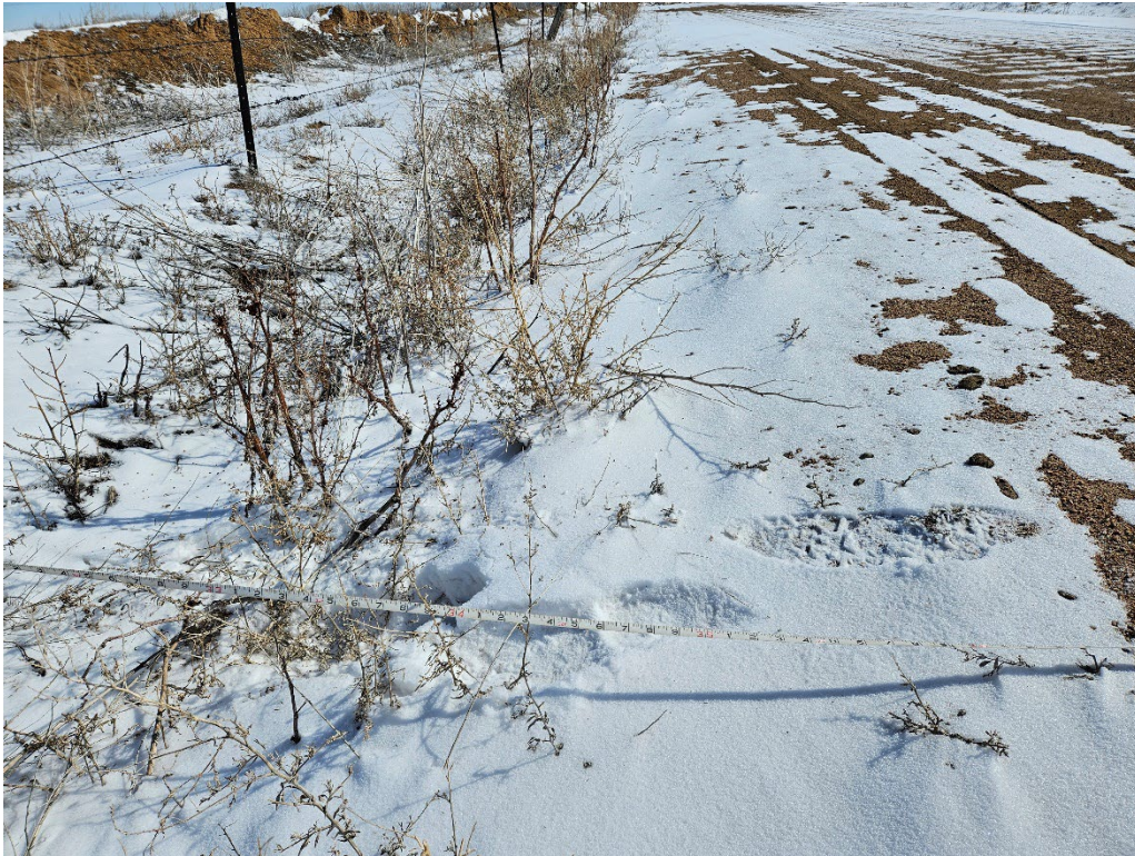
View of the 34' measured offset from WCR 23 \frac{3}{4} and the southern shoreline of Phase 2 / Pond 1