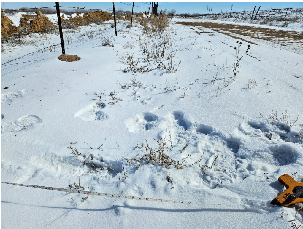
View of the 33' measured offset from WCR 23 \frac{3}{4} and the southern shoreline of Phase 2 / Pond 1