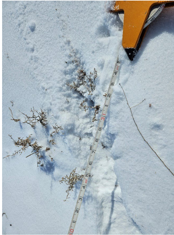
View of the 31' measured offset from WCR 23 \frac{3}{4} and the southern shoreline of Phase 2 / Pond 1