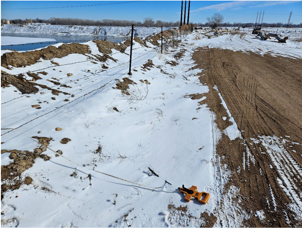
View of the 18' measured offset from WCR 23 \frac{3}{4} and the southern shoreline of Phase 2 / Pond 1