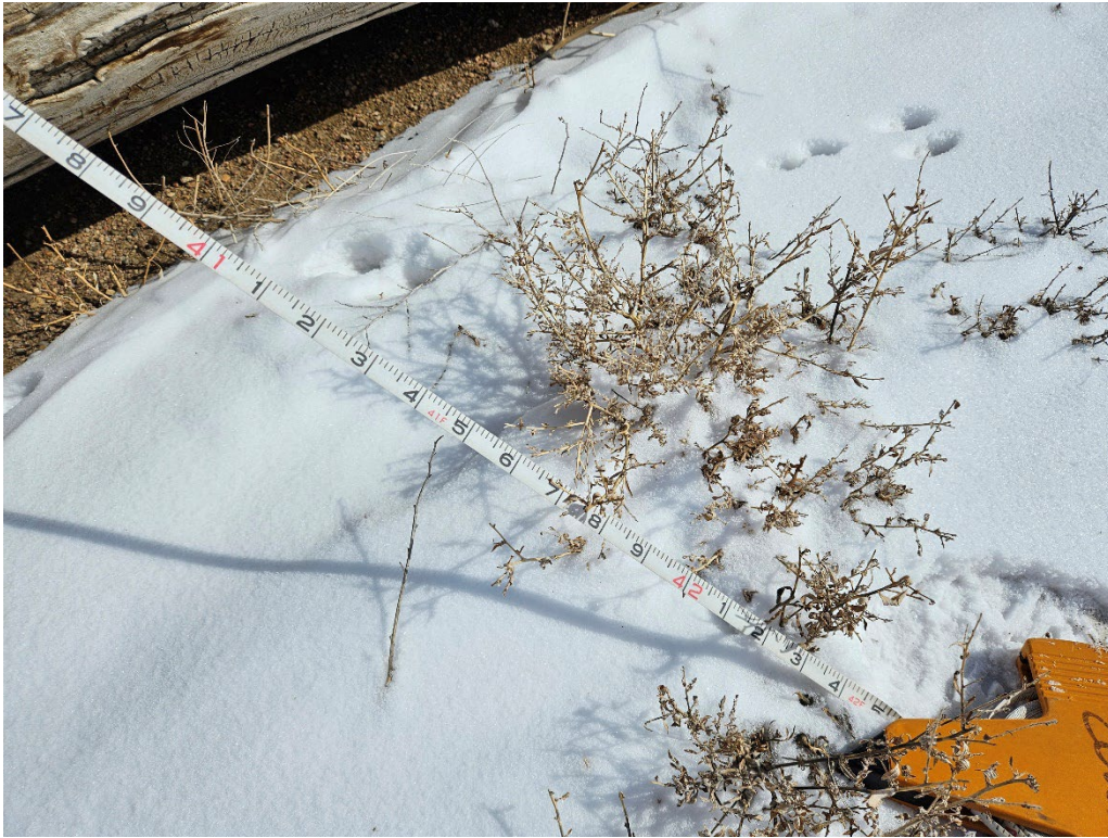
View of the 42' measured offset from WCR 23 ¾ and the southern shoreline of Phase 2 / Pond 1