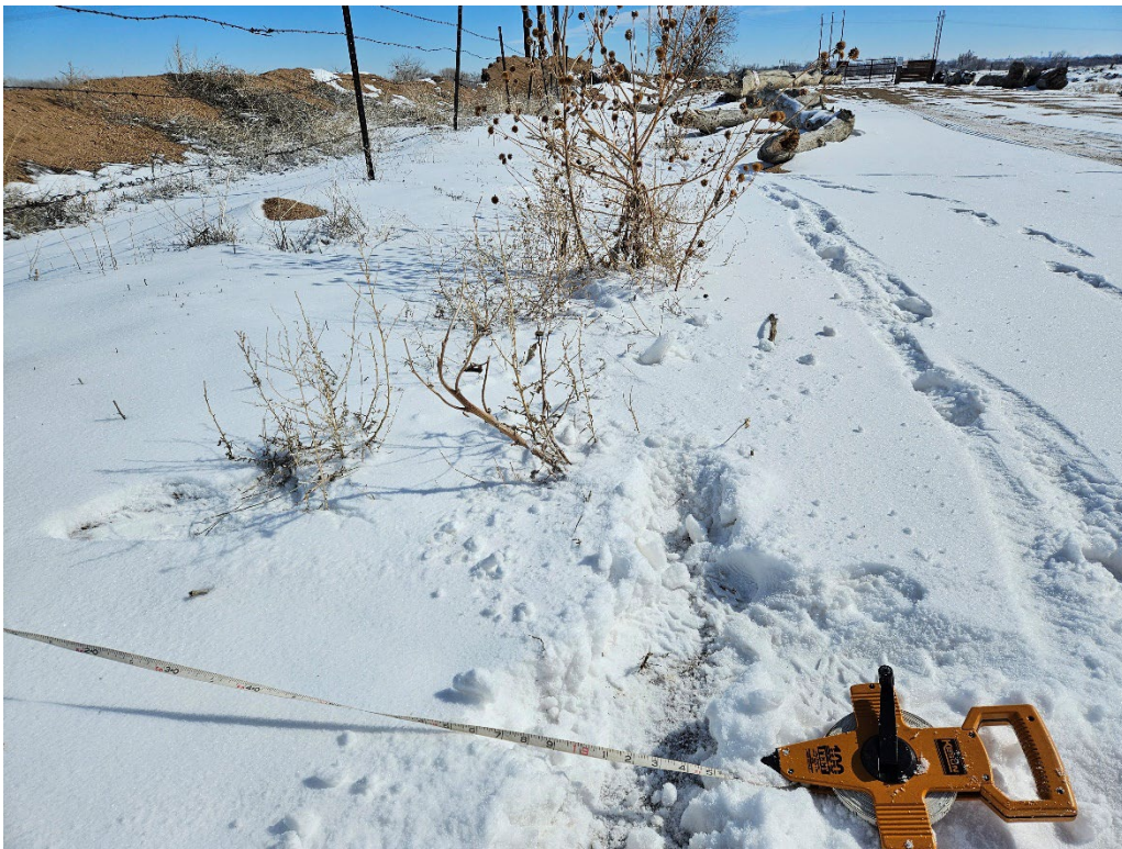
View of the 19' measured offset from WCR 23 \frac{3}{4} and the southern shoreline of Phase 2 / Pond 1