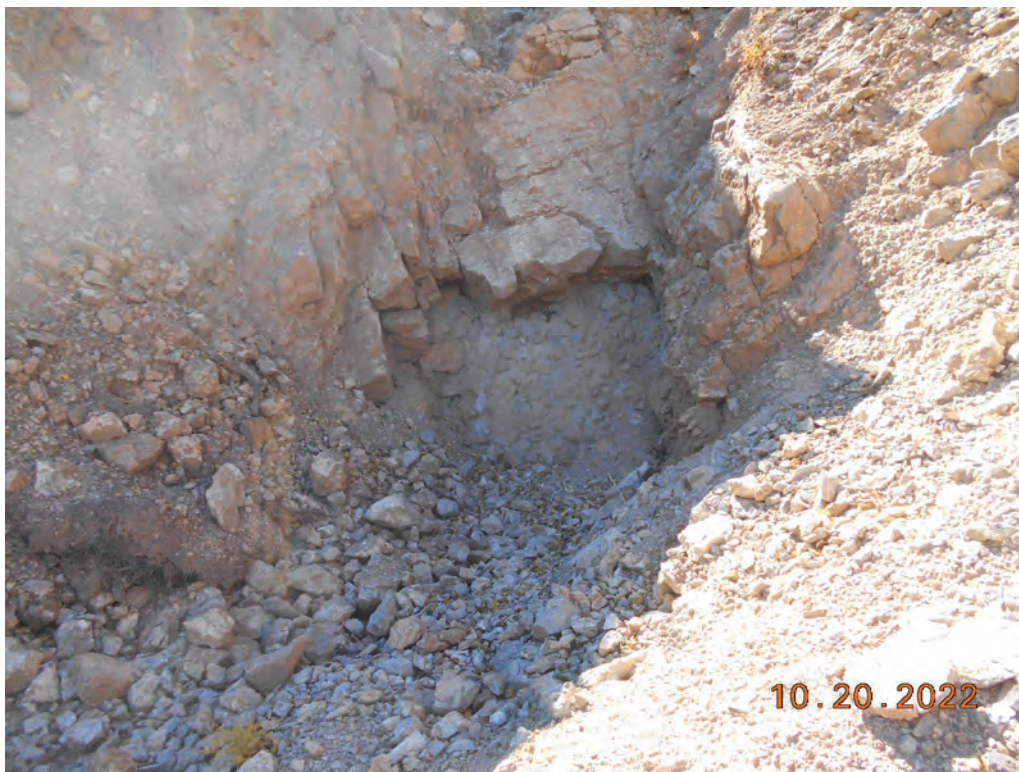
Figure 29. Upper portal reclamation