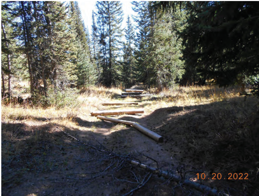
Figure 8. Road reclamation E portion of access road.