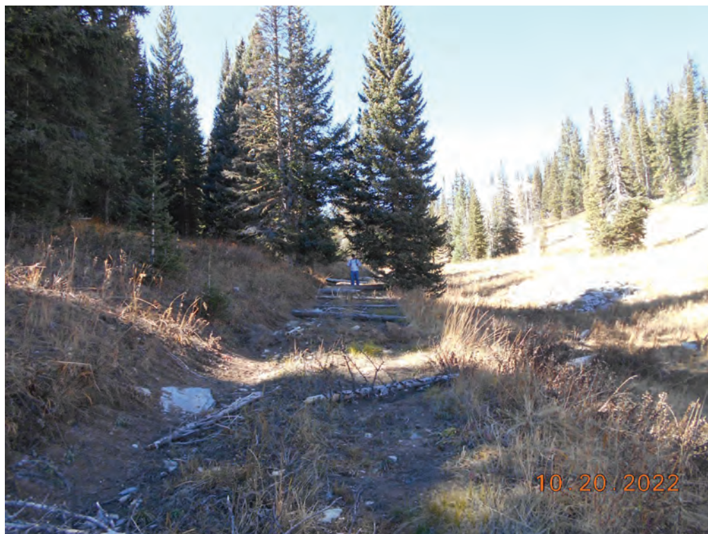
Figure 18. Road reclamation on E portion of access road.