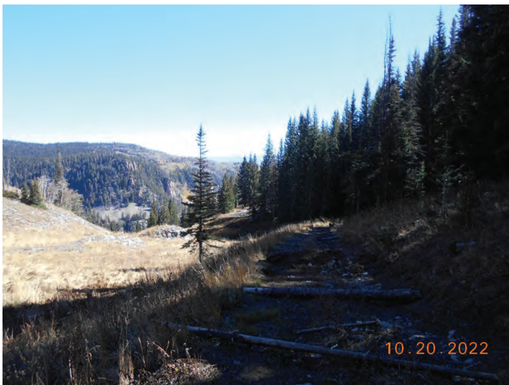
Figure 3. Road reclamation N portion of access road.