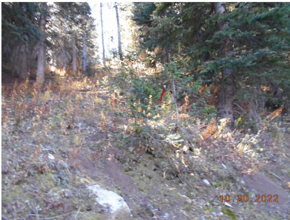
Figure 23. Stake