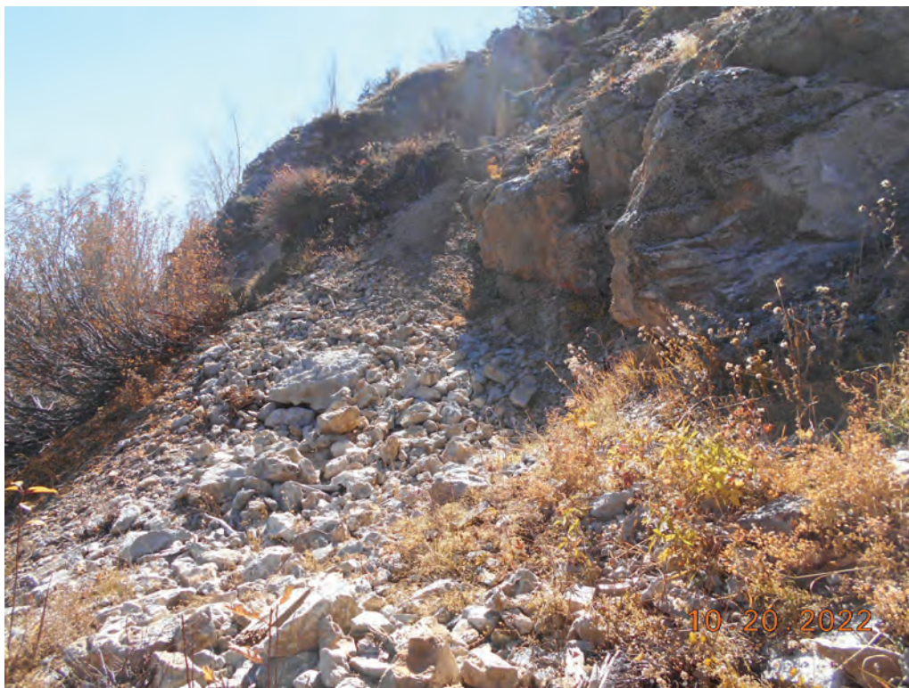
Figure 27. Lower portal reclamation