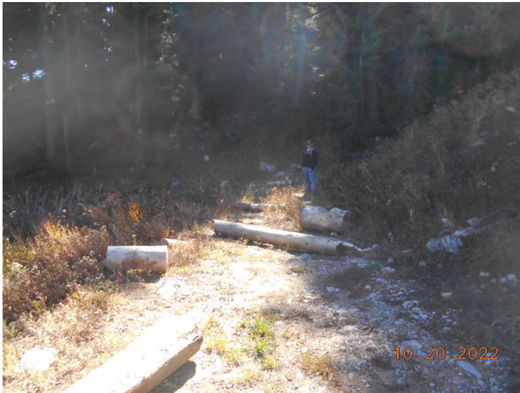
Figure 30. Road reclamation between former cabin site and adits.