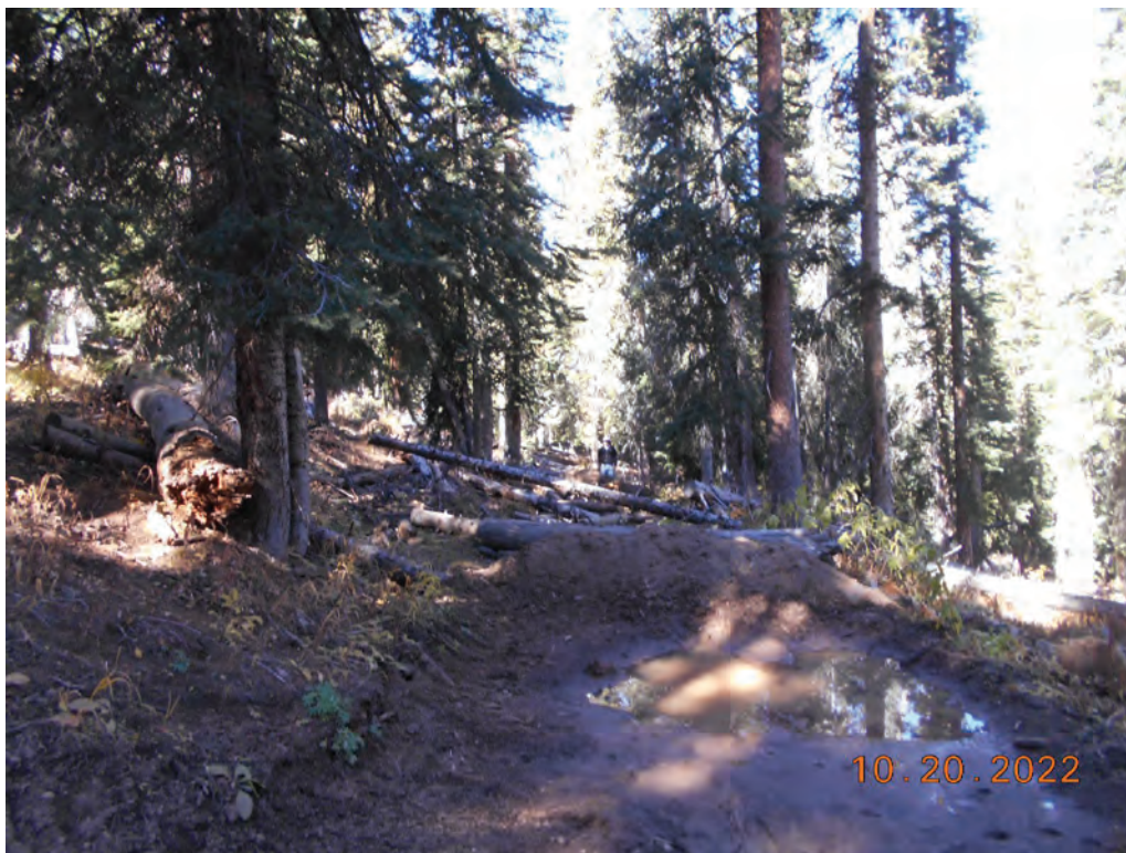
Figure 11. Road reclamation near intersection of NFSR 602 at former gate location