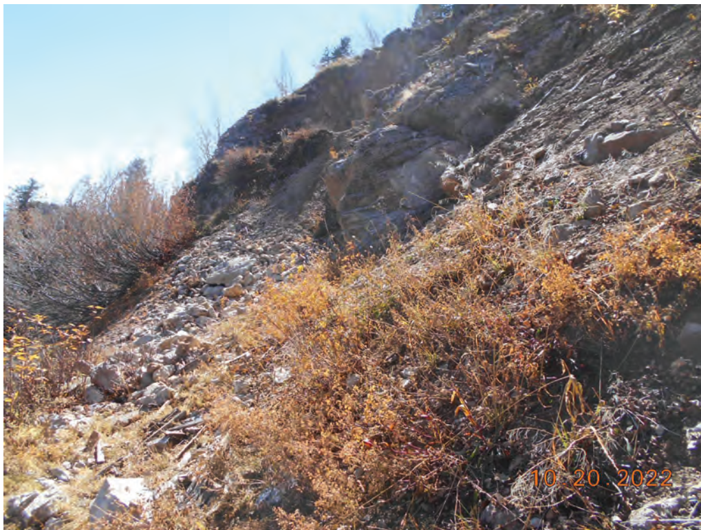
Figure 26. Lower portal reclamation