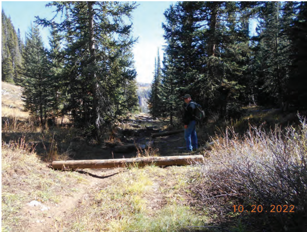
Figure 6. Road reclamation NE portion of access road.