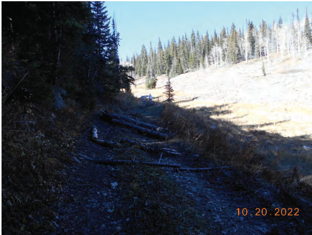
Figure 20. Road reclamation on E portion of access road.