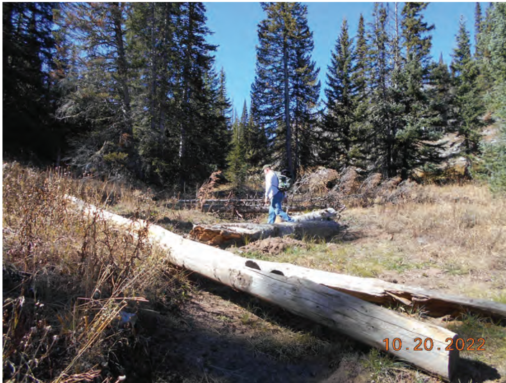
Figure 16. Road reclamation N portion of access road