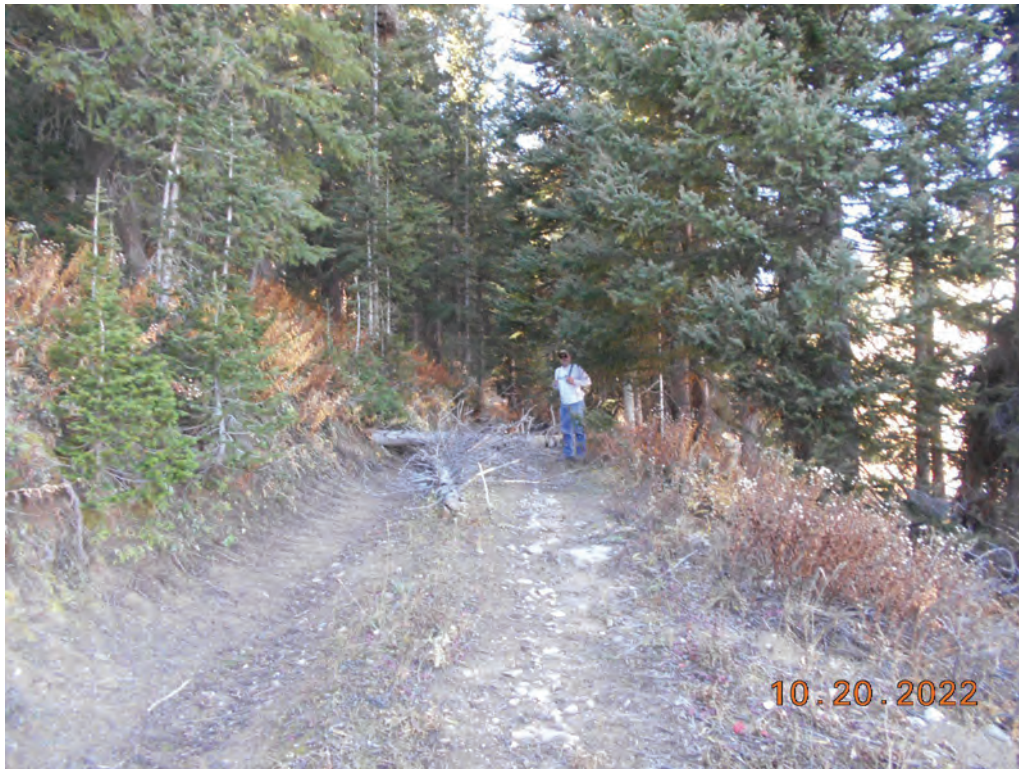
Figure 22. Road reclamation on E portion near former cabin site.