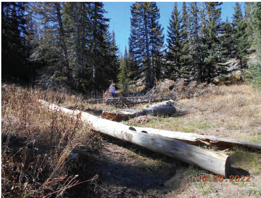
Figure 15. Road reclamation on N portion of access road.