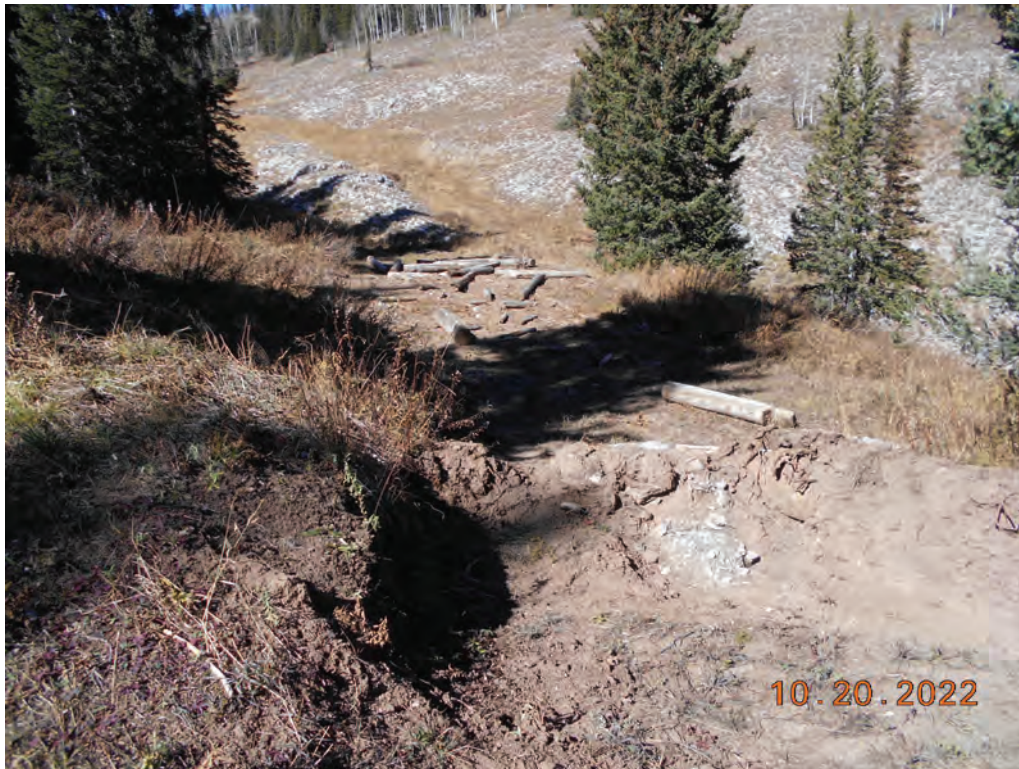
Figure 2. Road reclamation showing rolling dip at N portion of access road.