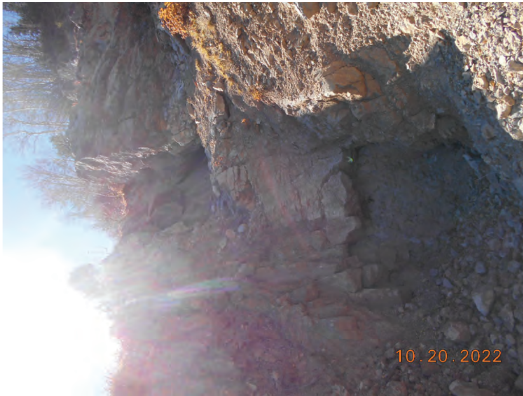
Figure 28. Upper portal reclamation