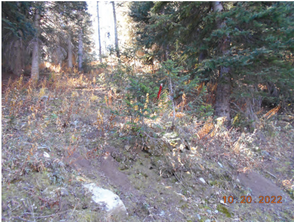
Figure 24. Stake