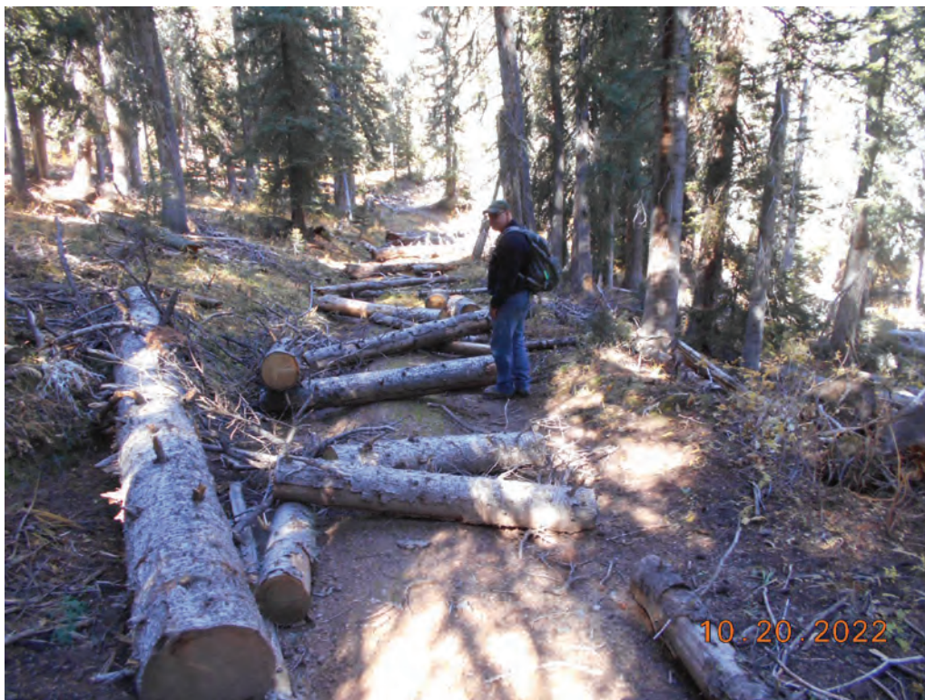
Figure 9. Road reclamation immediately past gate location.