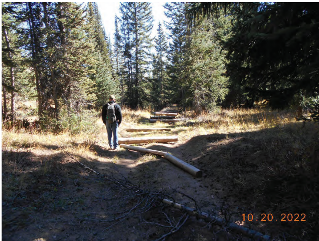
Figure 7. Road reclamation on E portion of access road.