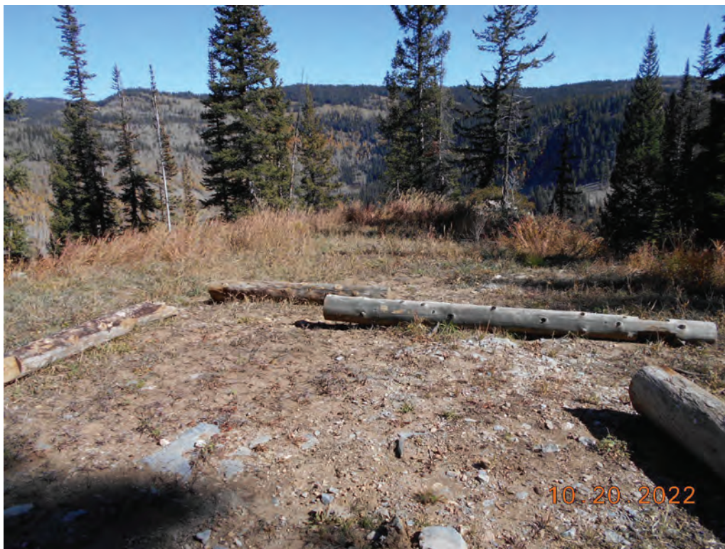
Figure 31. Former cabin site reclamation