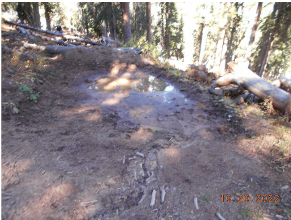
Figure 12. Road reclamation near intersection of NFSR 602 at former gate location