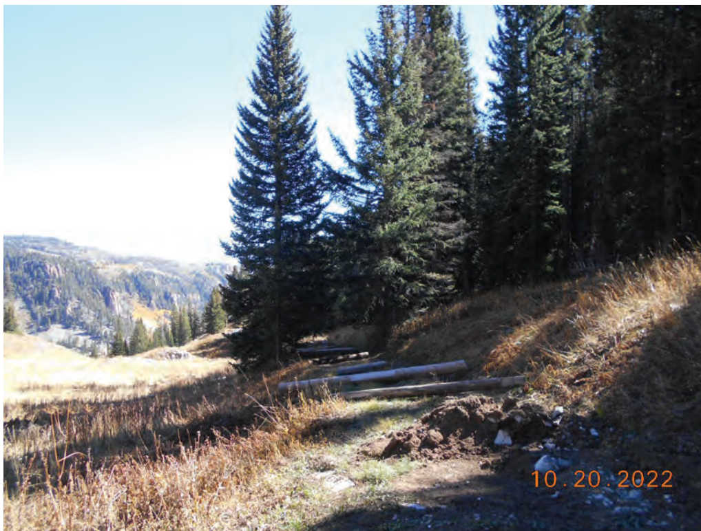
Figure 5. Road reclamation NE portion of access road.