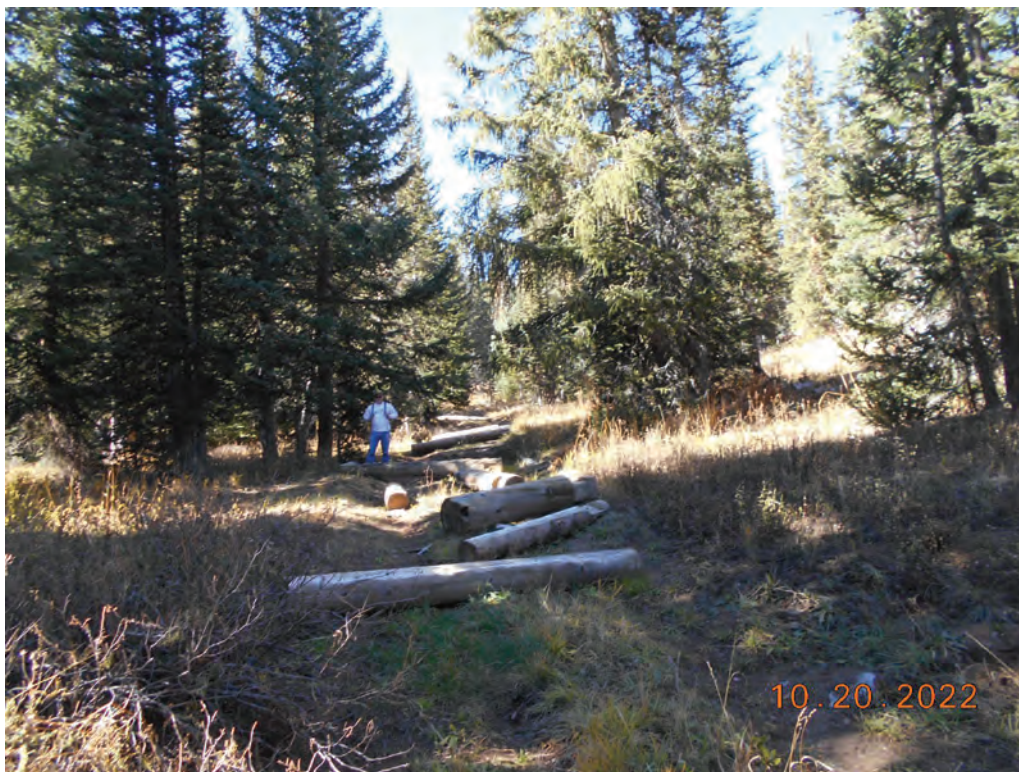
Figure 13. Road reclamation N portion of access road.