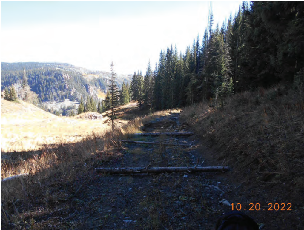
Figure 4. Road reclamation N portion.