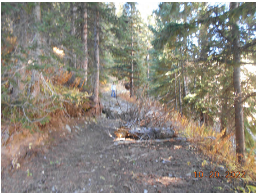
Figure 21. Road reclamation on E portion of access road.