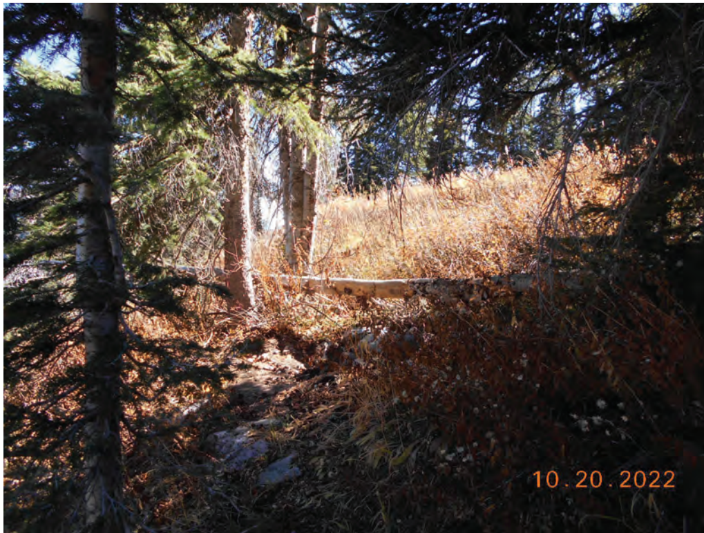
Figure 32. Former outhouse site reclamation