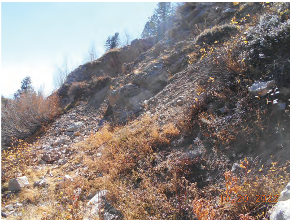
Figure 25. Lower portal reclamation