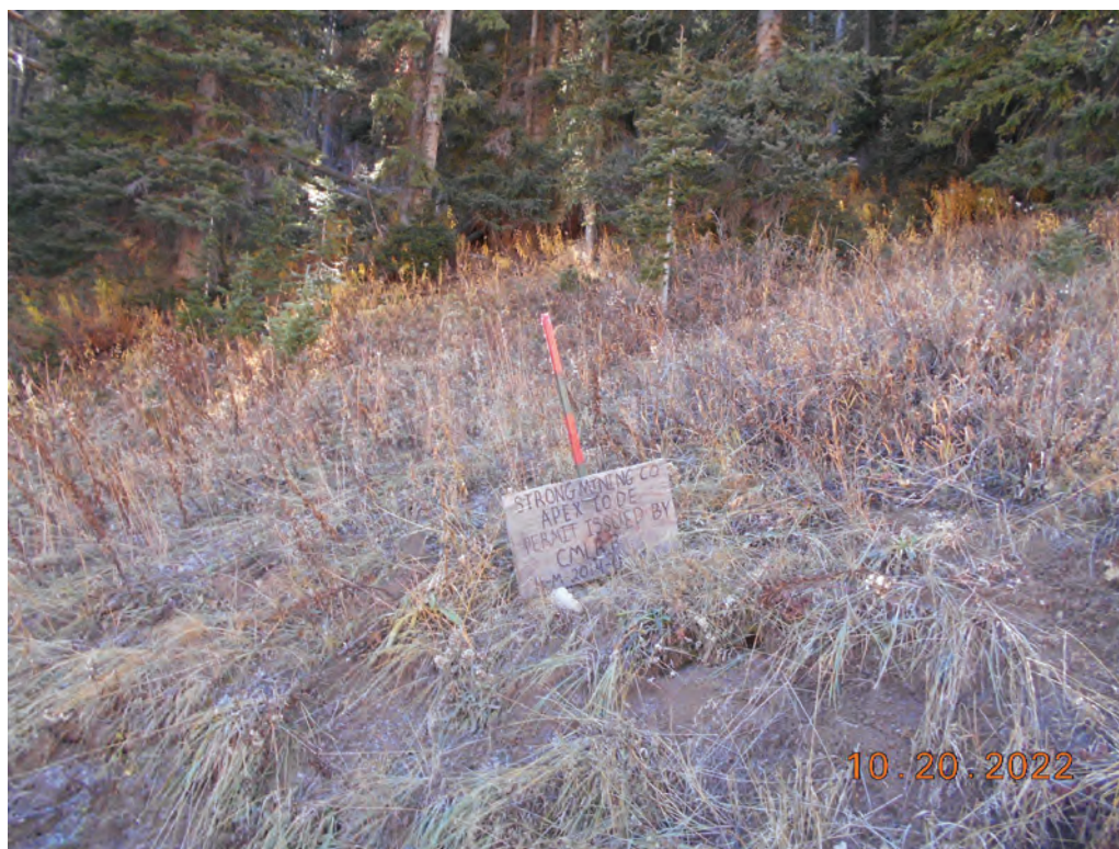
Figure 19. Stake