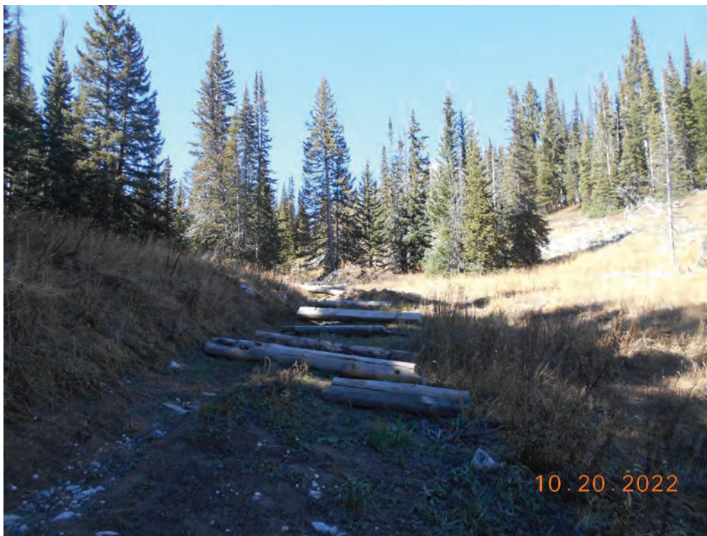
Figure 17. Road reclamation on NE portion of access road.