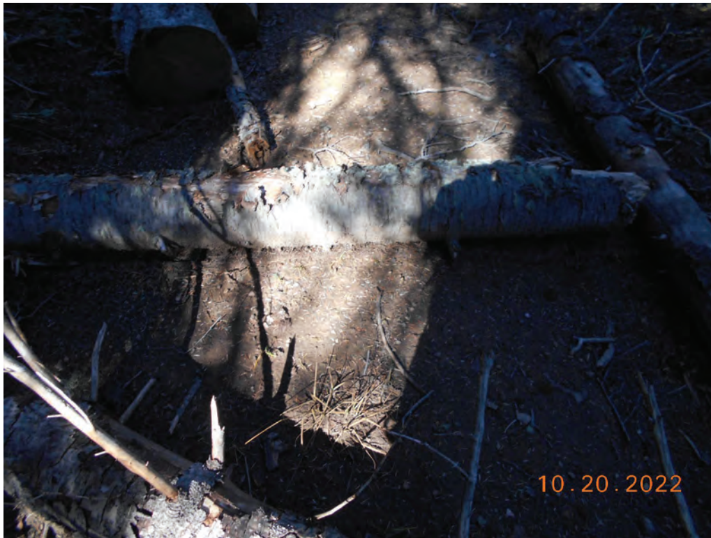
Figure 10. Road reclamation showing seeding near intersection with NFSR 602.