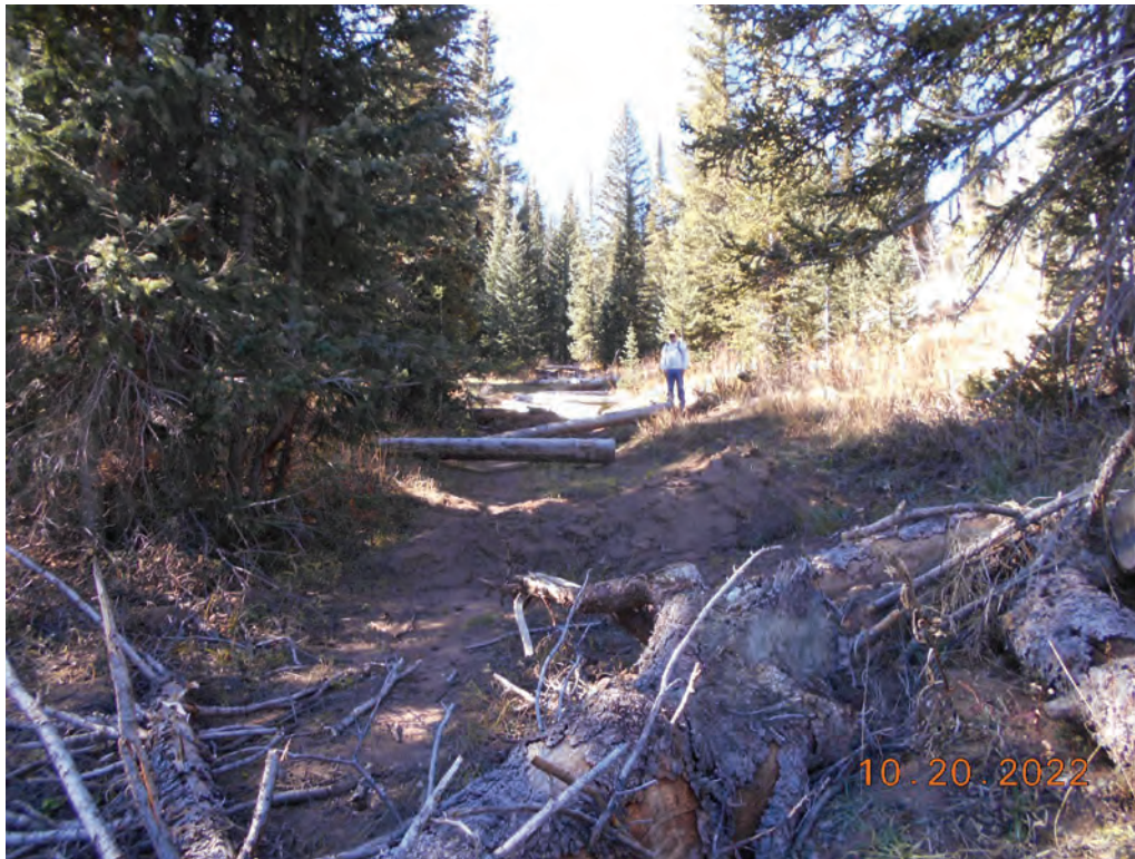
Figure 14. Road reclamation on NW portion of access road.