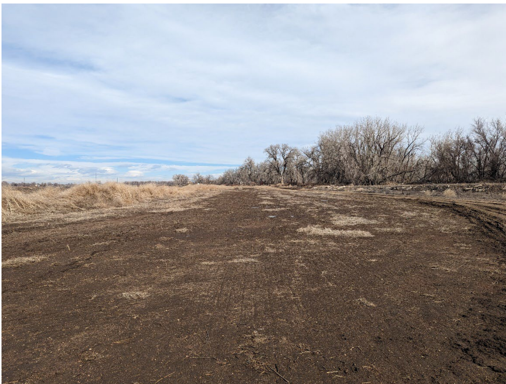
View of the site from the south side looking north