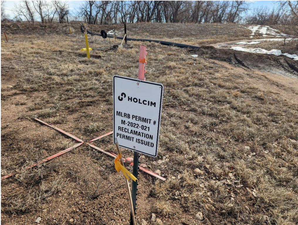
Wattenberg Disturbance mine sign