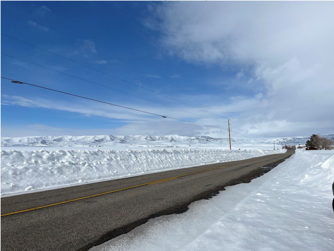
Photo 5: View NW of proposed mine expansion area. Areas are fenced off and serve as agricultural fields out of the winter season.