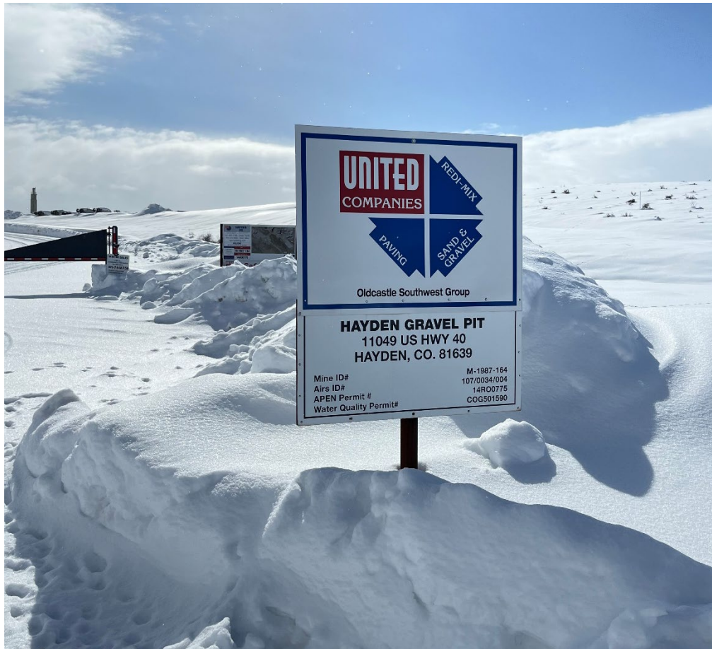
Photo 2: Mine sign and site identification present at the entrance to the mine site.