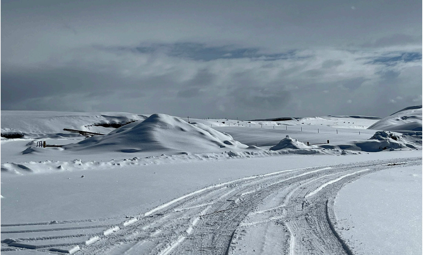
Photo 4: Second fence line seen in the far distance represents the southernmost boundary line of the adjacent, county owned Funk and Hooker Pit (M-1979-058)