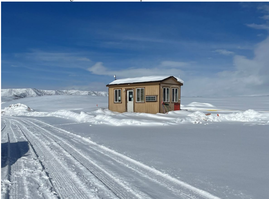
Photo 3: Shared scale house between Hayden Gravel Pit and adjacent, county owned Funk and Hooker Pit (M-1979-058)