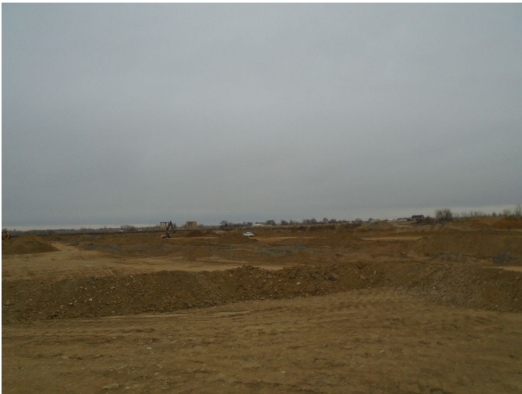
View of the active mining operations from the southwest corner of block F looking northeast