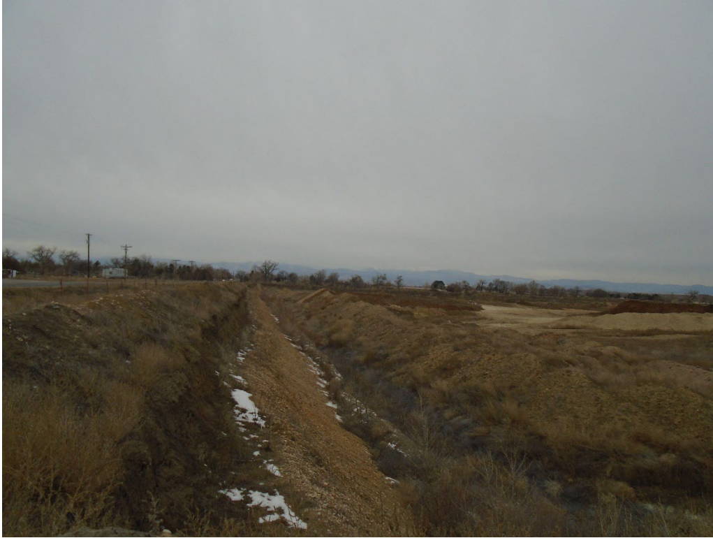
View of the southern highwall along WCR 20.5 looking west