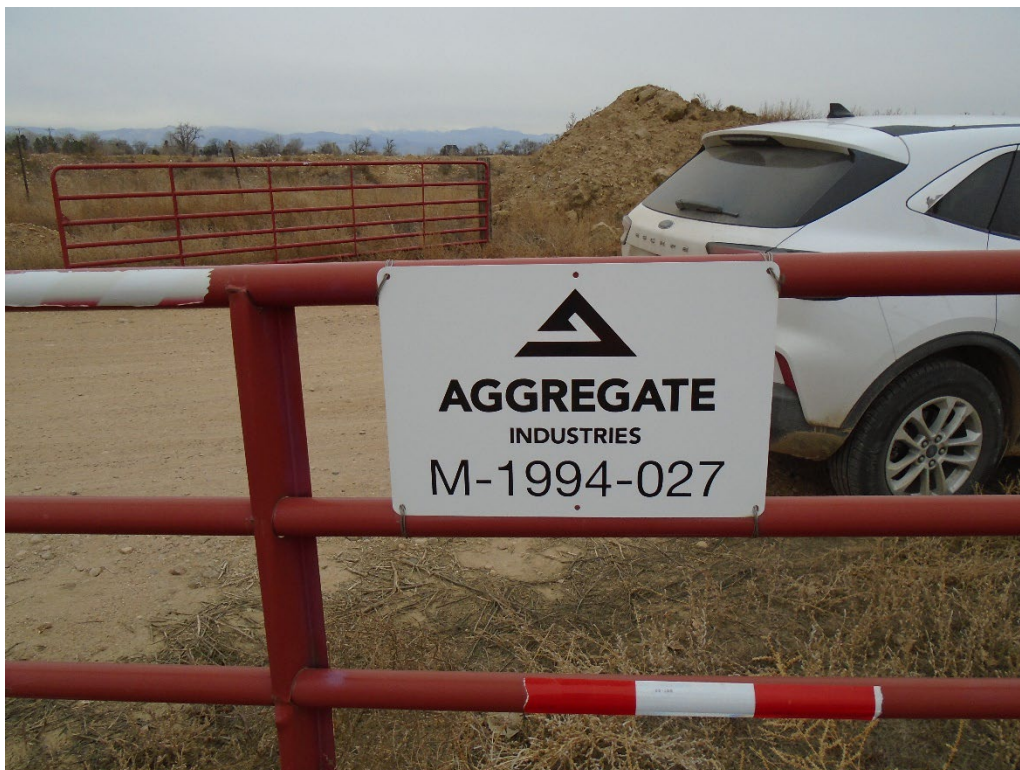
Inaccurate Longmont Operations mine sign