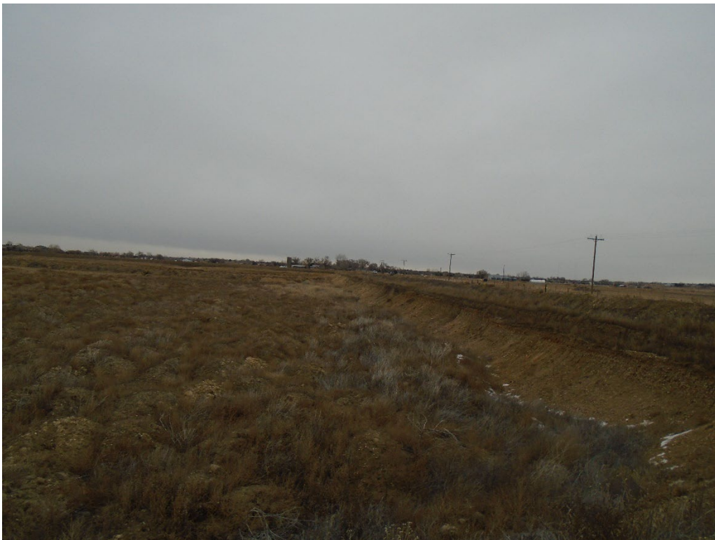
View of the southern highwall along WCR 20.5 looking east