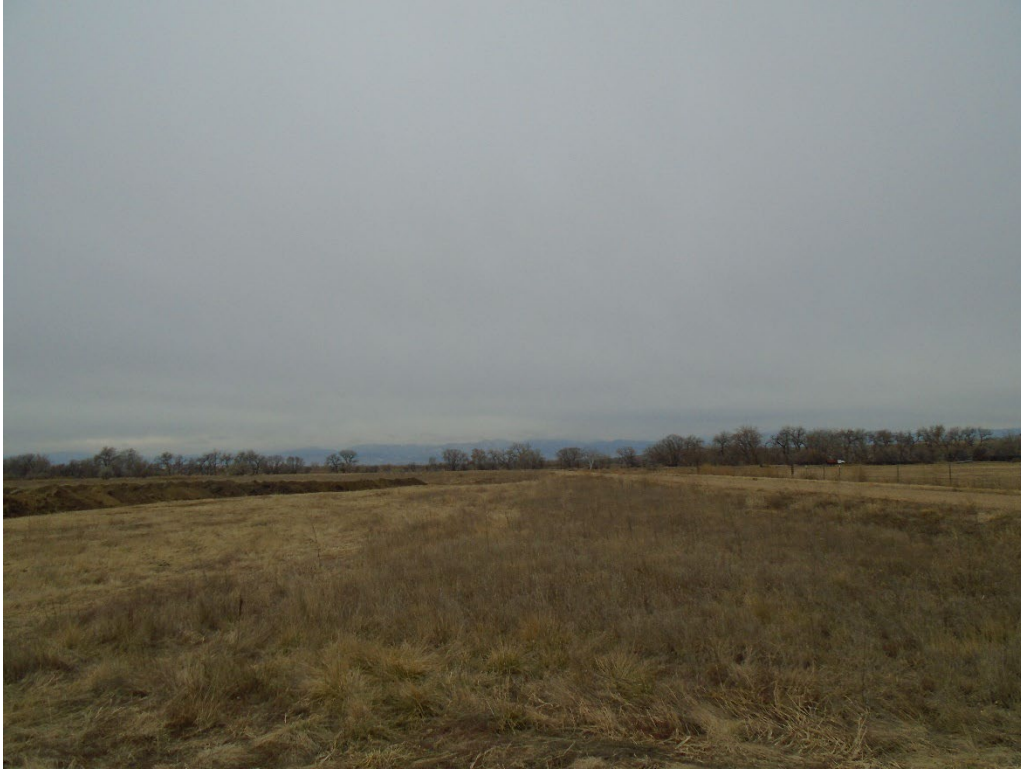
View of the last unstripped mining area at the north end of block F