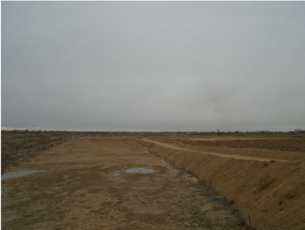
View of the site from the south entrance looking north