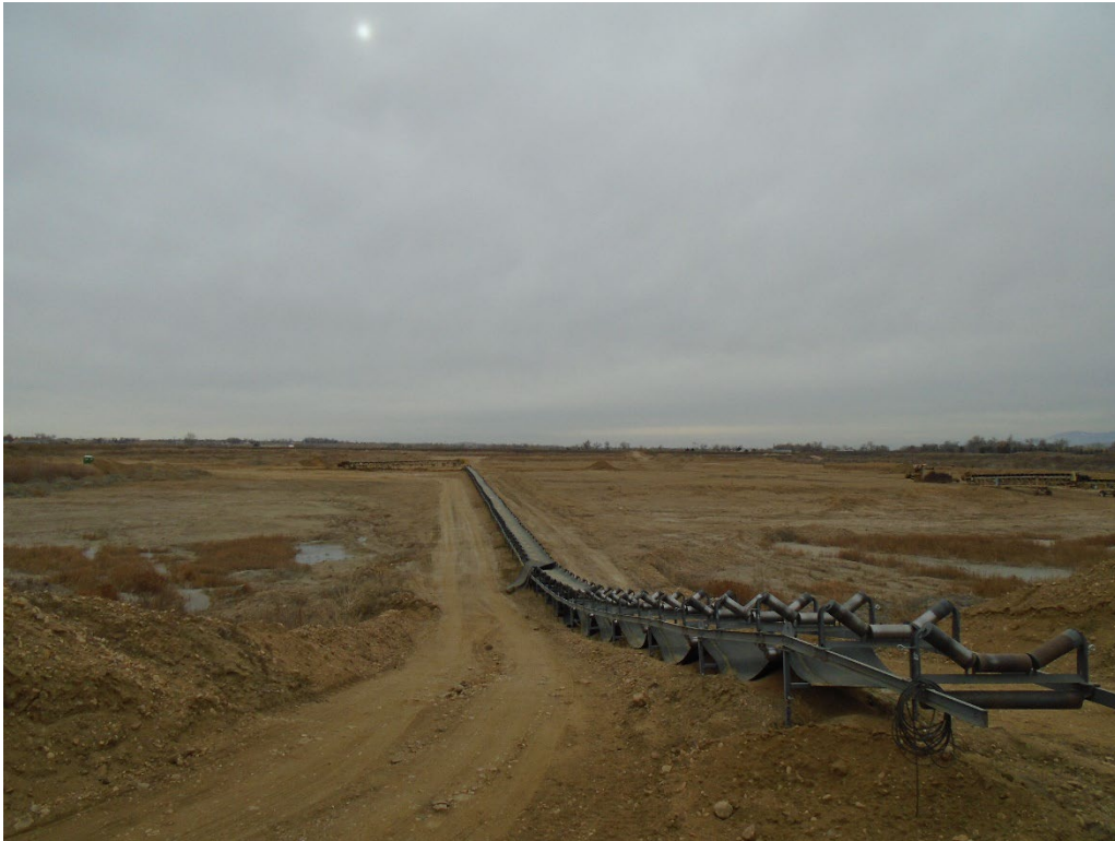
View of the site from the northeast corner looking east