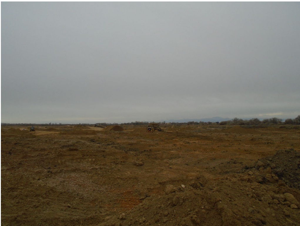
View of the active mining operations from the northeast corner of block F looking southwest