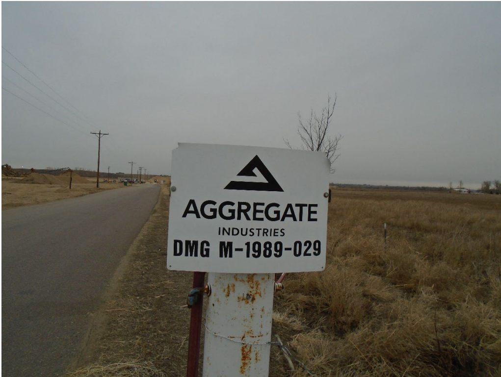
View of the mine sign for the Longmont Distel Operations