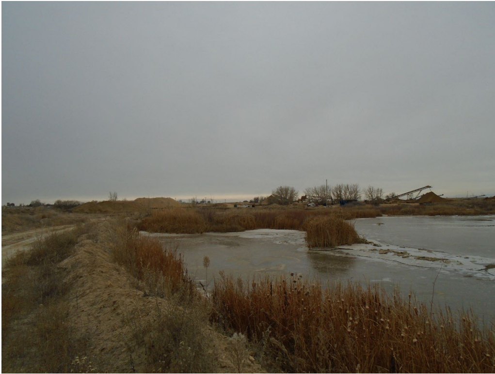
View of the processing plant area from the Bigelow property looking east