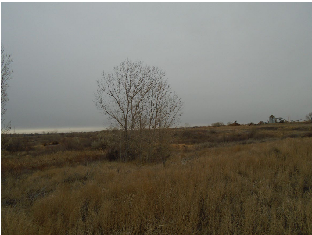
View of the site from the Bigelow property looking east