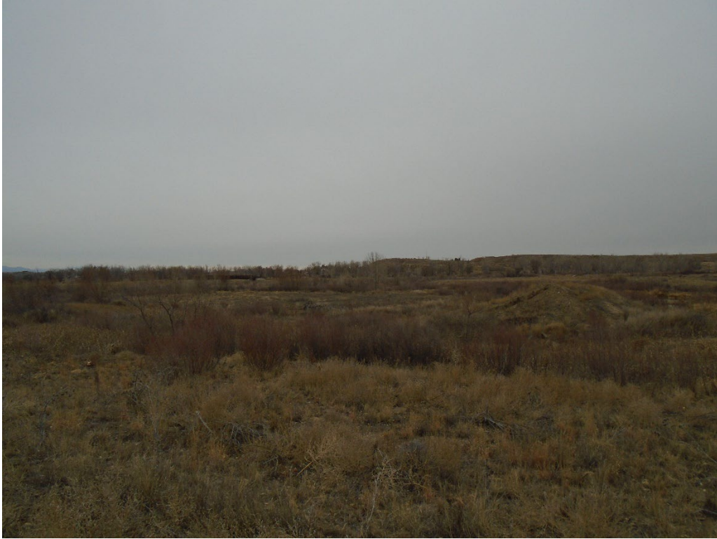
View of the site from the Bigelow property looking northwest