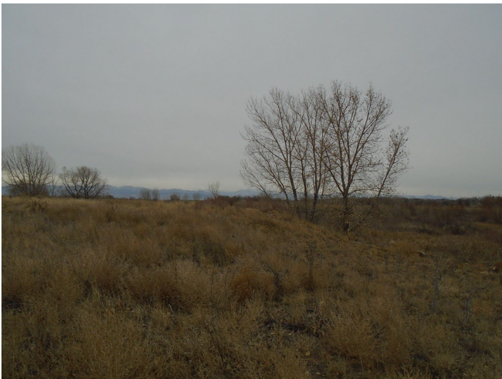
View of the site from the Bigelow property looking west