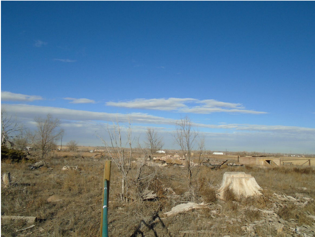
View of the site from the entrance gate off of Hwy 60 looking north