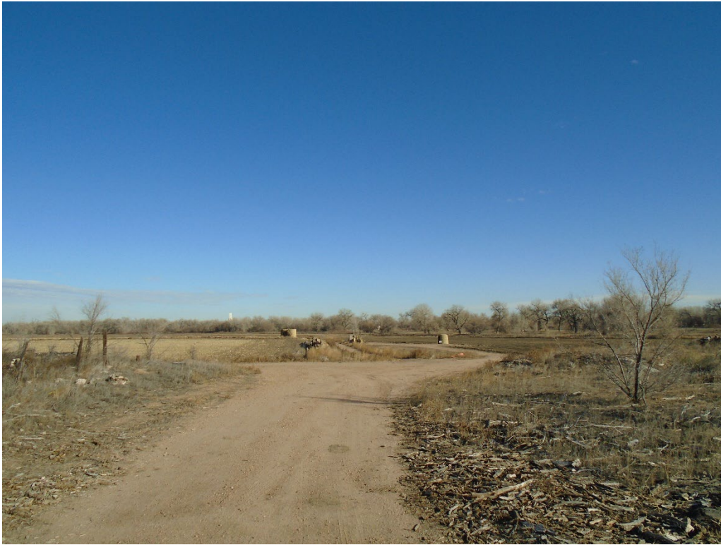
View of the site from the entrance gate off of Hwy 60 looking east