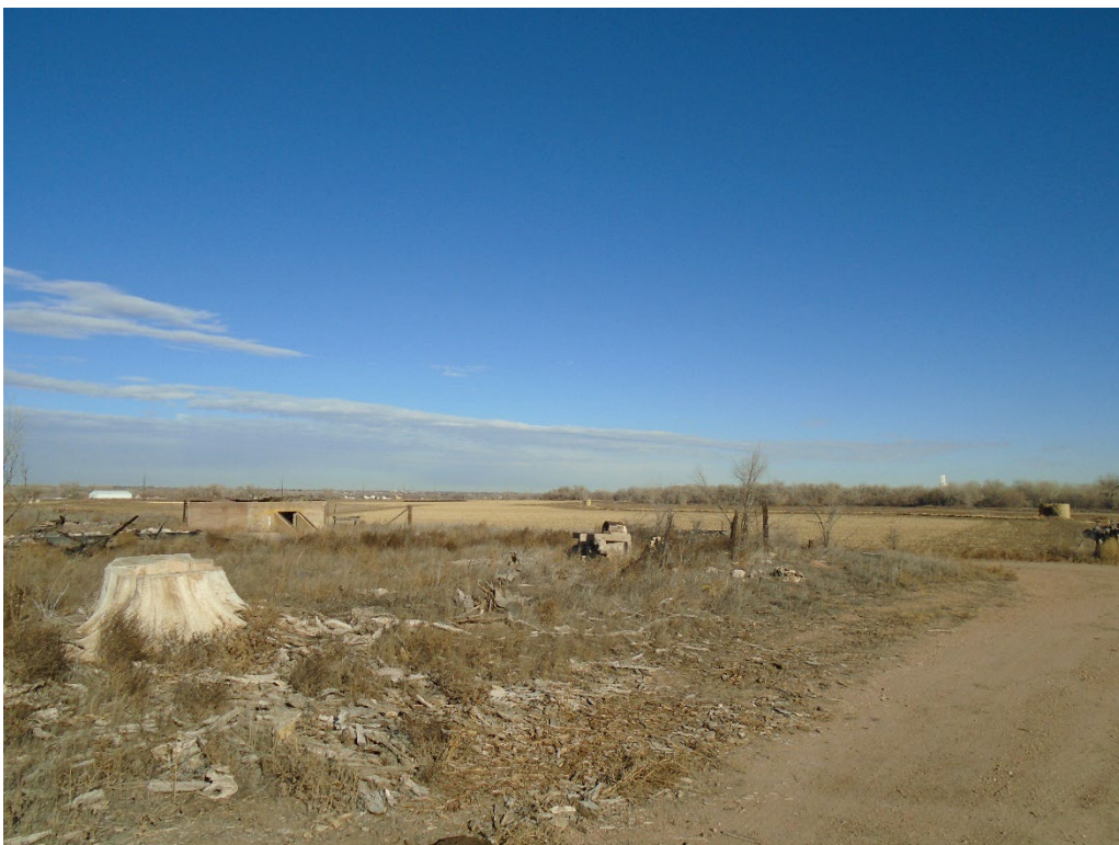
View of the site from the entrance gate off of Hwy 60 looking northeast