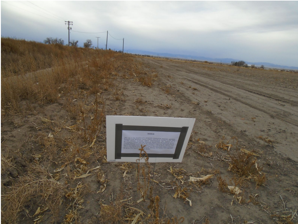
Korwell Dirt notice sign posted off of WCR 40