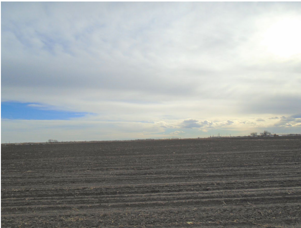
View of the site from the northern boundary looking south