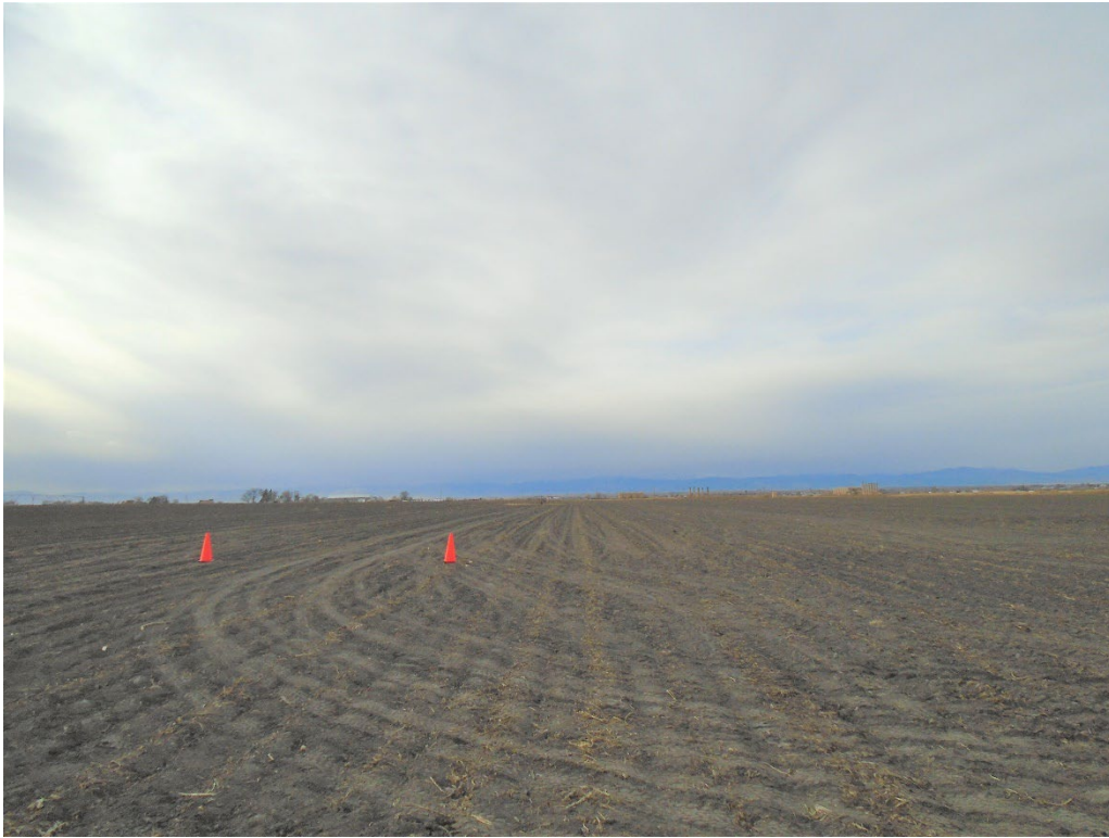
View of the site from the eastern boundary looking west