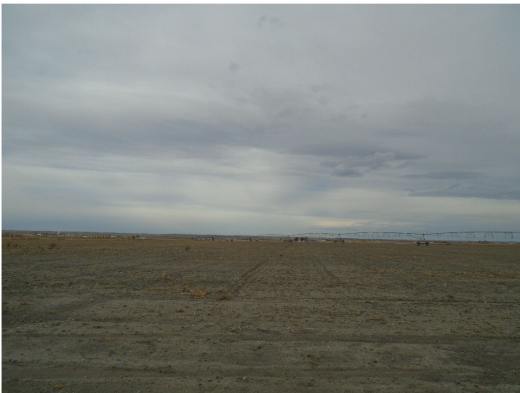
View of the site from the southern boundary looking north