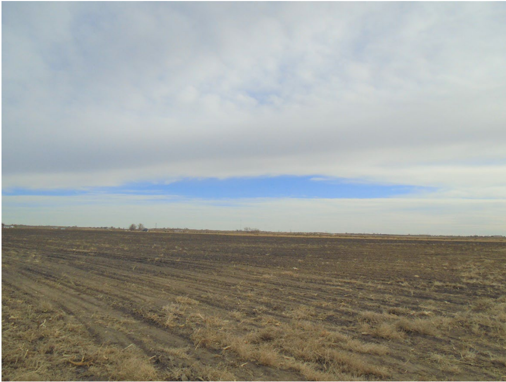
View of the site from the northwest corner looking southeast

Craig Rasmuson Korwell Land Holdings, LLC P.O. Box 337282 Greeley, CO 80633