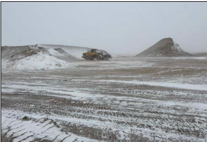
Photo 3 - at site entrance looking east-northeast at loader and topsoil stockpile (behind loader).