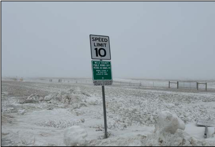
Photo 1 - site identification sign at site access point.