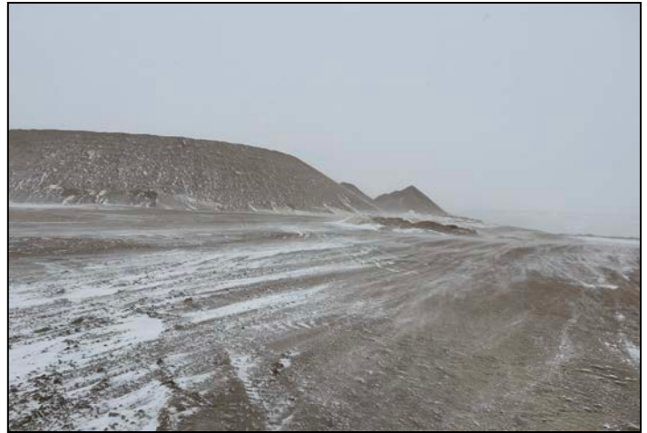
Photo 2 - looking South-southeast at material stockpile from entrance to site.