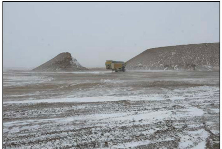
Photo 4 - looking east at product stockpiles at site entrance.