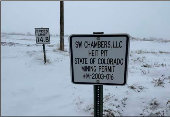
Photo 1 - Site identification sign at site entrance will need to be updated.