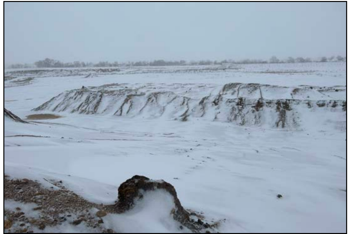
Photo 2 - remaining material in pit will be removed or regraded by Broomfield prior to final release.