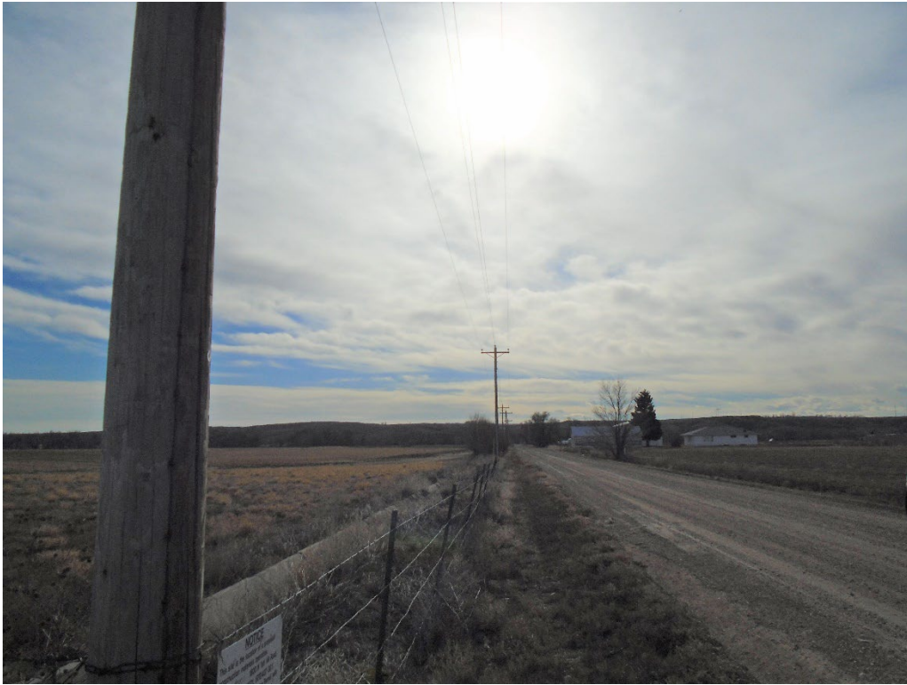
View of WCR 23 from the site entrance looking south