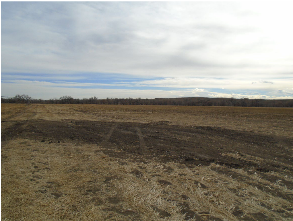
View of the plugged oil and gas well reclamation