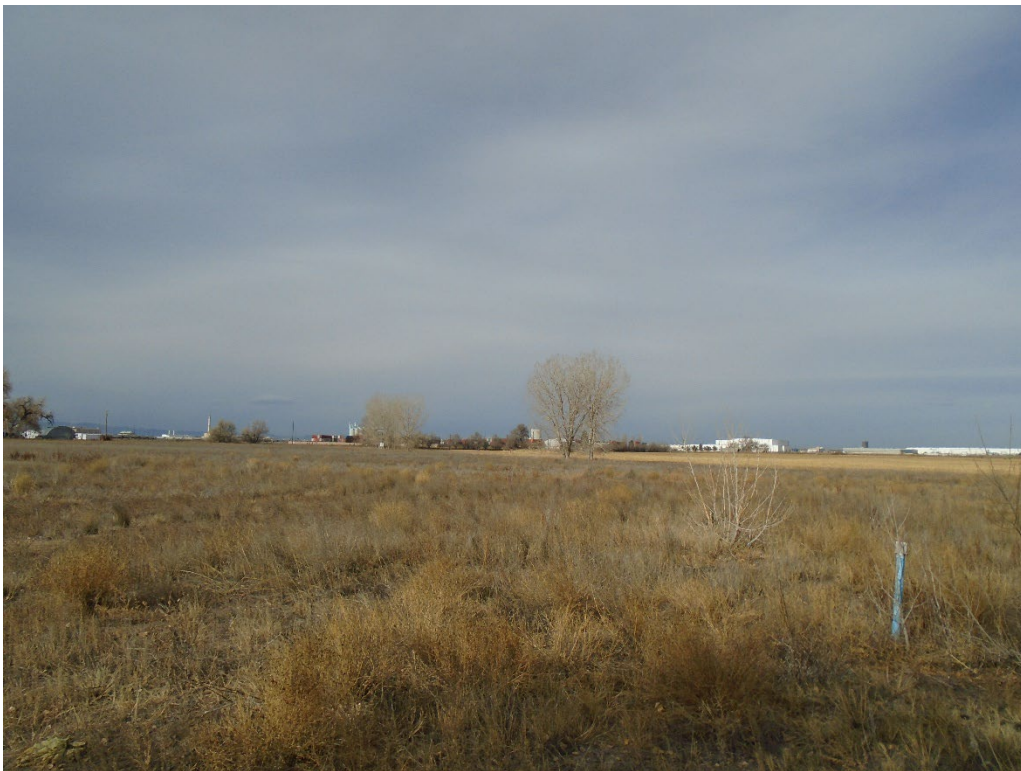
View of the site from the southwest corner looking northeast