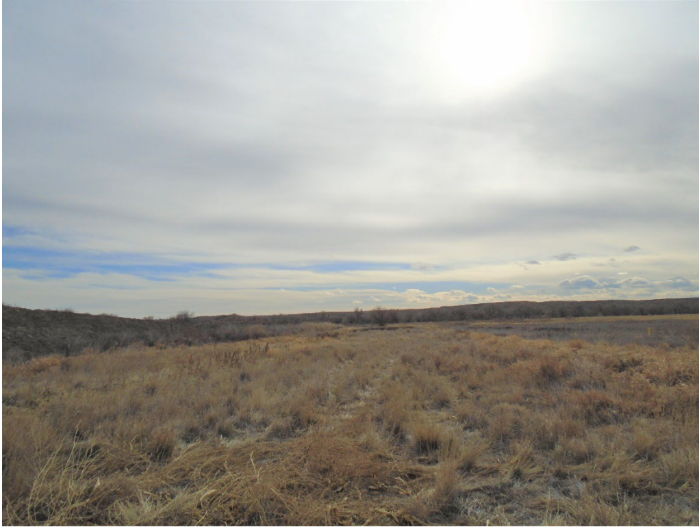
View of the site from the northwest boundary corner looking south