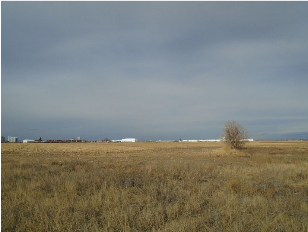
View of the site from the south boundary looking north