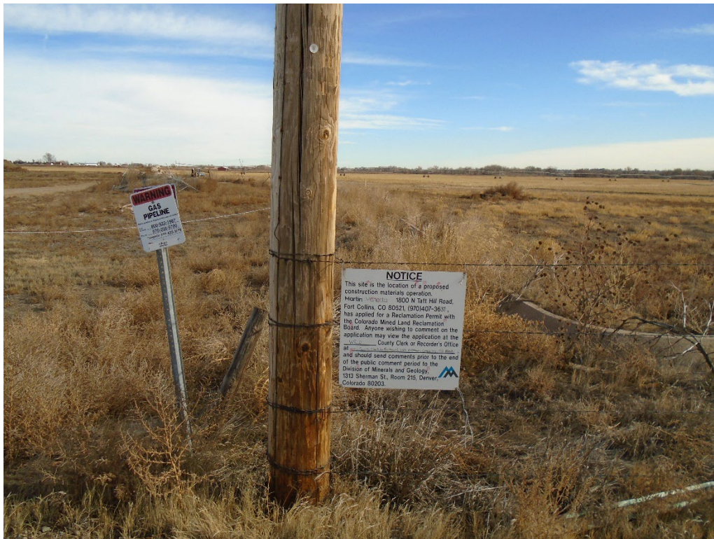
View of the notice sign posted at the site entrance from WCR 23