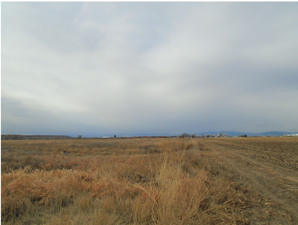
View of the site from the west boundary looking west