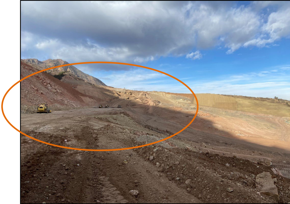
Photo 1 – Material is being actively removed from North Borrow Area.