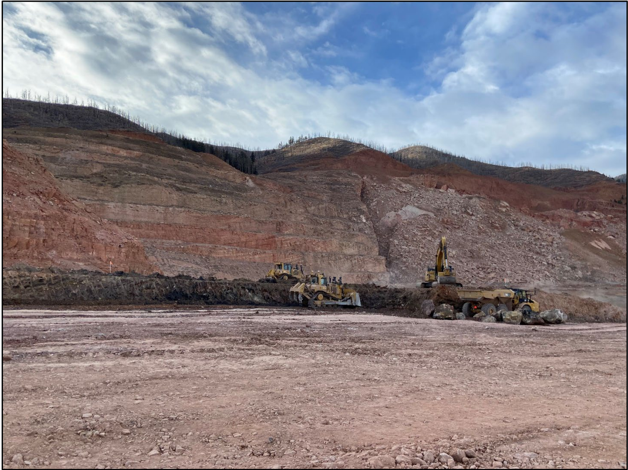
Photo 5 – Another photo of material being actively removed from USFS South Borrow Area.