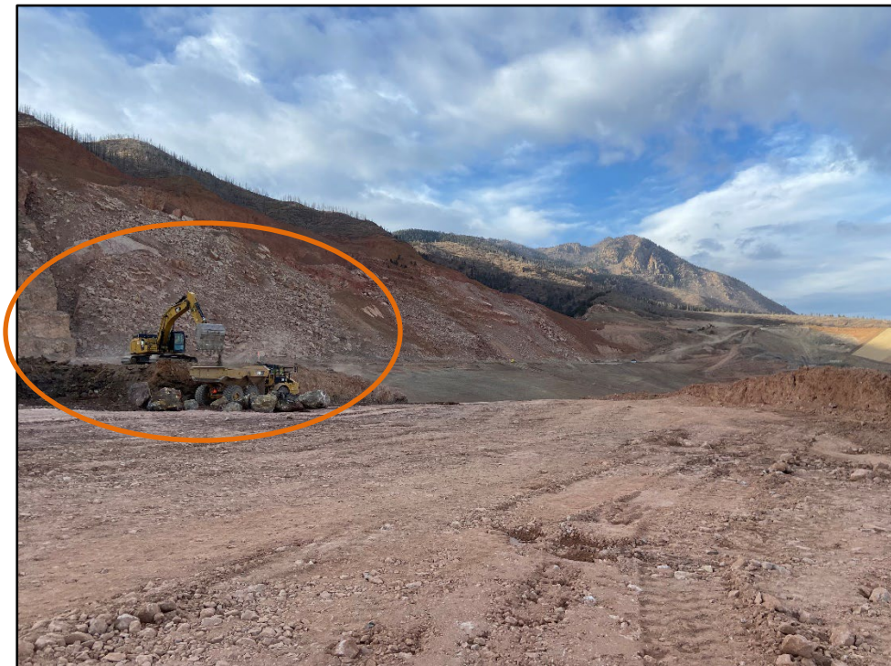
Photo 4 – Fill material being actively removed from USFS South Borrow Area.