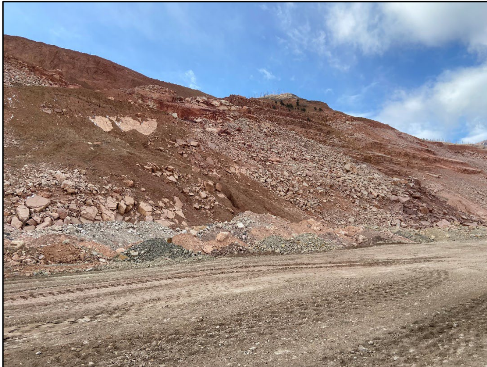
Photo 2 – Fill material is being actively placed in main backfill area.