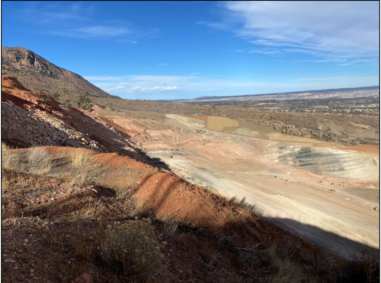
Photo 1 – Overview of the Pikeview Quarry looking north. Revegetation test plots are being installed on the private/ City land at the north end of the project area.