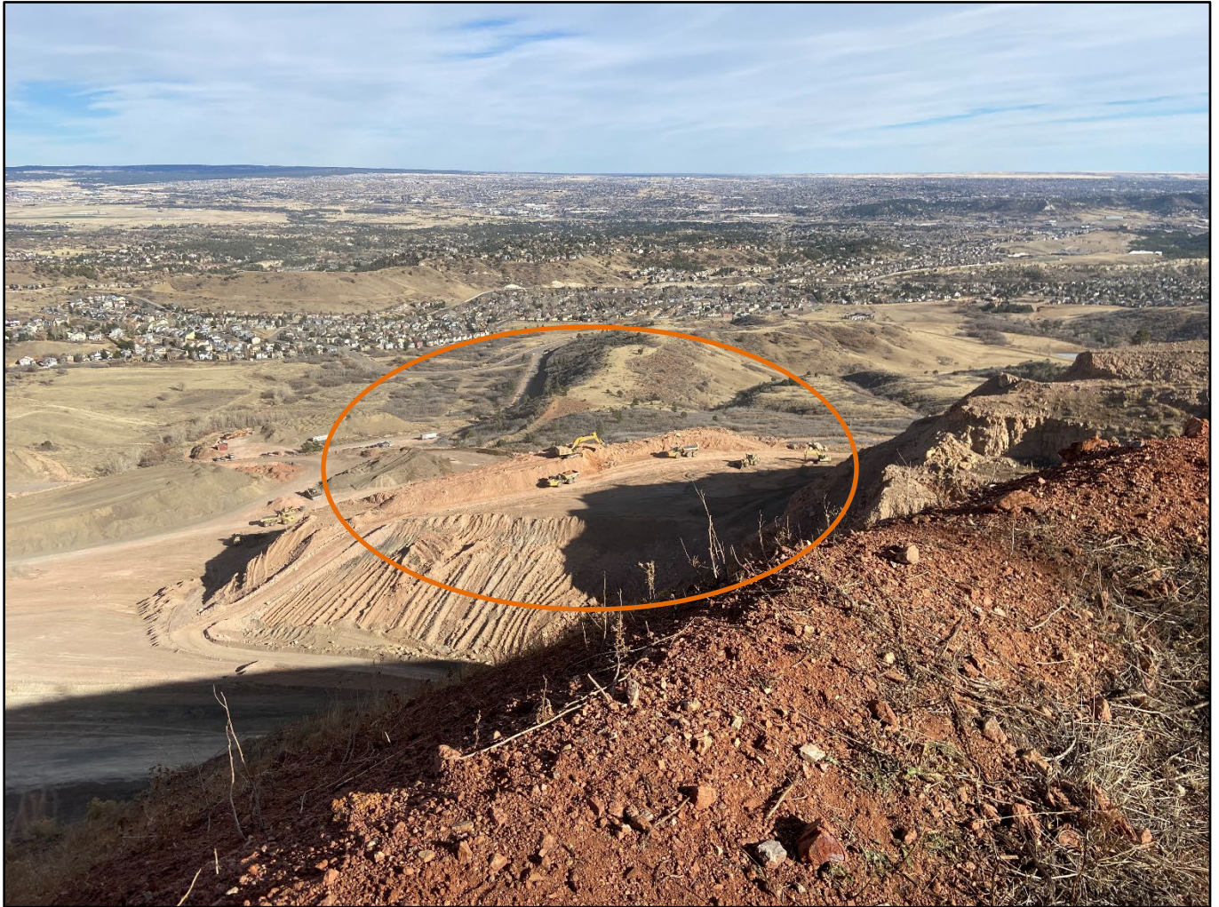
Photo 2 – Heavy equipment has been mobilized to the South Borrow area on NFS lands.