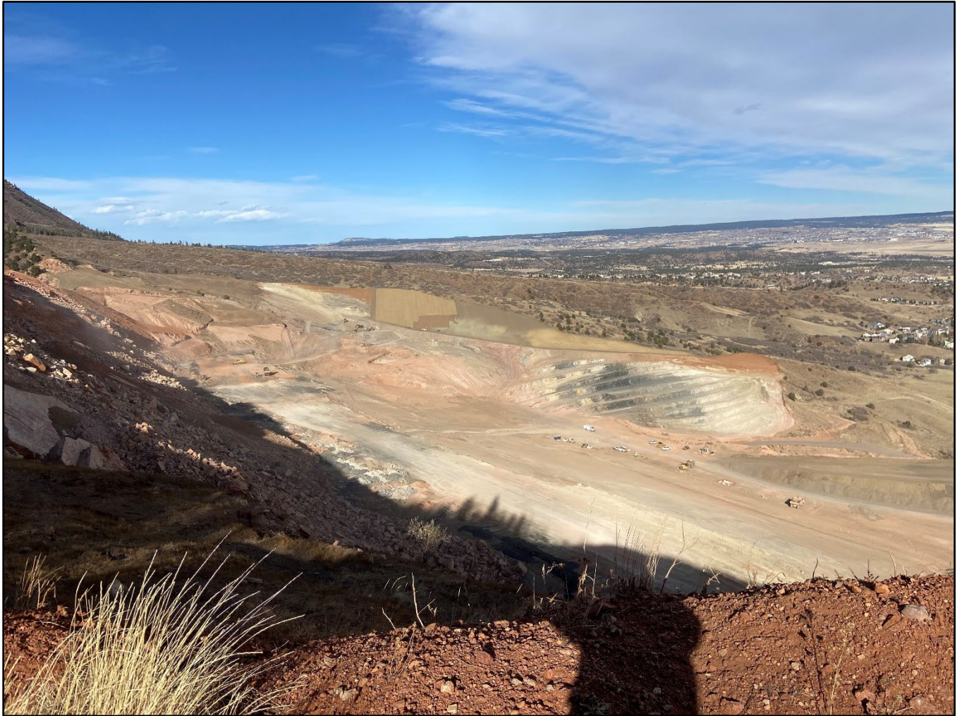
Photo 3 – Looking northeast. Primary backfilling/ excavation activities have been occurring on the private land in the north and eastern portions of the site.