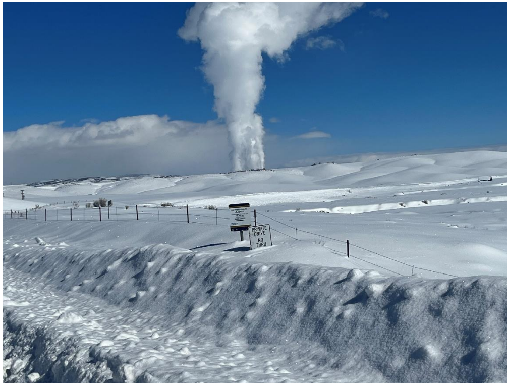
Photo 1: Mine sign and site identification located on the side of the haul road

No enforcement actions were initiated as a result of this inspection, nor are any pending.